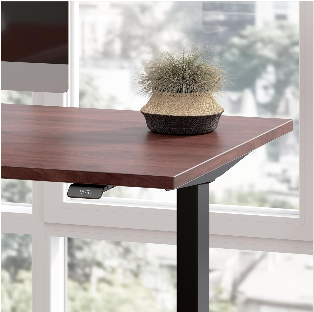
Figure 3.1: Desk control panel for height adjustment.