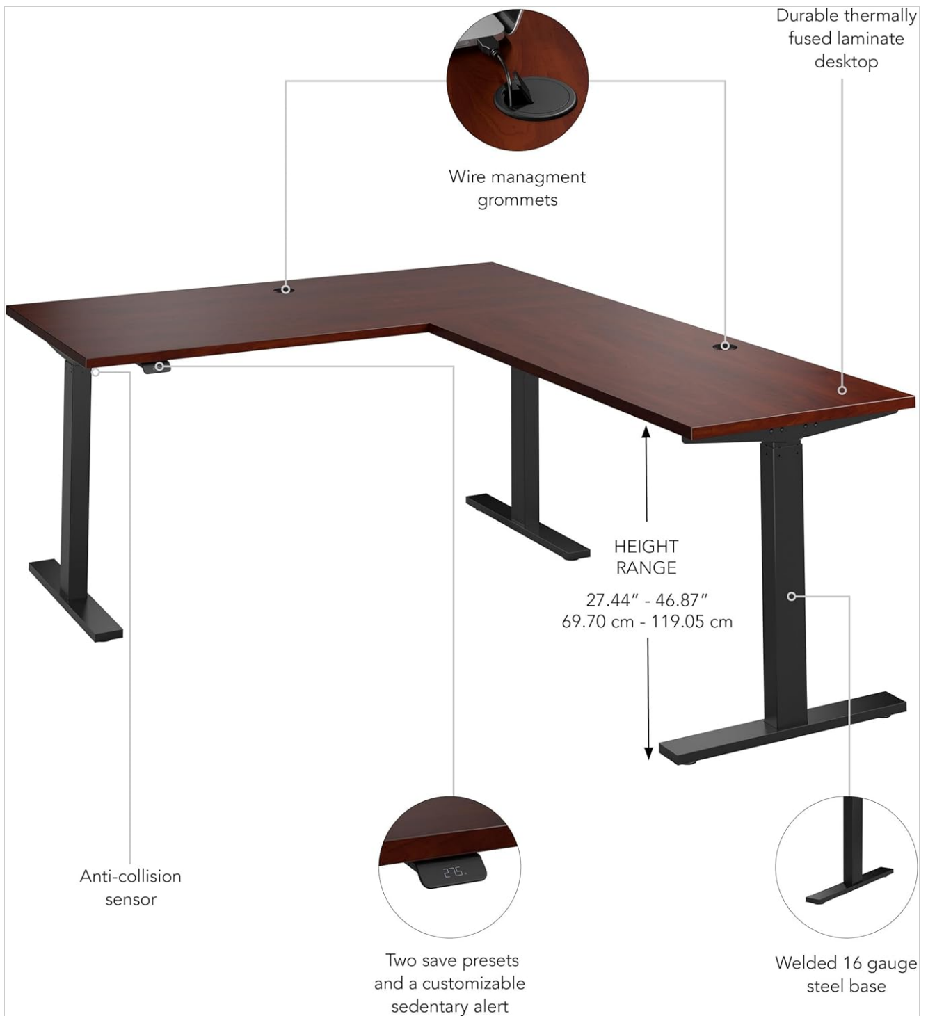
Figure 1.2: Key features and dimensions of the Move 60 Series L Shaped Standing Desk.