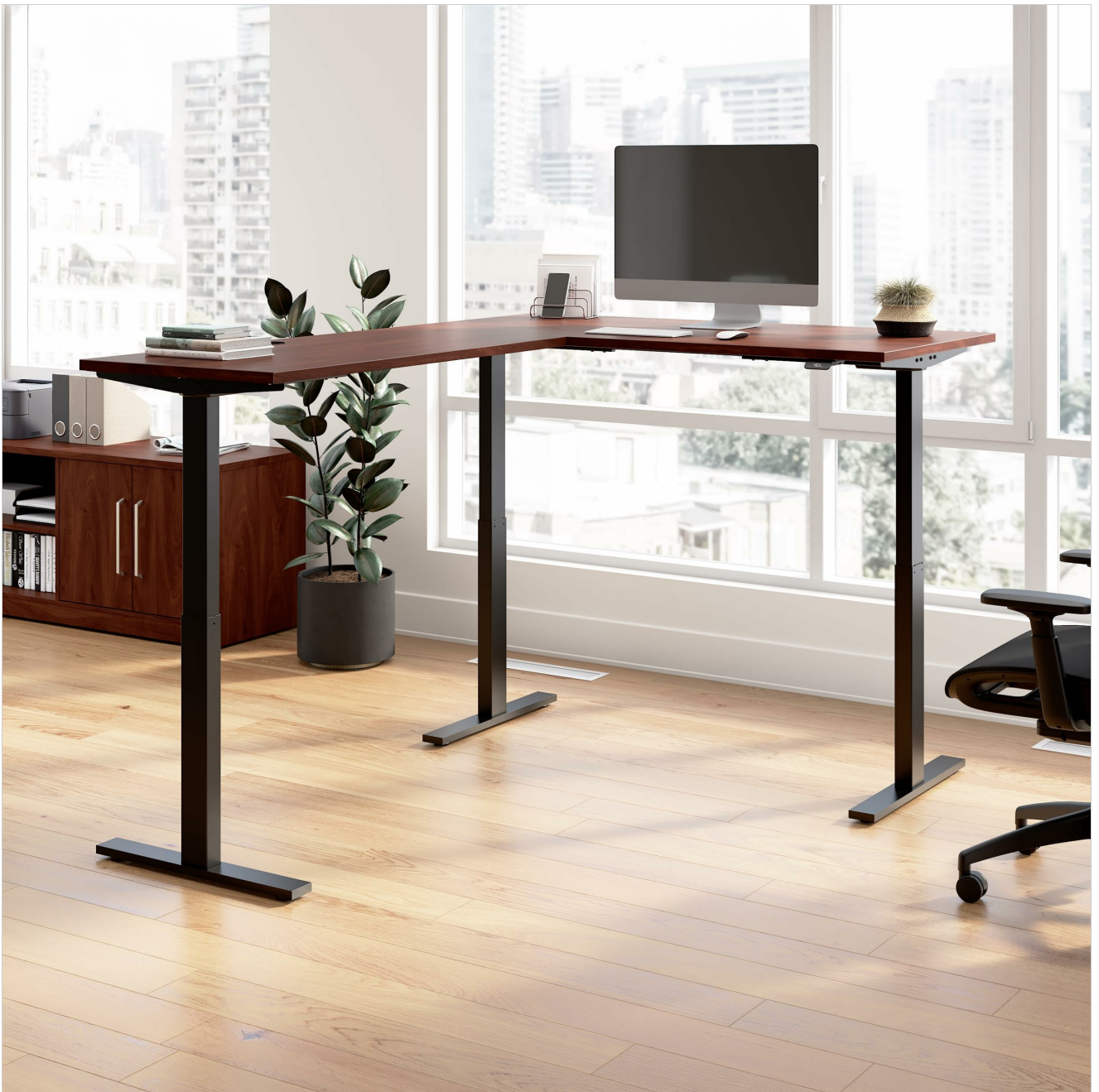
Figure 1.1: Bush Business Furniture Move 60 Series L Shaped Standing Desk (Hansen Cherry with Black Base).