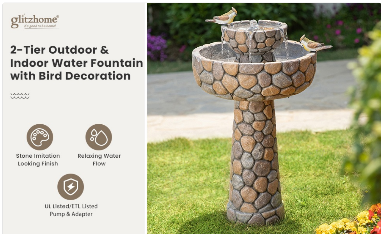
Image: The Glitzhome 2-Tier Stone Like Outdoor Water Fountain with Birds, showcasing its faux pebbles texture, relaxing water flow, and UL Listed pump and adapter.