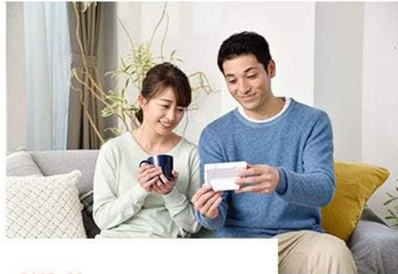
CASE. 08 夫婦で寝顔を確認