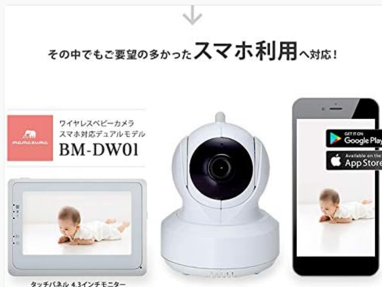
Image: Breakdown of the Tribby BM-DW01 system, illustrating the camera, the 4.3-inch touch panel monitor, and a smartphone

The system includes a camera unit, a portable dedicated monitor, and supports connection to your smartphone via a dedicated application.