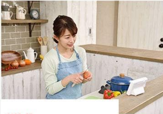
CASE. 07 夕食の準備中にも