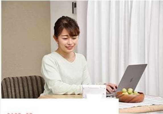
CASE. 05 テレワークをしながら