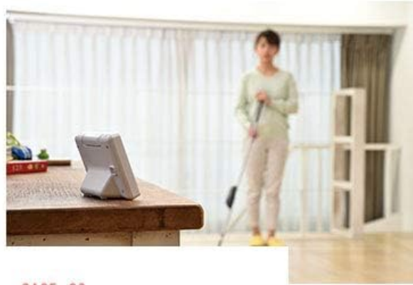
CASE. 06 両手が塞がっていても