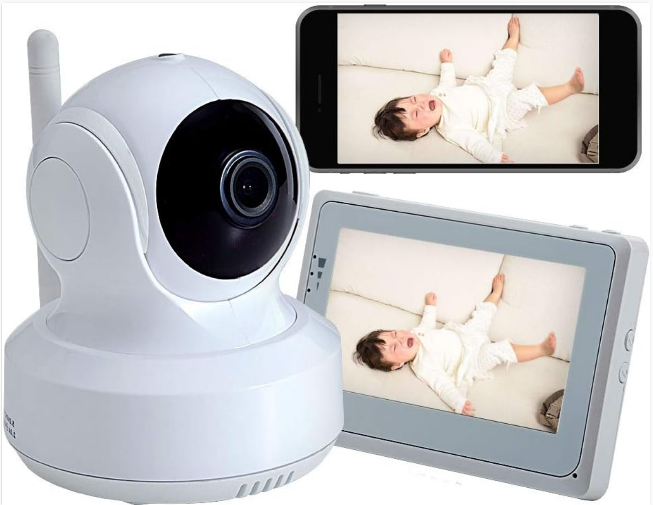
Image: The Tribby BM-DW01 baby camera system, featuring the camera unit, a dedicated 4.3-inch monitor, and a smartphone displaying live feed of a baby.

The Tribby BM-DW01 offers flexible monitoring options with its camera, dedicated monitor, and smartphone app compatibility.