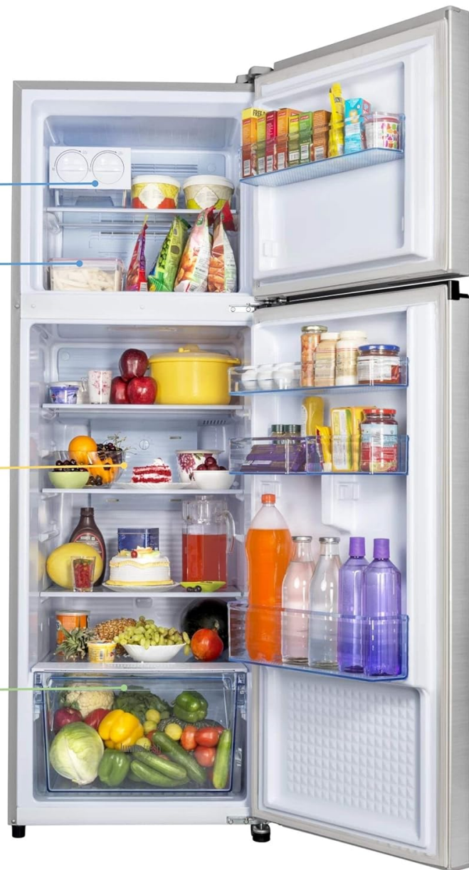
Interior view showing freezer, fridge, and Fresh Safe vegetable case with approximate temperatures.