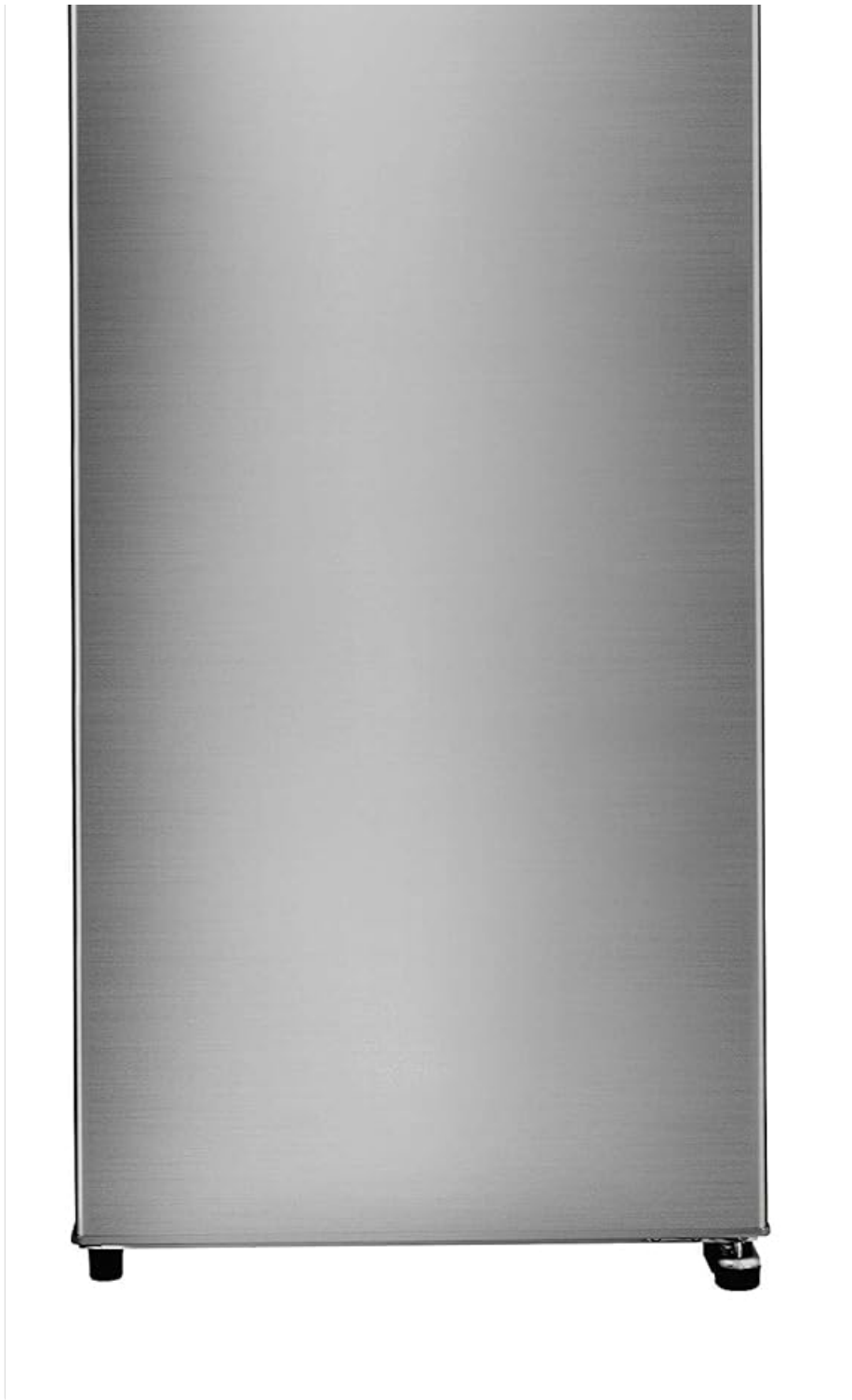
Front view of the Panasonic NR-MBG34VSS3 refrigerator in Shining Silver finish.