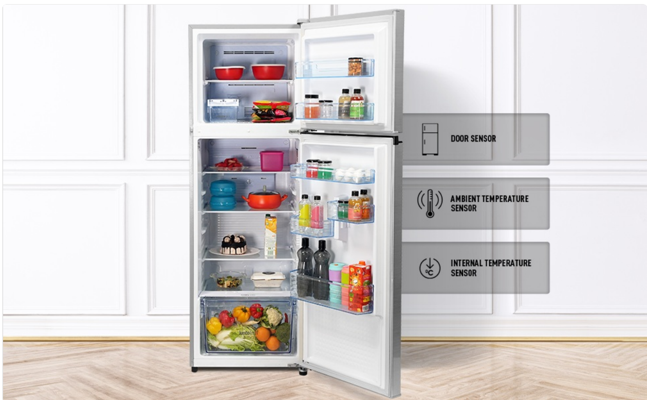
The refrigerator utilizes multiple sensors for precise temperature management.

Your refrigerator is equipped with intelligent sensors (door, ambient, internal temperature) to optimize cooling. Adjust the temperature settings using the control panel located inside the refrigerator compartment. Refer to the markings for recommended settings for different food types.