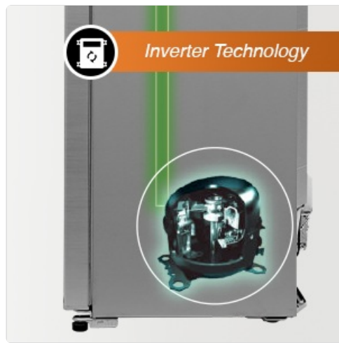
Illustration of the Inverter Technology compressor, which provides efficient cooling.