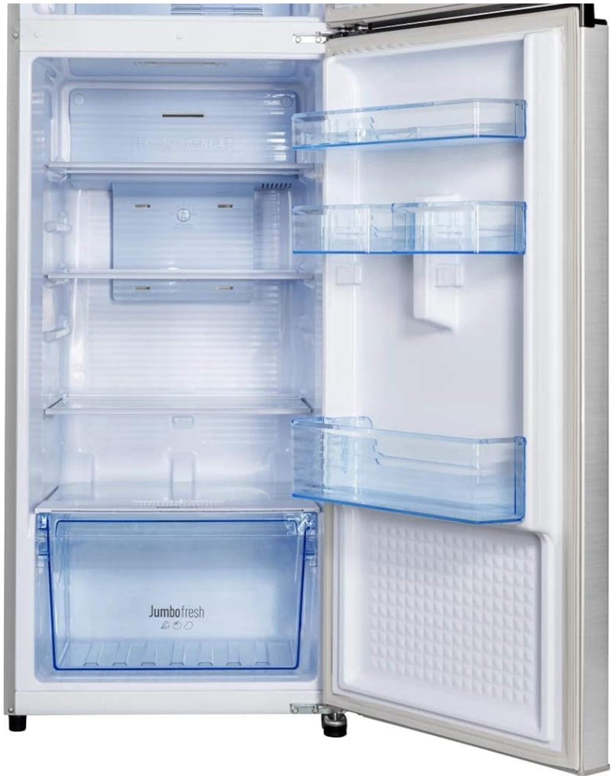
Open view of the refrigerator interior, highlighting shelves and door pockets.