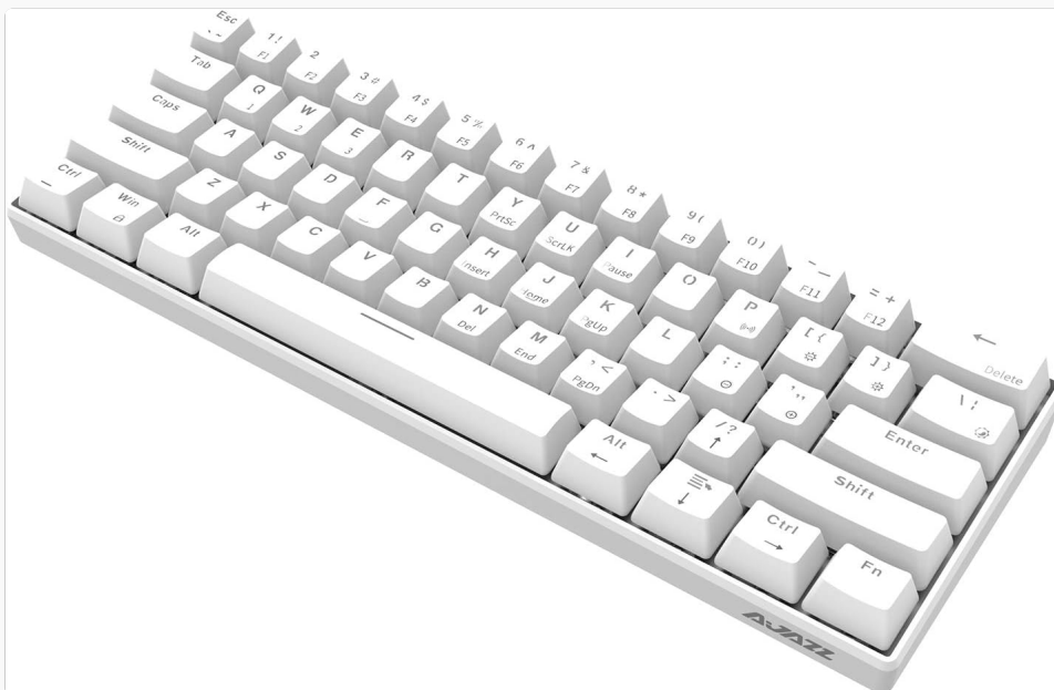
Figure 1: Angled view of the EPOMAKER Ajazz i610T mechanical keyboard, showcasing its compact 61-key layout and white keycaps.

This manual provides comprehensive instructions for the EPOMAKER Ajazz i610T 61-key mechanical keyboard. This compact keyboard features dual-mode connectivity (Bluetooth and wired USB-C), N-key rollover, and customizable backlighting. Please read this manual thoroughly to ensure proper setup and operation of your device.