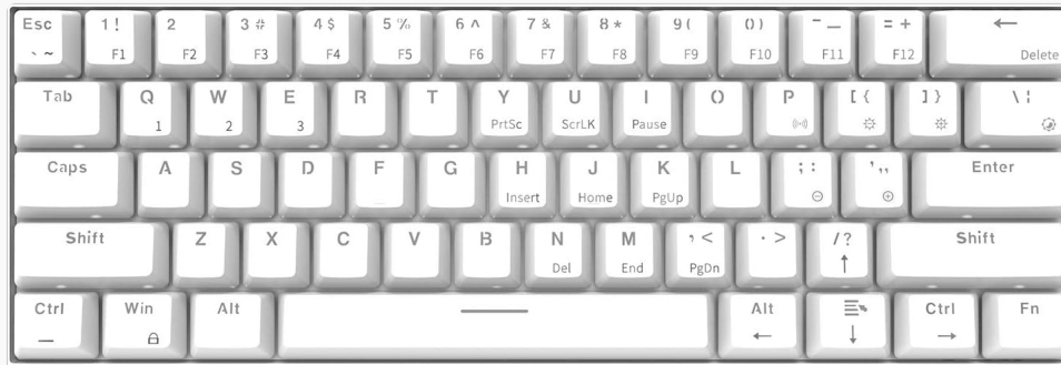
Figure 4: Top-down view of the Ajazz i610T keyboard, illustrating the 61-key layout and secondary functions marked on keycaps.