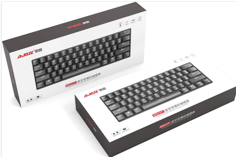
Figure 2: The retail packaging for the Ajazz i610T keyboard, indicating the product and brand.