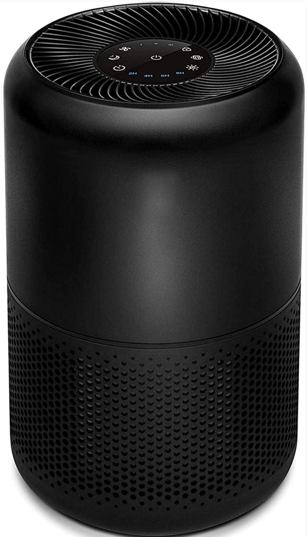
Figure 1: Levoit Core 300 Air Purifier. This image shows the sleek, black cylindrical design of the air purifier, with its top control panel visible, featuring various touch-sensitive icons for operation.