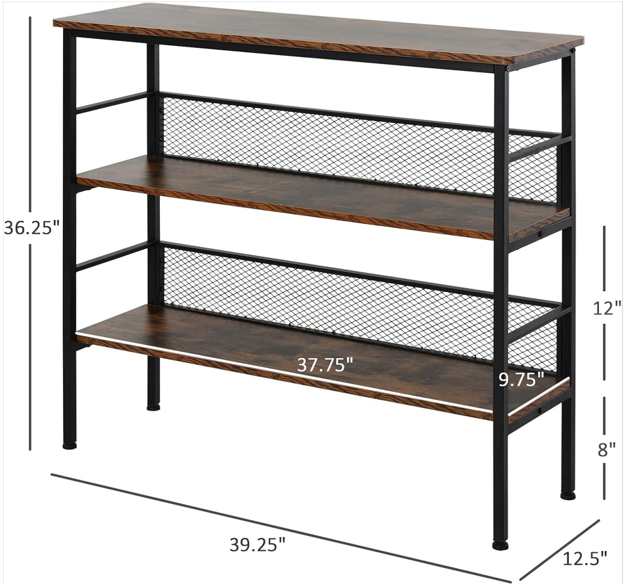
Image: Dimensional diagram of the console table.