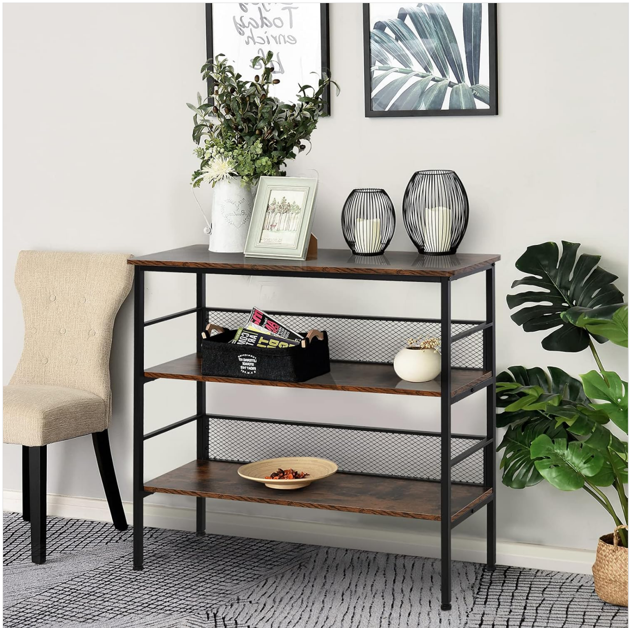
Image: The HOMCOM 3-Tier Industrial Console Table, fully assembled and styled in a room.