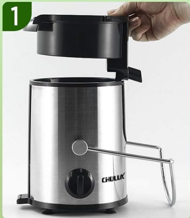
1 Install the juicer outlet