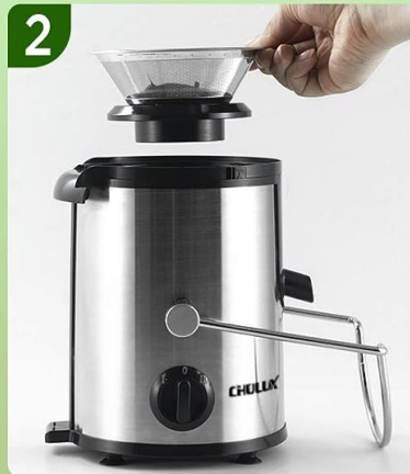
2 Place the filter basket