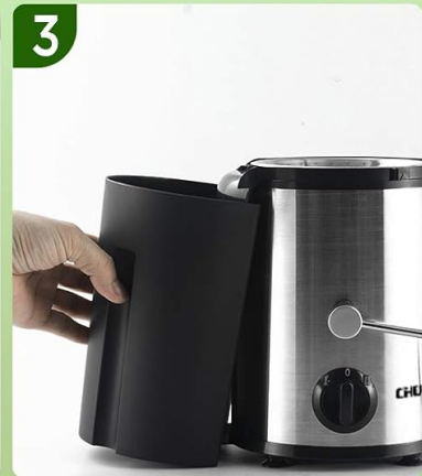
3 Place pulp container