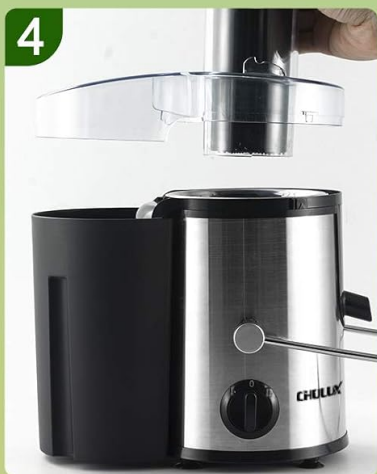
4 Install the feeding chute