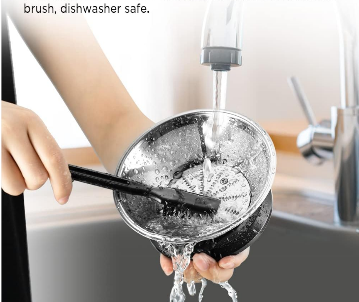
Image: A hand using a brush to clean the stainless steel filter basket under running water, demonstrating the ease of

Convenient to take down the filter to clean with attached brush, dishwasher safe.