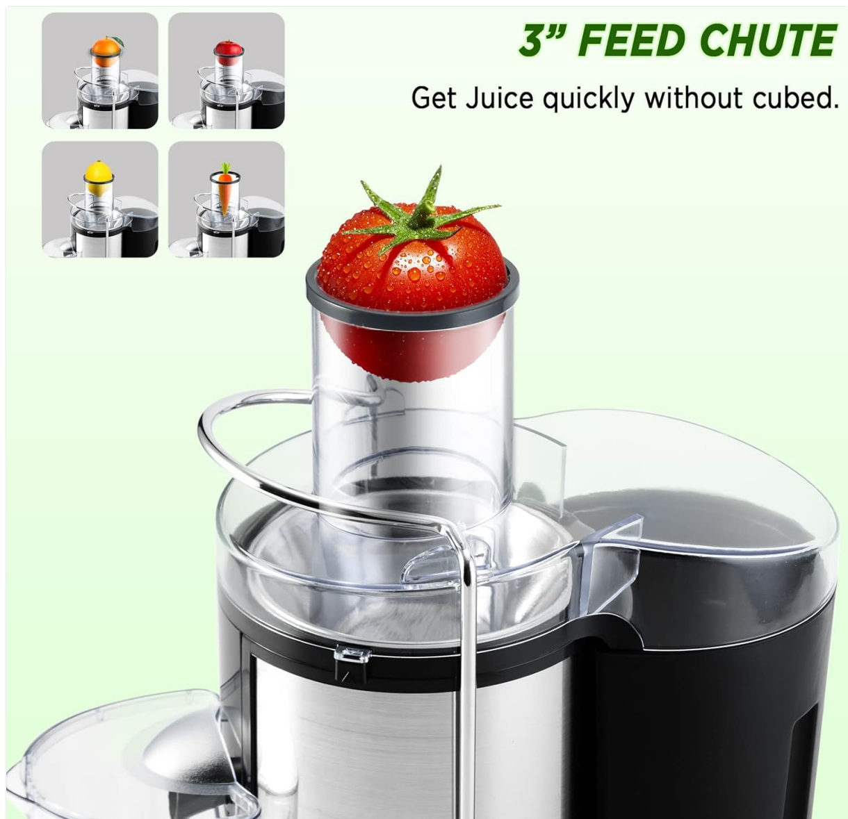
Image: Overview of the CHULUX Centrifugal Juicer Machine with its main components visible.