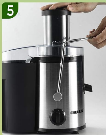
5 Lift the protection arm upwards to secure