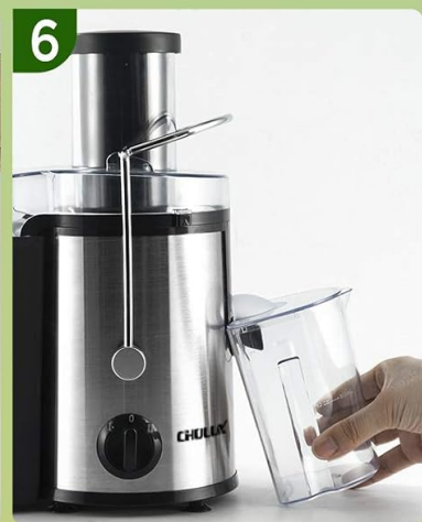
6 Place the juicer cup under juice spout

Image: A visual guide showing six steps for assembling the juicer, from installing the outlet to securing the safety arm and placing the juice cup.