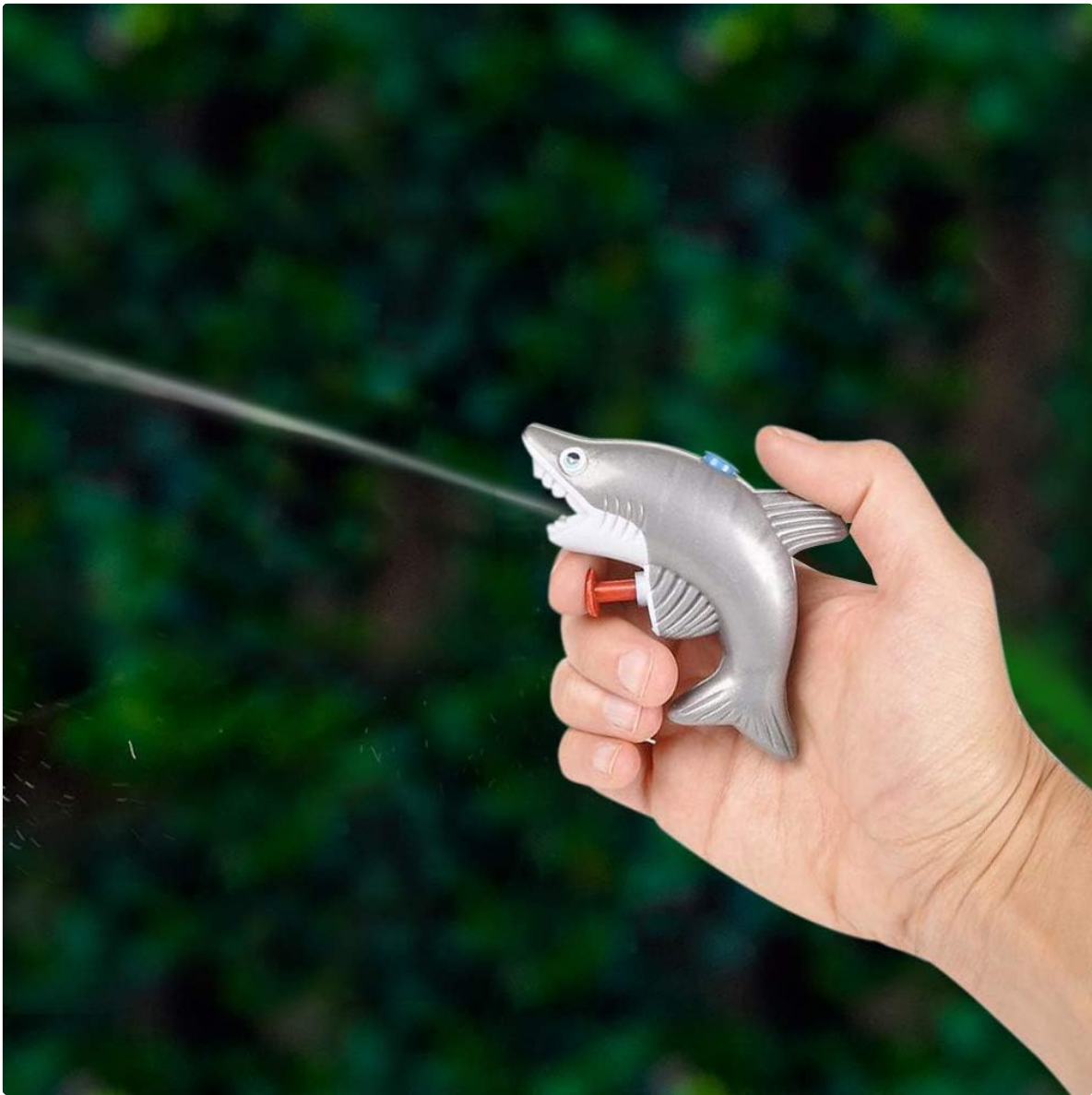
Figure 3: A hand demonstrating how to operate the shark water squirter by squeezing the trigger to emit water.