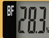
Body fat %

bio-impedance analysis (BIA) with 4-user memory measures each user's body fat, body water, and bone mass; also displays body mass index (BMI)