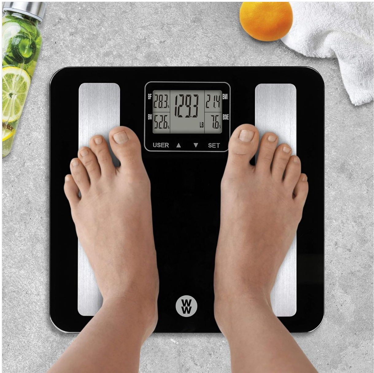
Image: A person standing on the Conair WW702XF scale, with the digital display showing various body analysis metrics like body fat, body water, BMI, and bone mass.