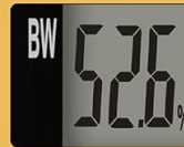
Body water %