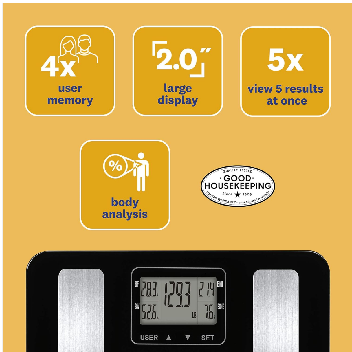
Image: Overview of the scale's key features, including 4-user memory, 2.0-inch large display, ability to view 5 results at once, and body analysis capabilities.