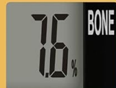
Bone mass %