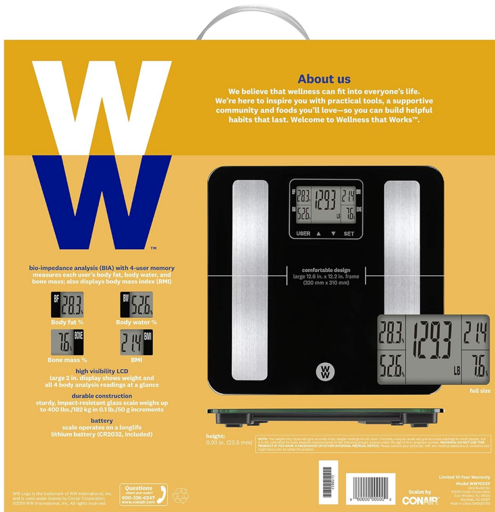
Image: Product packaging for the Conair WW702XF scale, highlighting features, dimensions, and indicating a Limited 10-Year Warranty and the Conair website for questions.

Online Support: Visit www.conair.com for additional resources and contact information.