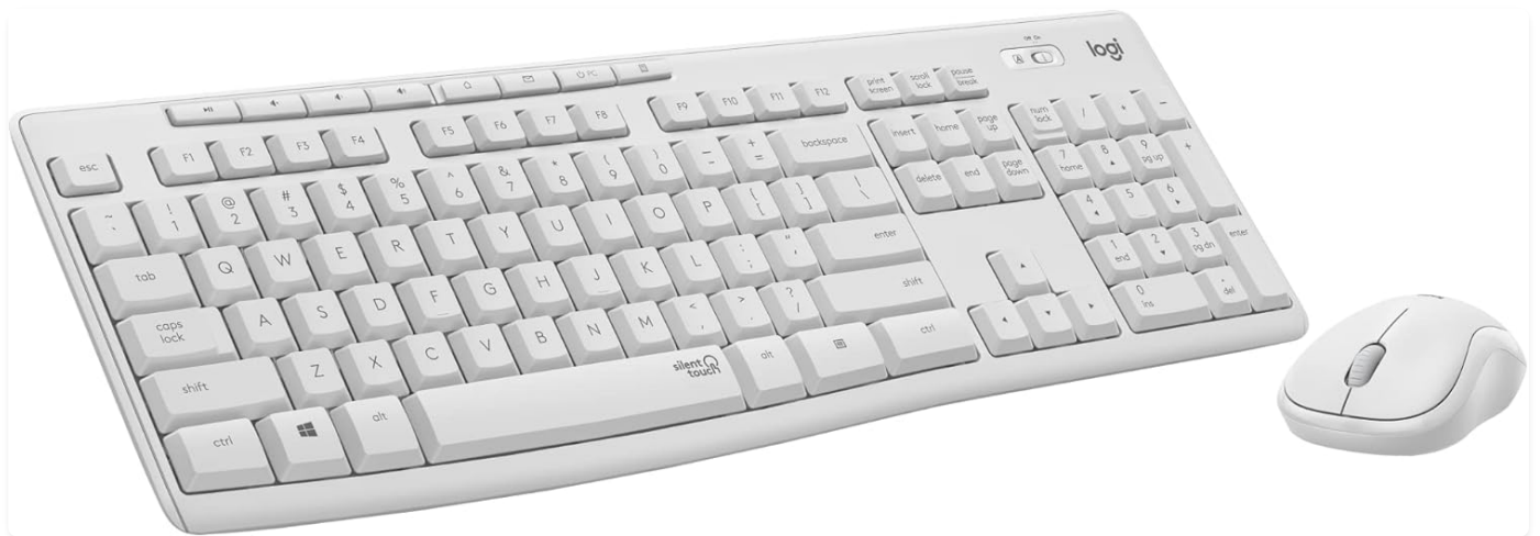
Image: The Logitech MK295 Wireless Keyboard and Mouse Combo in Off White.

The Logitech MK295 Silent Wireless Combo offers a quiet and efficient computing experience. This keyboard and mouse set features SilentTouch technology, significantly reducing typing and clicking noise while maintaining a familiar tactile feel. Designed for reliability and comfort, it provides a strong 2.4 GHz wireless connection with a 10-meter range, ensuring a clutter-free workspace. This manual provides detailed instructions for setup, operation, and maintenance of your MK295 combo.