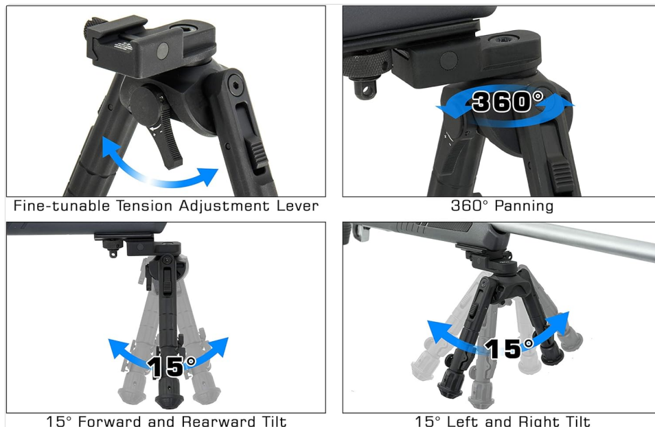
Figure 3: Illustrates the three adjustable leg positions for varied terrain and shooting stances.

The bipod legs feature 3 position folding capabilities, allowing for forward, backward, or vertical adjustments.