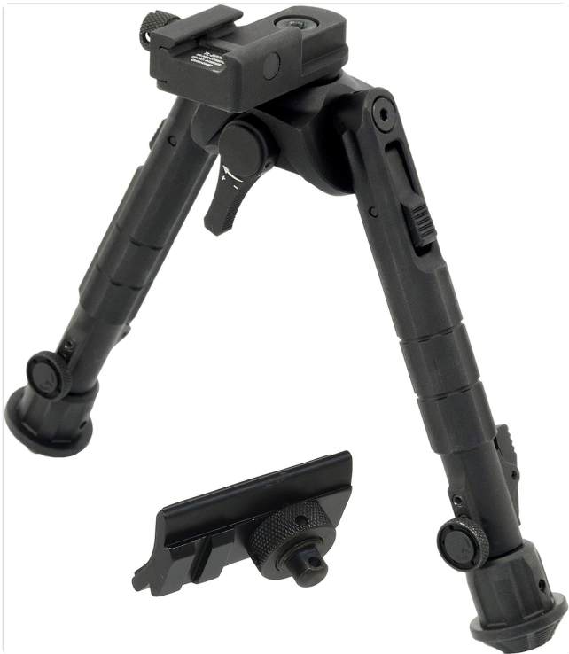
Figure 1: UTG Recon 360 TL Bipod with included Picatinny mount adapter.

This manual provides detailed instructions for the proper setup, operation, and maintenance of your UTG Recon 360 TL Bipod. Designed for stability and versatility, this bipod features durable aluminum construction, adjustable leg positions, and a tension-adjustable 360° panning and 15° tilt function. Please read this manual thoroughly before use to ensure optimal performance and safety.