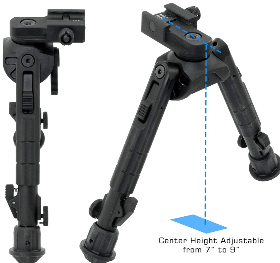
Figure 4: Demonstrates the adjustable center height range of the bipod.

The bipod's center height is adjustable from 7 inches to 9 inches, with lockable leg extensions.