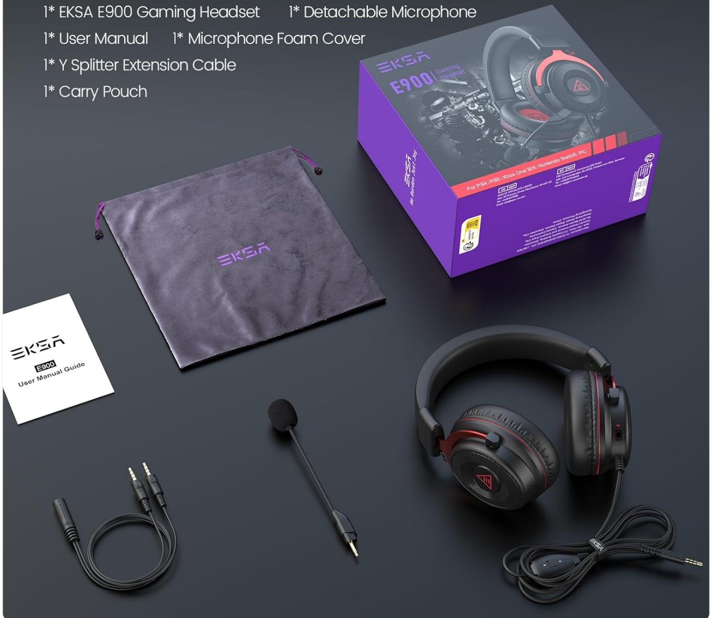
Image: All components included in the EKSA E900 Gaming Headset package: headset, detachable microphone, user manual, Y splitter cable, and carry pouch.