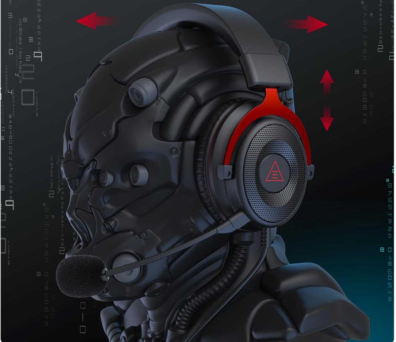
Image: An illustration showing the adaptive suspension head beam design and how to adjust the headset for a comfortable fit.