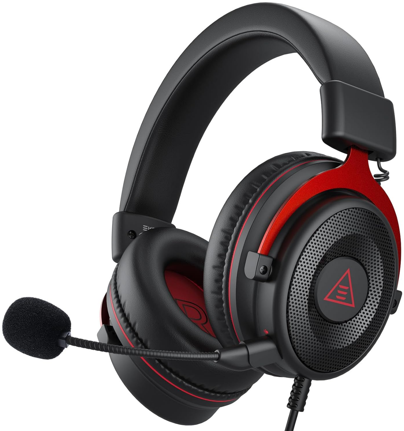
Image: The EKSA E900 Wired Stereo Gaming Headset in red and black, featuring over-ear cups and a detachable microphone.