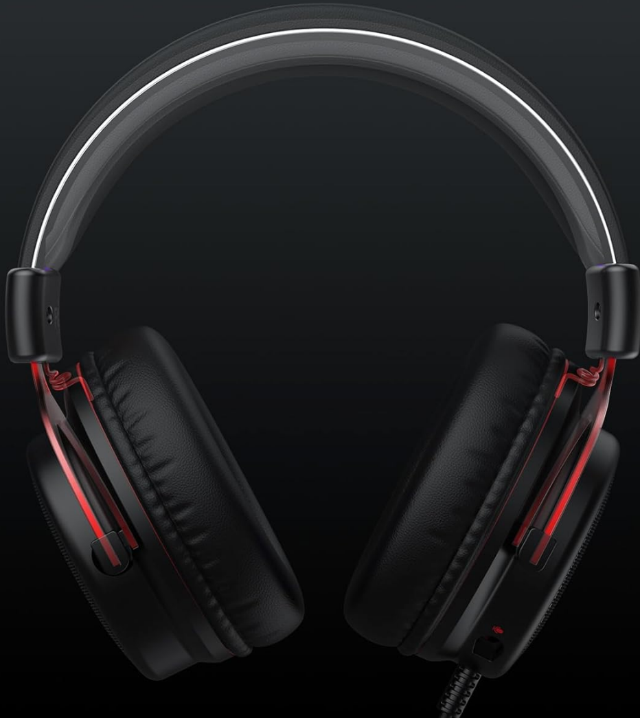
Image: A close-up of the adjustable metal headband, highlighting its flexibility and durability.