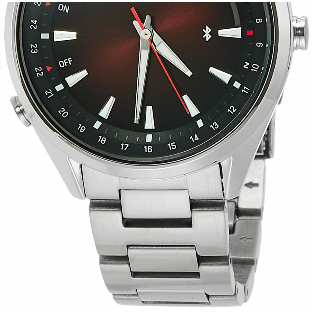
Figure 1: The Wired AGAB412 Men's Wristwatch with a silver bracelet and red dial, worn on a wrist. This image illustrates the watch's appearance and how it sits on the wearer's arm.