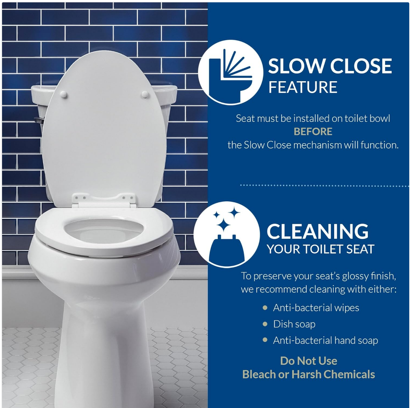
Figure 4: Cleaning recommendations for your toilet seat.