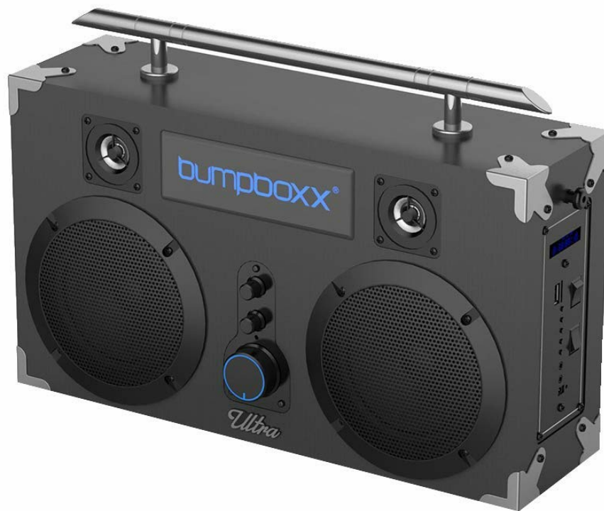
Figure 1: Front view of the Bumpboxx Ultra Bluetooth Boombox.