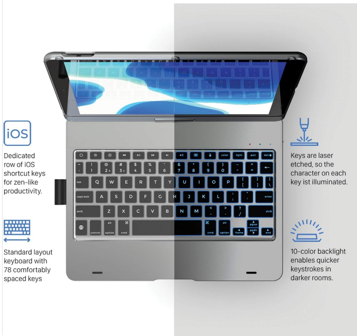
Image 4.3: Details of the backlit keyboard, highlighting iOS shortcuts and illuminated keys.