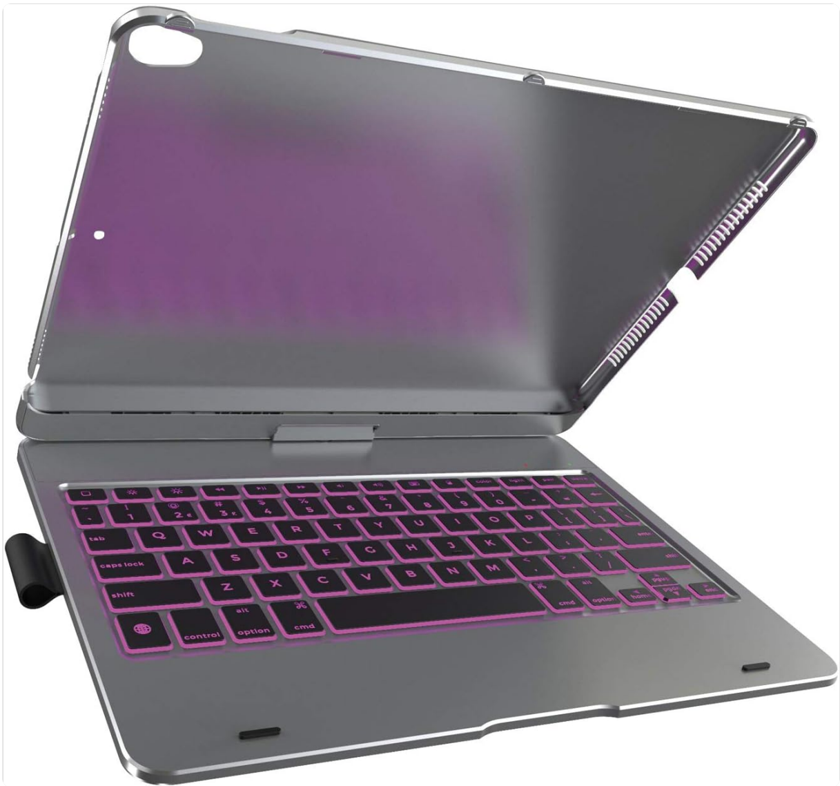
Image 1.1: The typecase Keyboard Case in laptop mode with the keyboard illuminated in purple.