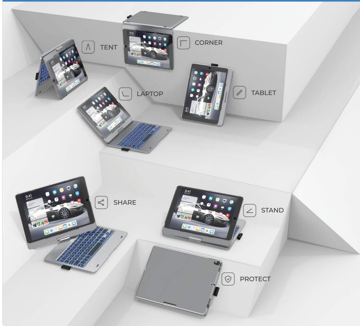
Image 4.2: Illustration of the 7 unique modes supported by the keyboard case.