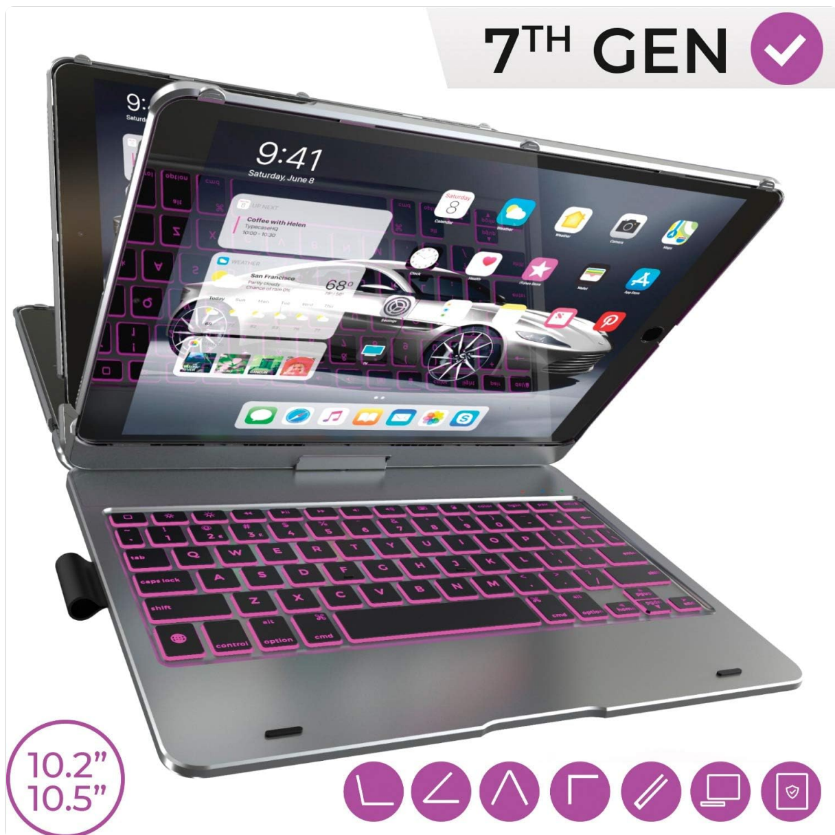
Image 3.1: Visual representation of iPad compatibility with the case, highlighting 7th Gen, 10.2-inch, and 10.5-inch models.