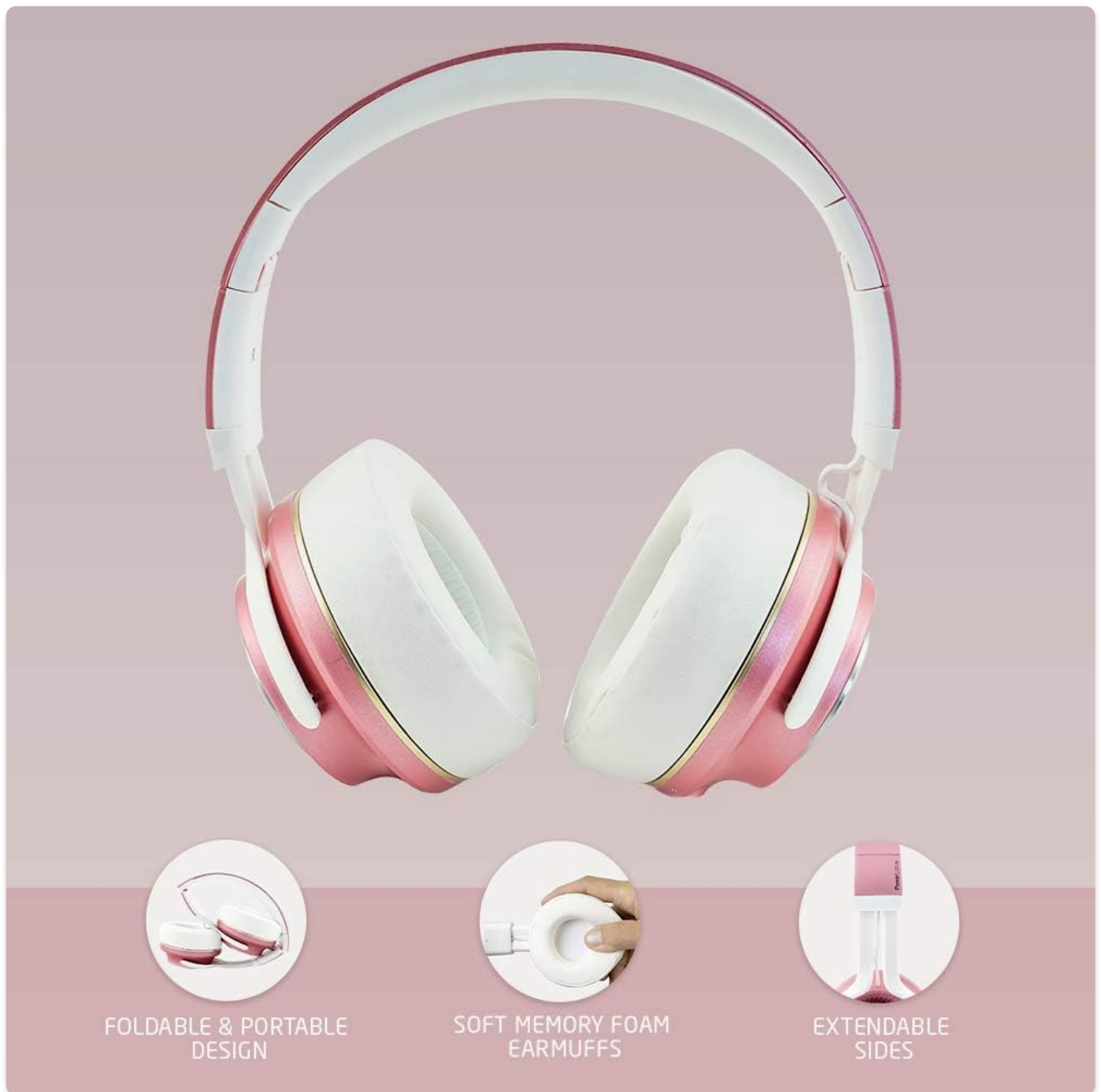
Figure 4: Design features emphasizing comfort and portability.