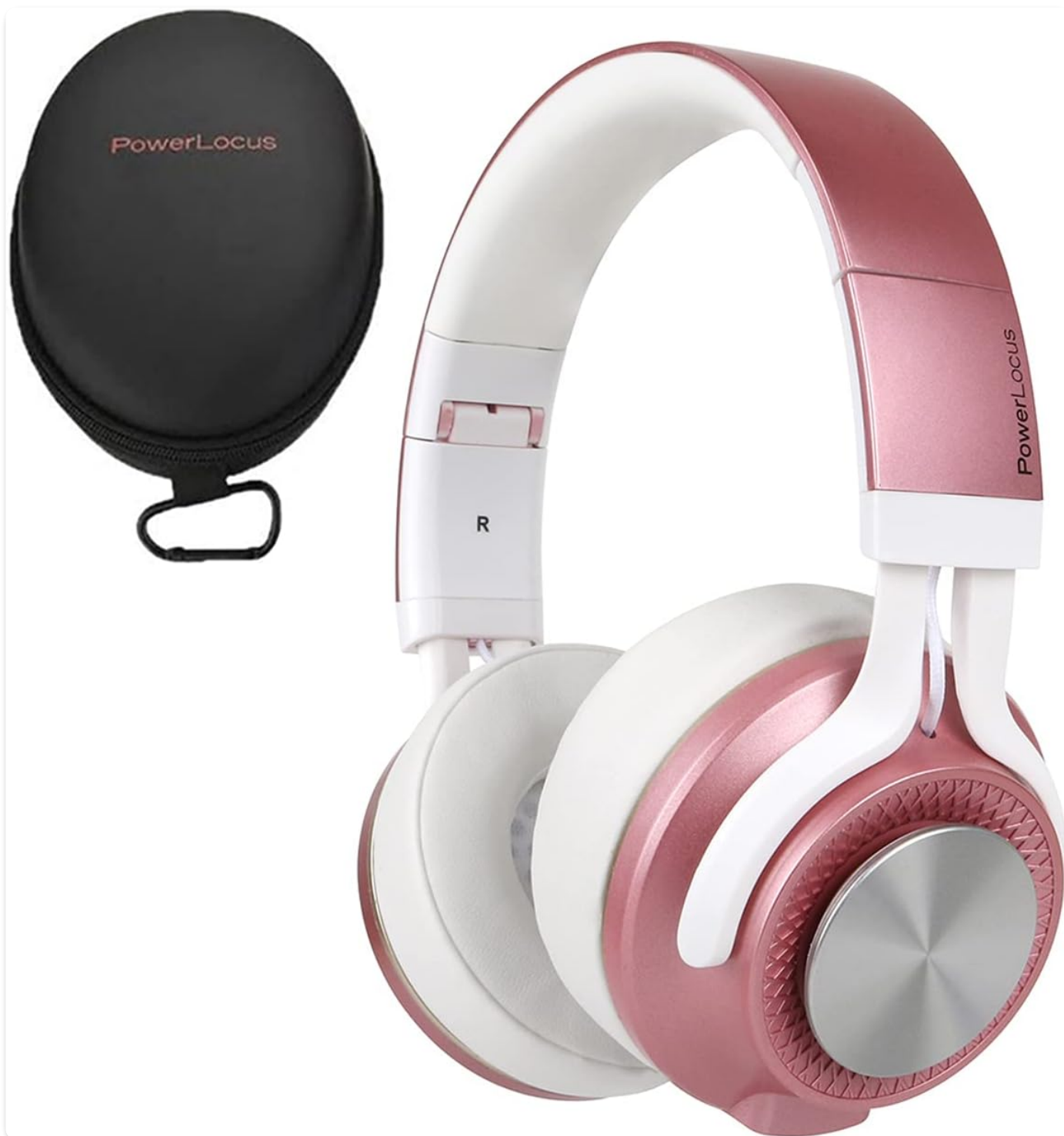
Figure 1: PowerLocus P3 Bluetooth Headphones with included protective carrying case.