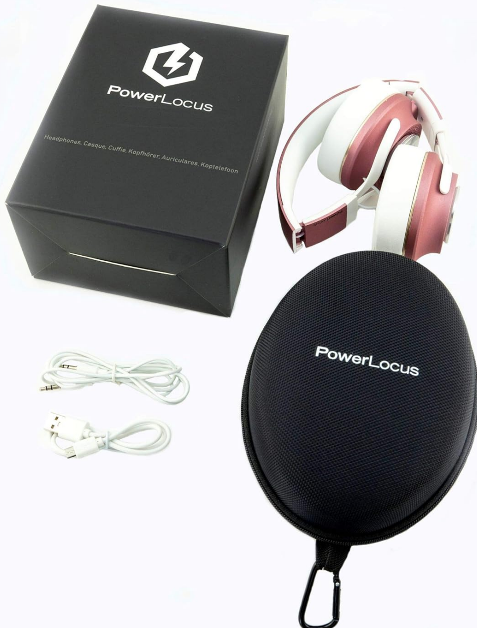
Figure 2: All items included in the PowerLocus P3 headphone package.