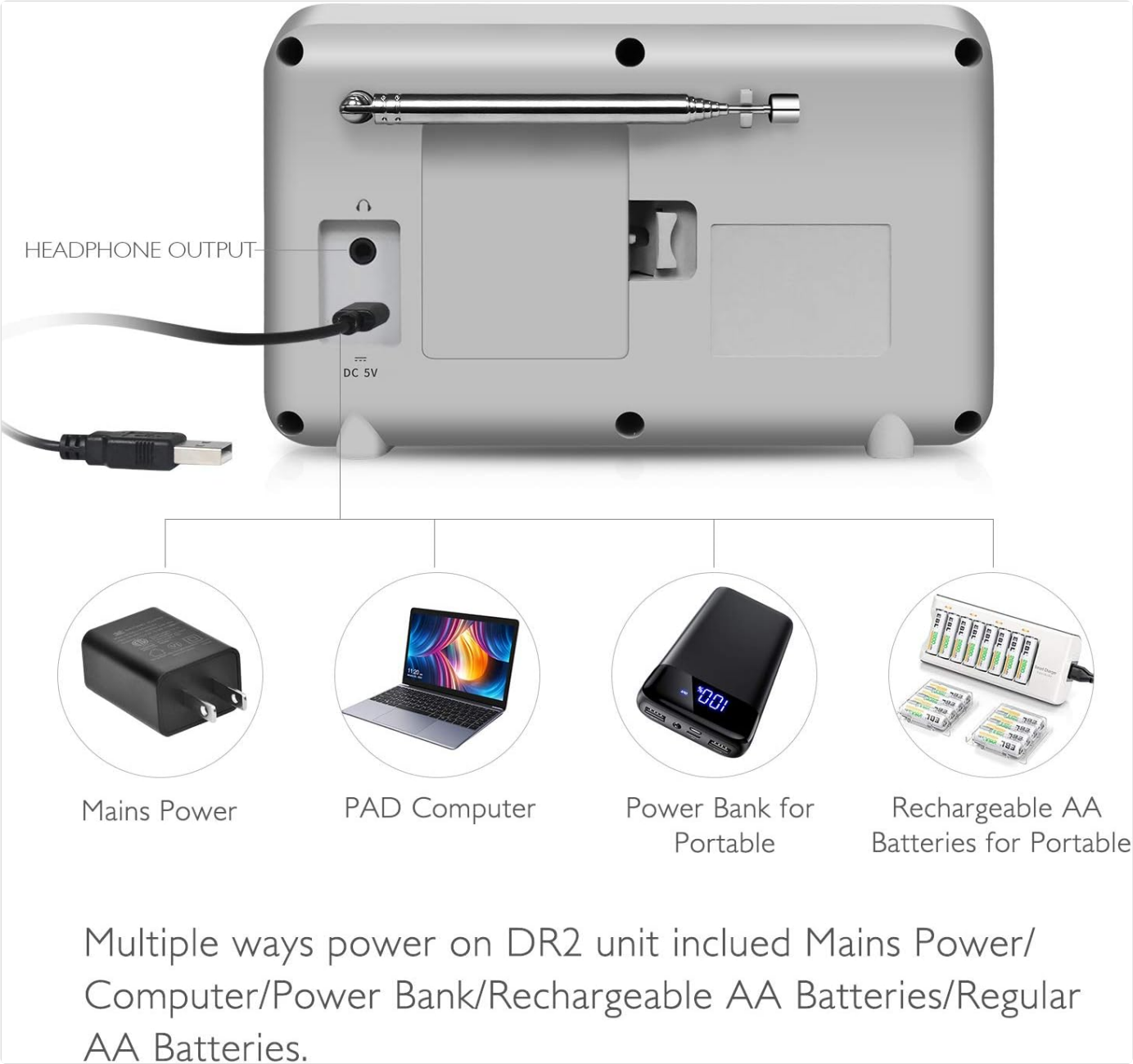
Figure 3.1.1: Powering options for the LEMEGA DR2. The image shows the rear of the radio with the headphone output and DC 5V USB port. Below, icons illustrate various power sources: a wall adapter for mains power, a laptop for computer power, a portable power bank, and rechargeable AA batteries, demonstrating the radio's versatile power capabilities.