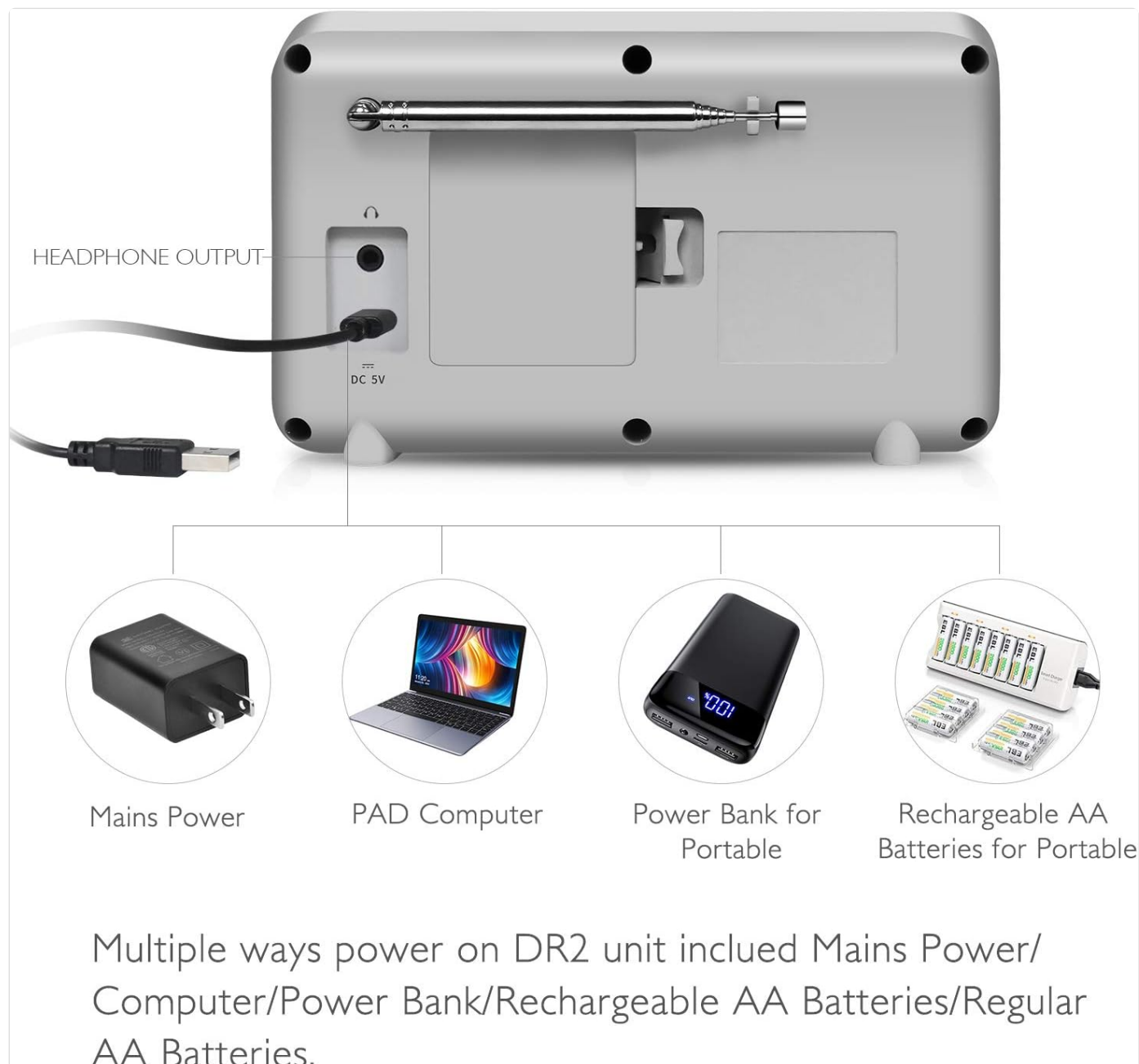
Figure 4.4.1: Headphone output on the LEMEGA DR2. This image shows the rear of the radio with a headphone cable plugged into the "HEADPHONE OUTPUT" jack, illustrating the private listening capability.

Connect standard 3.5mm headphones to the headphone output jack on the rear of the radio for private listening. The radio's speaker will mute automatically when headphones are connected.