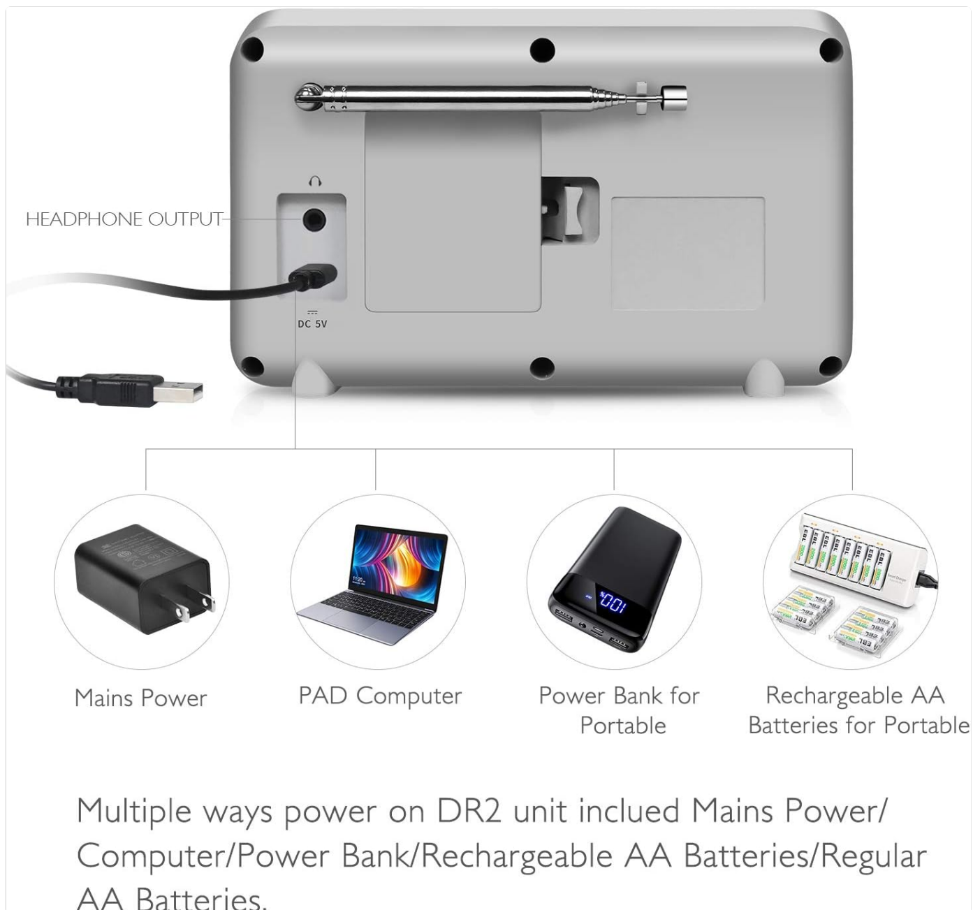
Figure 2.2.2: Rear view of the LEMEGA DR2 radio. This image highlights the headphone output jack, the DC 5V USB power input, and the telescopic antenna extended upwards. Below the radio, illustrations show various power sources: a wall adapter for mains power, a laptop for computer power, a portable power bank, and rechargeable AA Batteries, indicating multiple ways to power the unit.