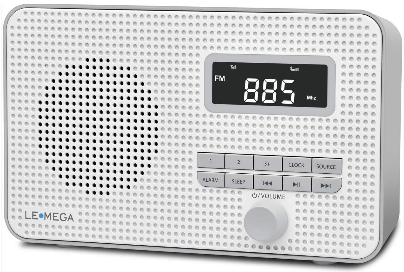
Figure 2.2.1: Front view of the LEMEGA DR2 Portable AM/FM Digital Radio. This image displays the main speaker grille on the left, the digital display showing "FM 88.5 Mhz" on the right, and a panel of control buttons below the display. A large volume knob is located at the bottom center.