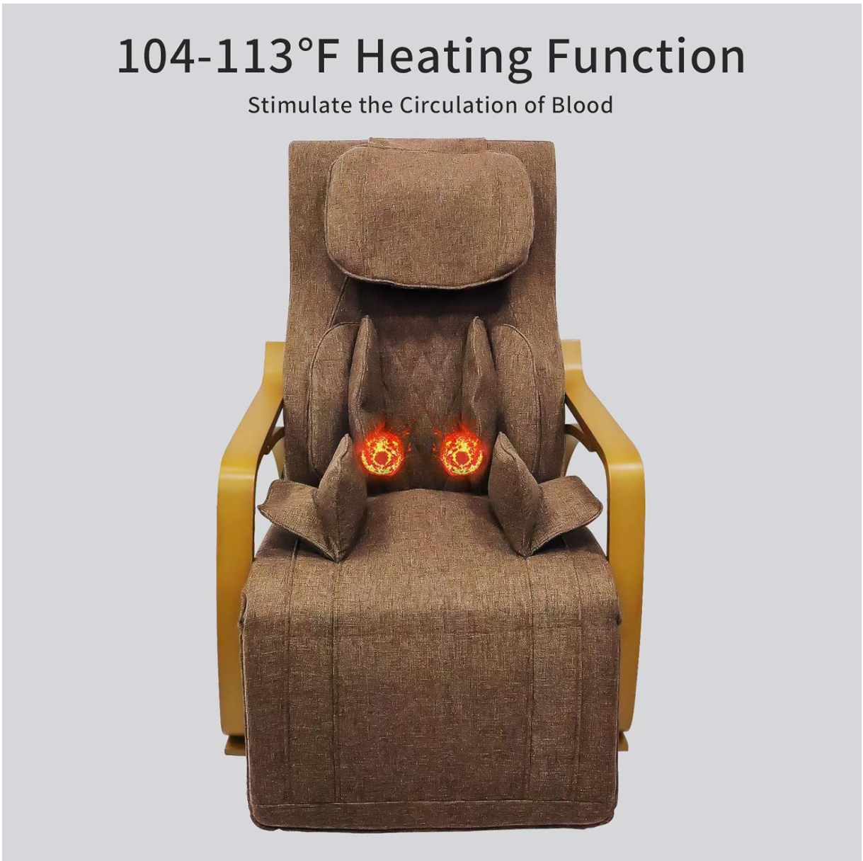
Image: The Furgle massage chair with an overlay indicating the 104-113°F heating function, designed to stimulate blood circulation.