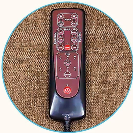
Smart Remote Controller