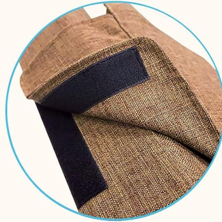
Easy Care Linen Fabric