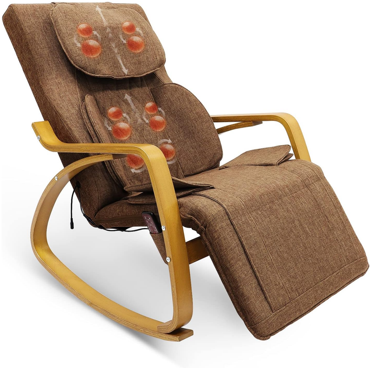
Image: The Furgle Electric Massage Recliner Chair in its assembled state, showcasing its brown fabric and wooden frame.