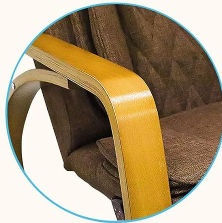
23.6 Wide Curved Birch Armrest

Image: The Furgle massage chair demonstrating its leisure rocking design and 102-degree recline angle, highlighting features like 5-angle relaxation leg and pressure dispersion.