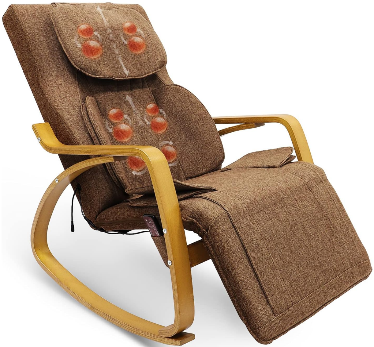
Image: A close-up view of the Furgle massage chair, illustrating the areas where massage and heating elements are located, indicated by glowing orange circles.