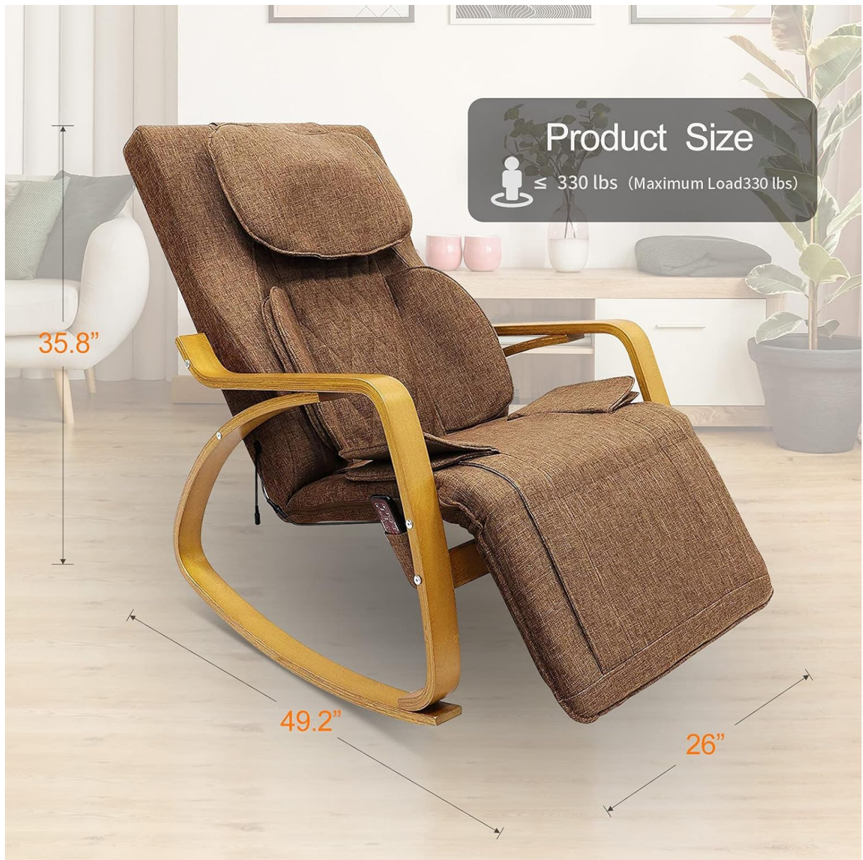
Image: Diagram showing the dimensions of the Furgle massage chair, including height (35.8"), width (26"), and depth (49.2"), with a maximum load capacity of 330 lbs.