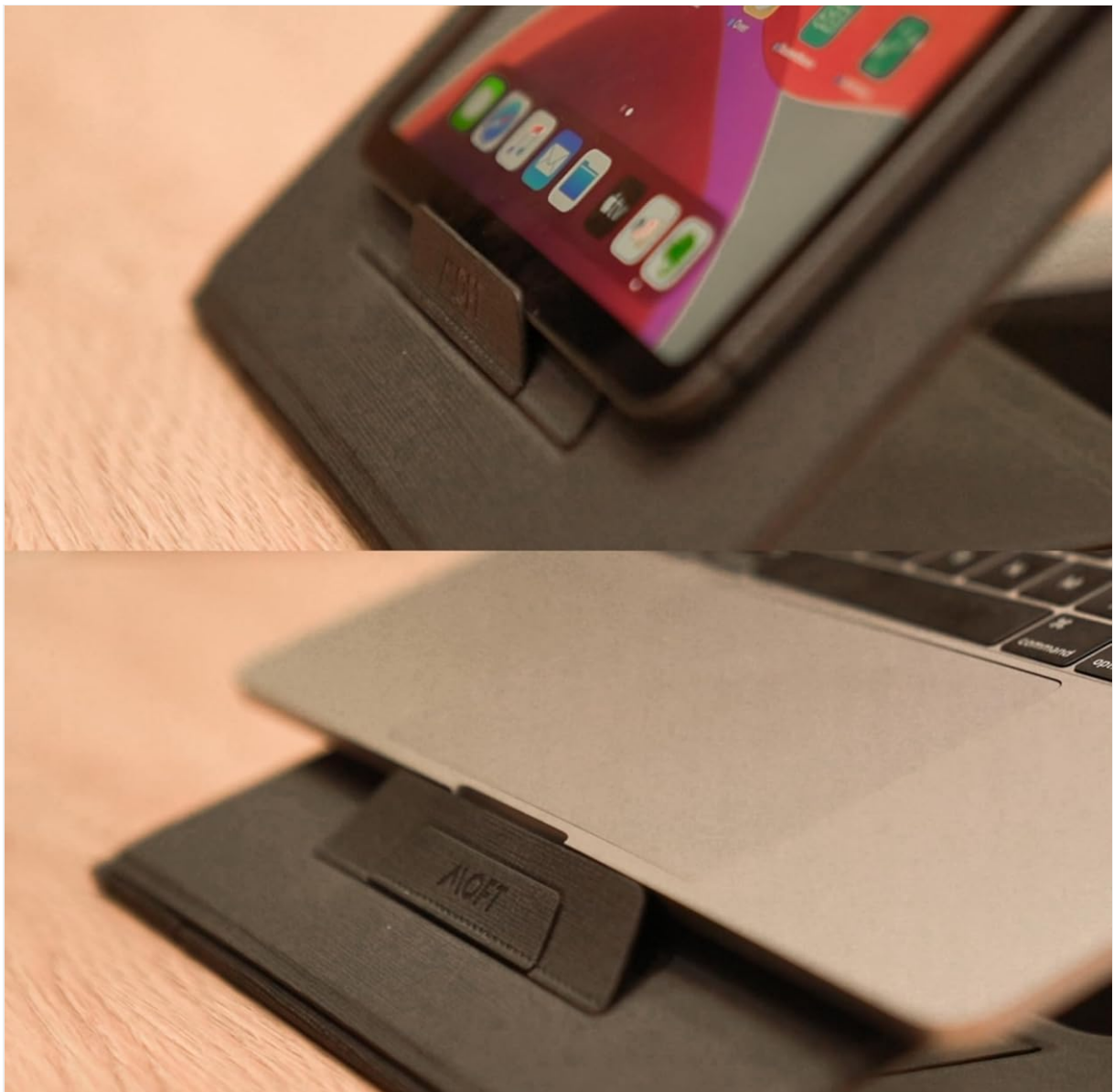
Image: Stand Attached to Laptop

Text Description: This video demonstrates the process of attaching the MOFT stand to a laptop and showcasing its various folding configurations for different uses. It highlights the slim profile when folded and the ease of deployment.