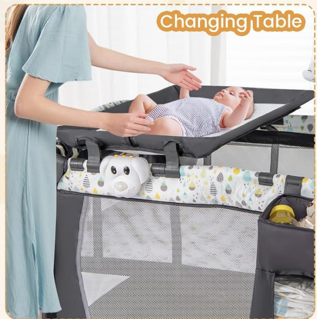
Figure 5.1: The 3-in-1 design of the Pack and Play.