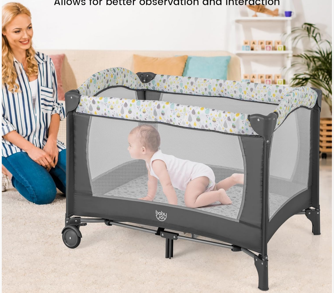
Figure 5.2: Breathable mesh on all sides for visibility and air flow.

Allows for better observation and interaction