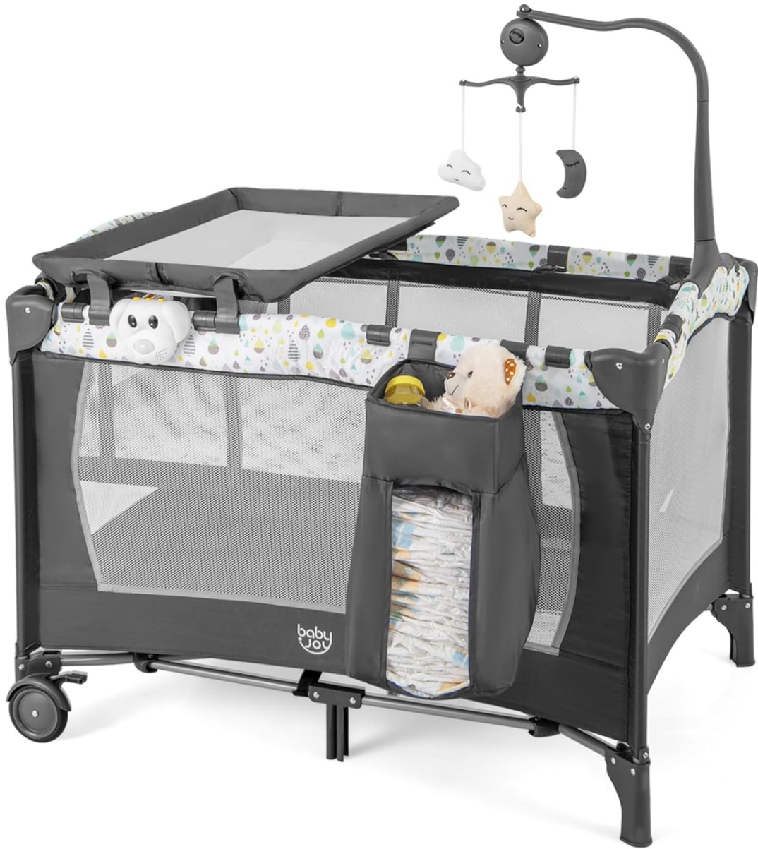
Figure 4.2: Fully assembled Pack and Play.