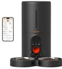
Image: A visual representation of WOPET's 24-hour customer service.