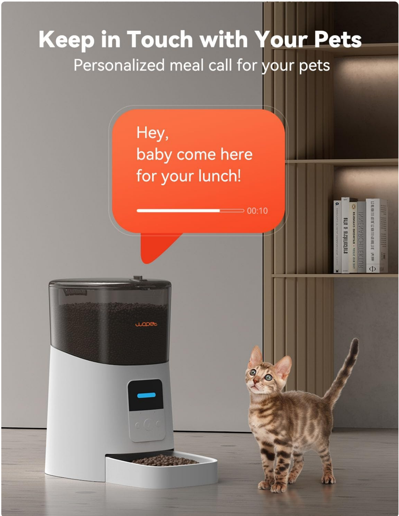
Image: A cat looking towards the feeder, with a voice bubble demonstrating the personalized meal call feature.

4. The recorded message will play automatically when food is dispensed.