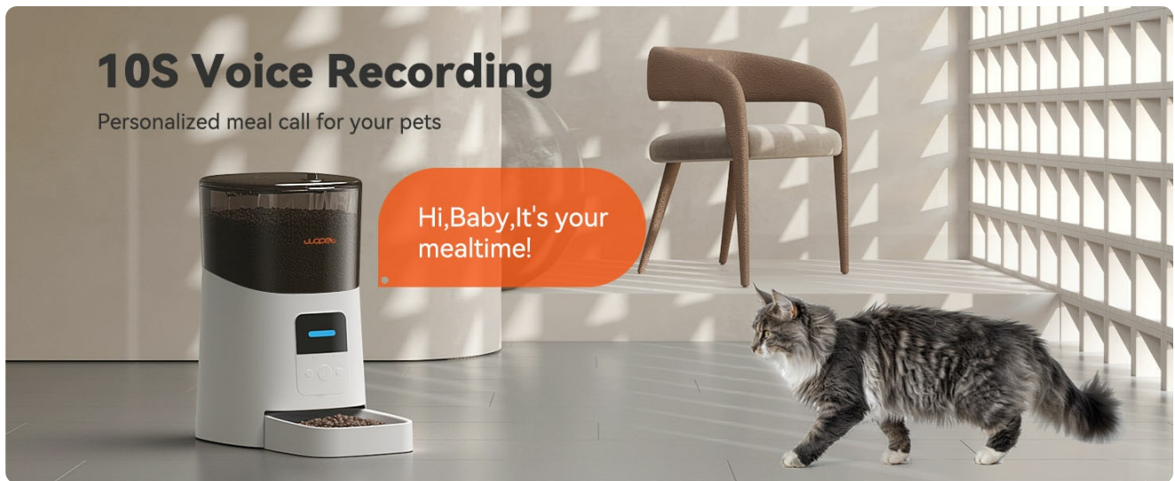
Image: A visual representation of the 10-second voice recording feature, showing the feeder and a cat.