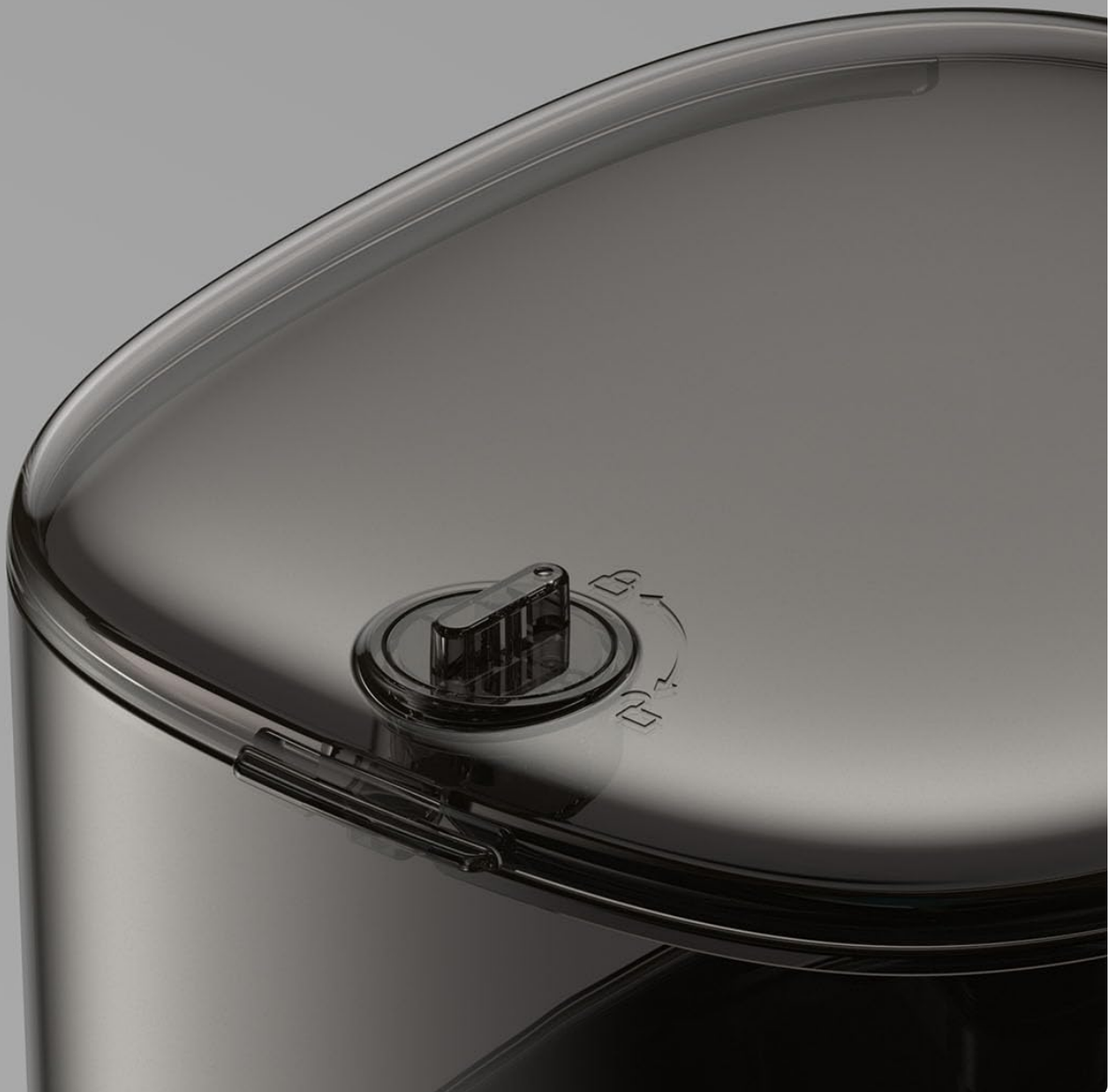
Image: Detail of the feeder's twist-lock design on the lid, ensuring food security and freshness.