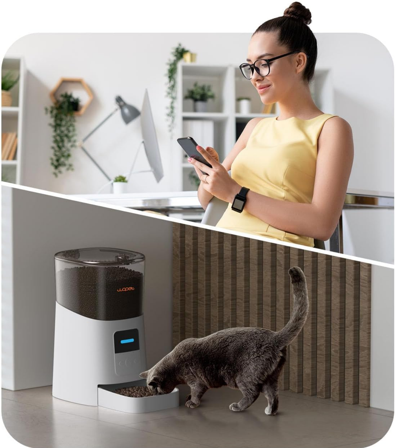
Image: A user interacting with the WOPET app on their smartphone to control the feeder, demonstrating smart app control.