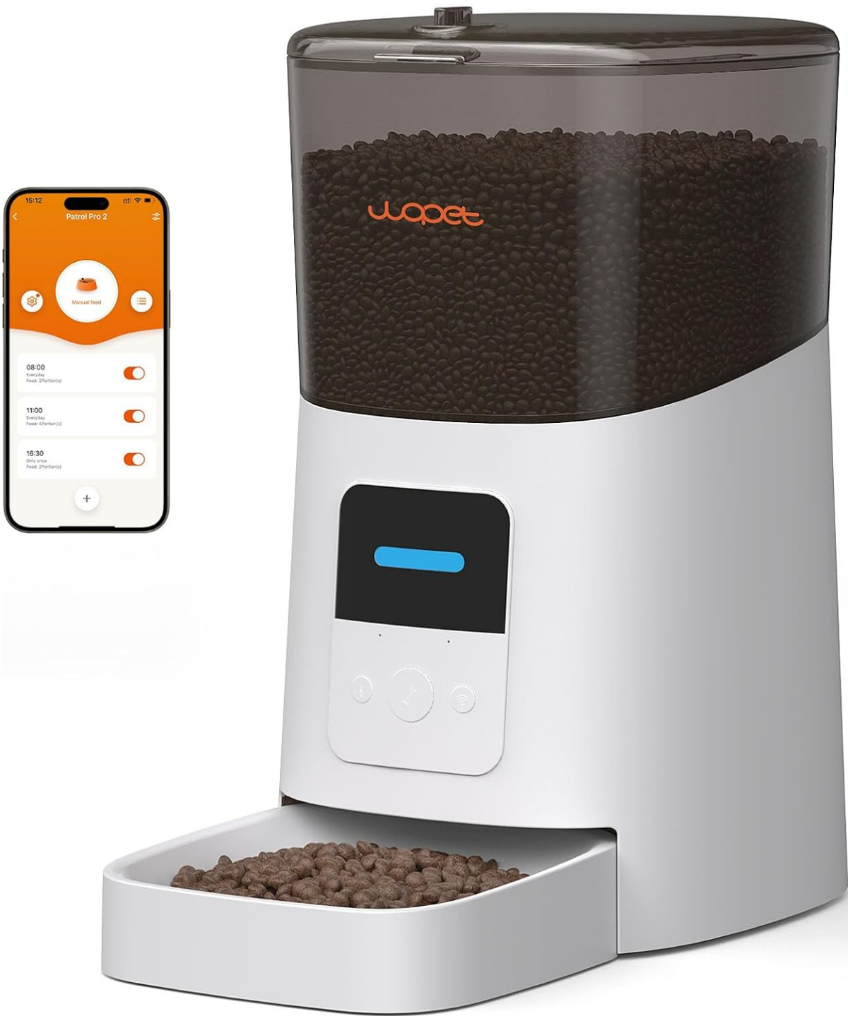
Image: The WOPET 6L Automatic Pet Feeder, showcasing its sleek design and the accompanying mobile app interface.