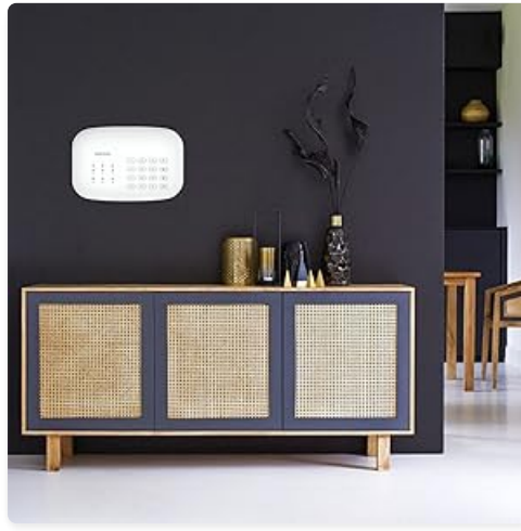
Image 3.1: Example placement of the SA501 control panel on a furniture piece.