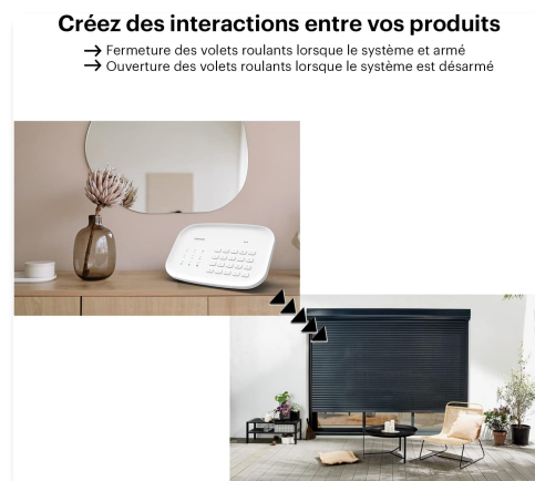
Image 4.3: The Daewoo Home Connect app allows management of various Daewoo smart home products.