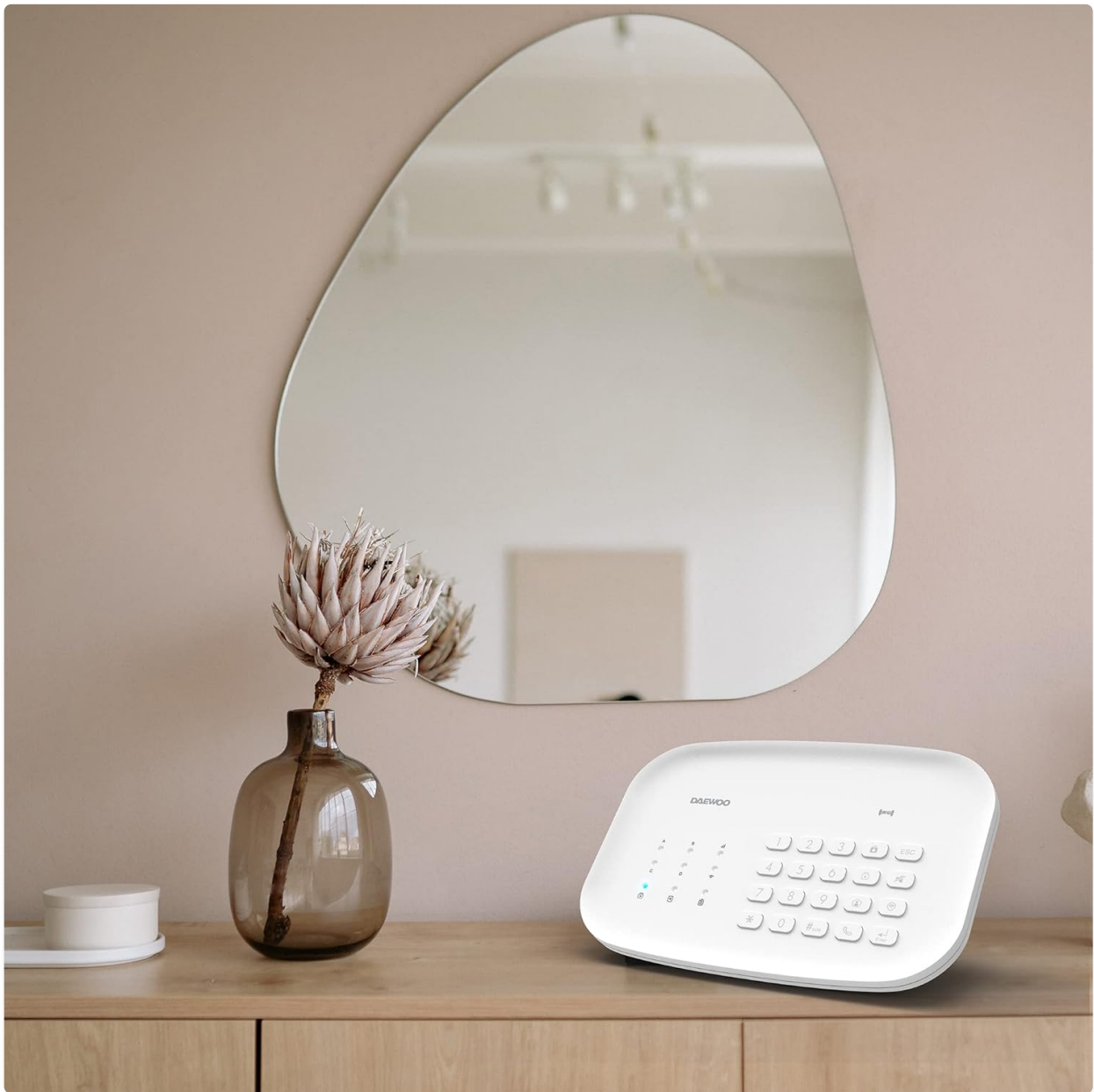
Image 4.1: The SA501 system is compatible with Amazon Alexa and Google Home for convenient voice commands.