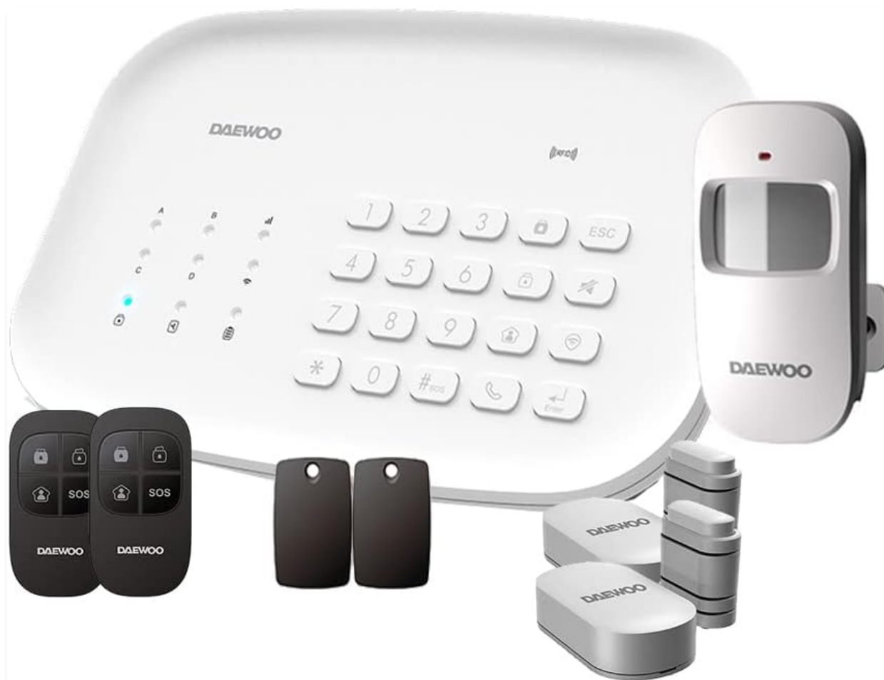
Image 1.1: DAEWOO SA501 Alarm System with included door/window contacts, motion sensor, remote controls, and RFID tags.