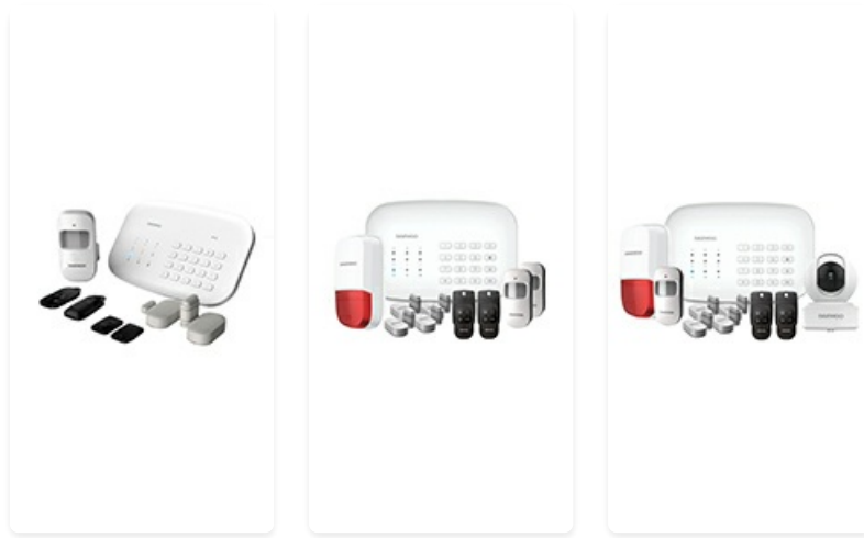
Image 3.2: Various DAEWOO SA501 alarm kits demonstrating expandability with different accessories.