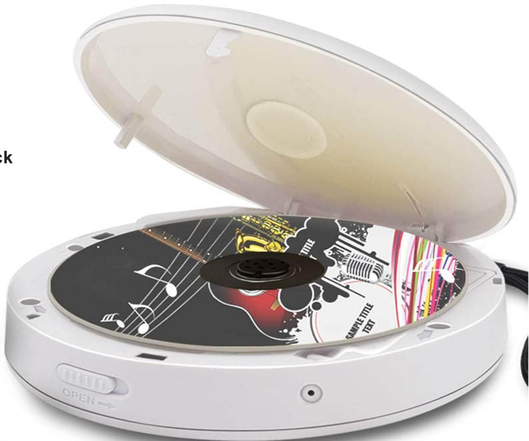
Image: The Lukasa CD Player with its lid open, revealing a CD. Icons around the player indicate various playback functions like play in order, repeat, A-B repeat, random play, and speed adjustment.