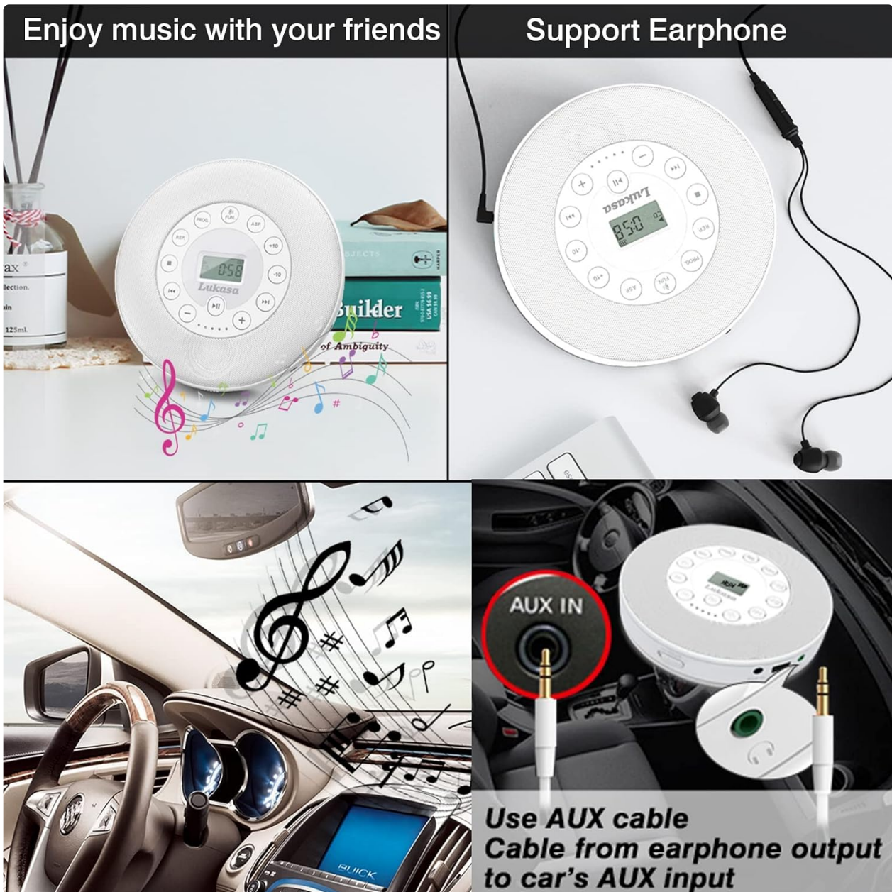
Image: The Lukasa CD Player connected to a car's AUX input using a 3.5mm audio cable, enabling audio playback through the car's speakers.