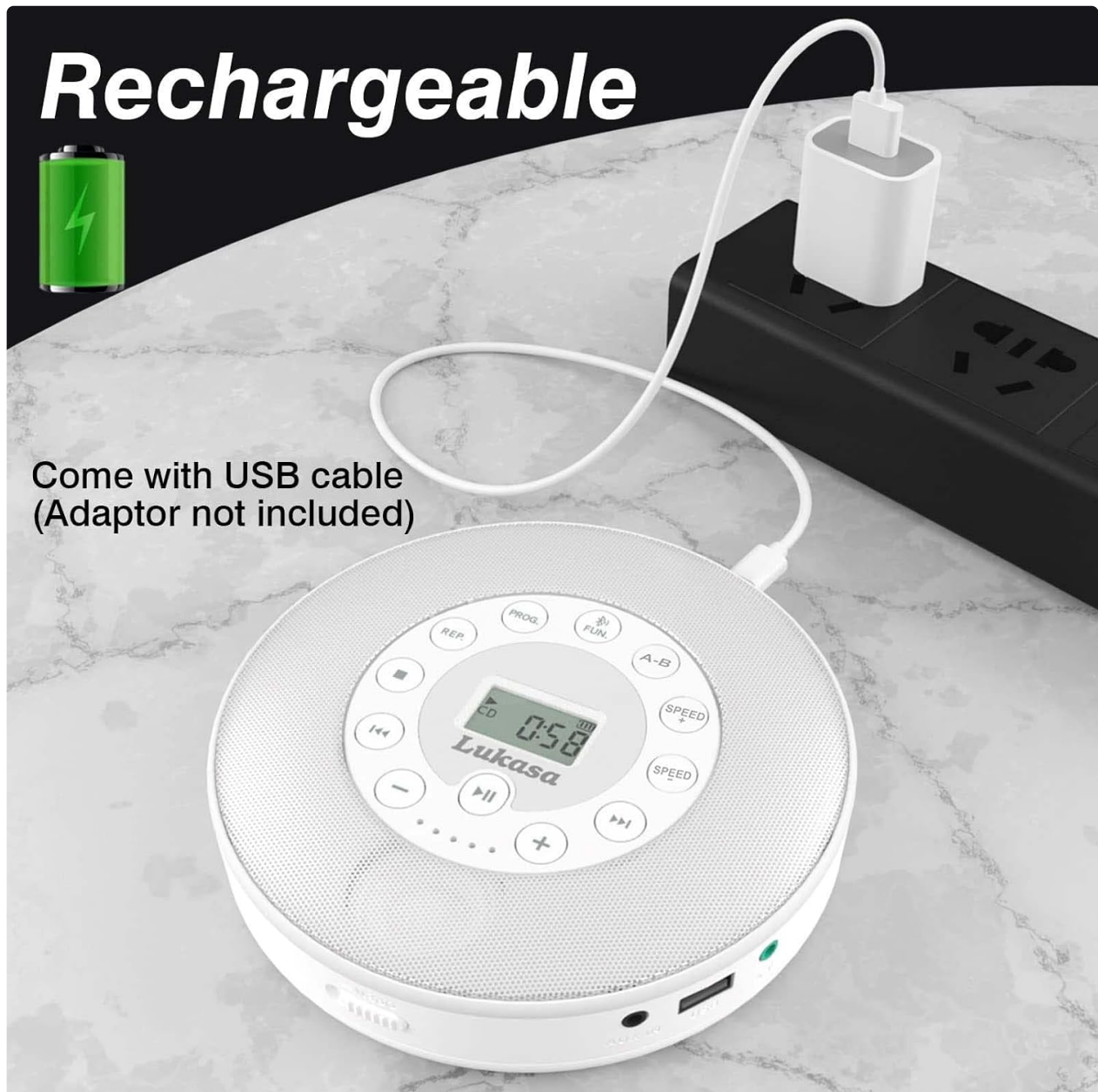
Image: The Lukasa CD Player being charged via a USB cable. An adaptor is not included.

Before first use, fully charge the CD player. Connect the provided USB cable to the charging port on the device and the other end to a USB power adapter (not included) or a computer USB port. The charging indicator will show the charging status.