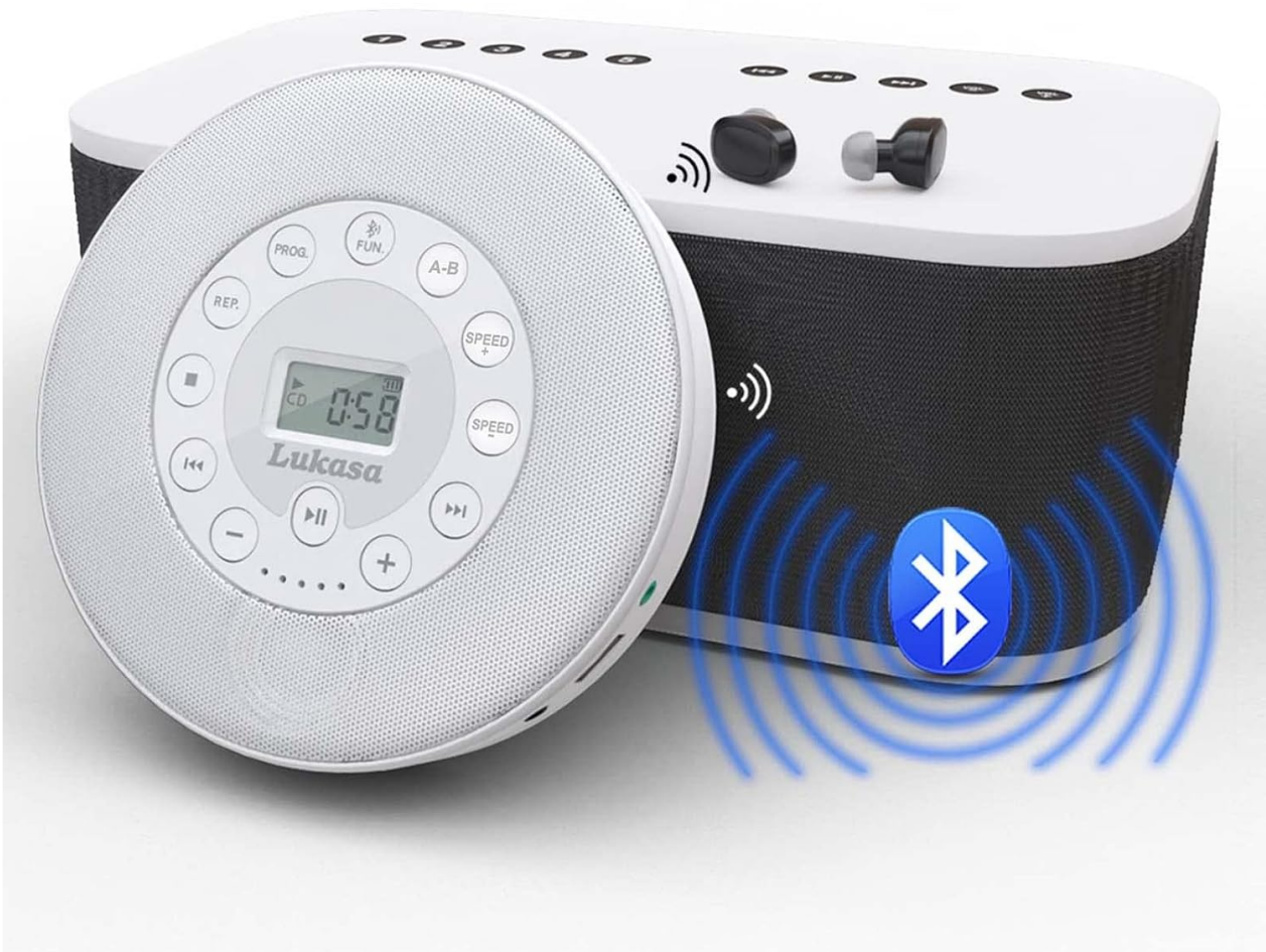
Image: The Lukasa CD Player demonstrating its Bluetooth connection capability, showing it wirelessly paired with both a larger Bluetooth speaker and a pair of earbuds.