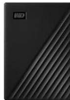
WD Hard Drive