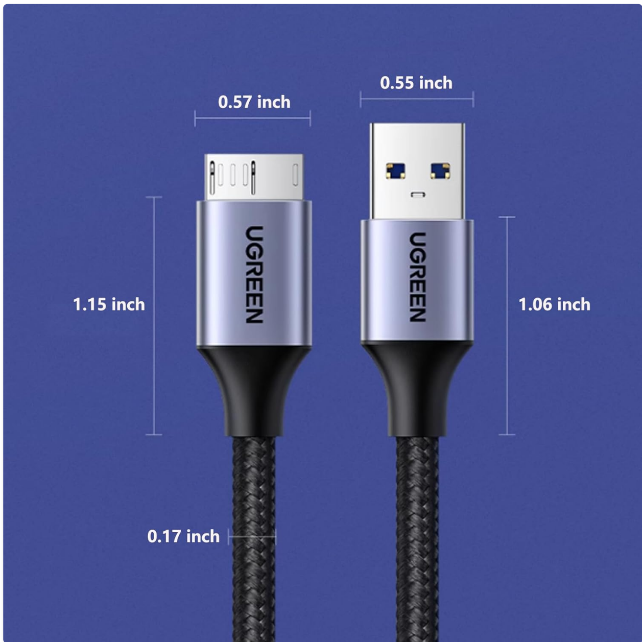
Image: Detailed dimensions of the Micro USB 3.0 and USB 3.0 Type-A connectors.