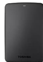
Toshiba Hard Drive