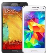
Samsung Galaxy S5/ Note 3