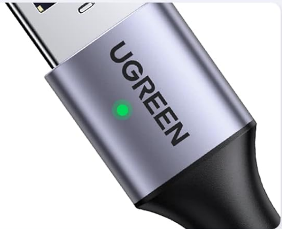
Image: Close-up view of the cable's nickel-plated connectors, reinforced joint, and aluminum alloy shell.