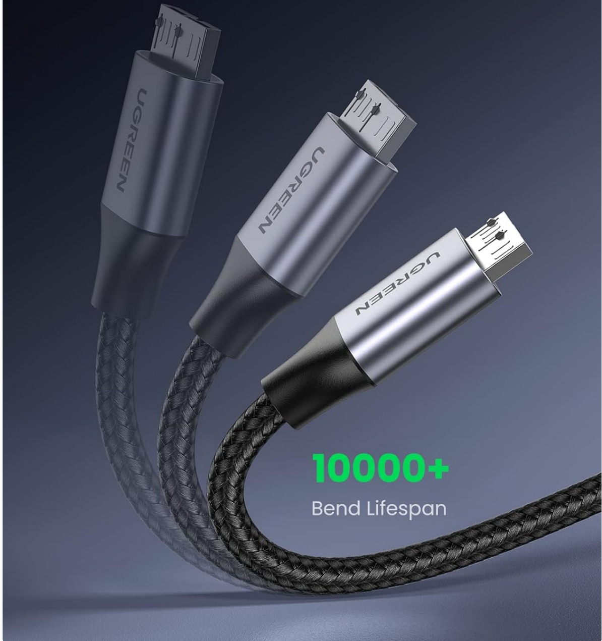
Image: The braided cable demonstrating its flexibility and robust construction.

High-density braided material to be stronger & more durable