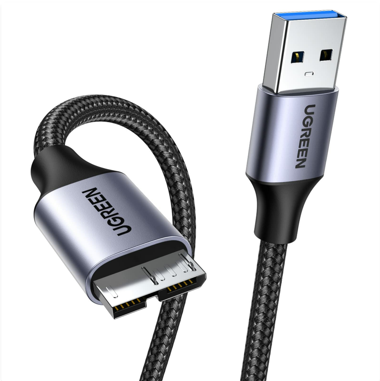
Image: UGREEN Micro USB 3.0 Cable, showcasing its design and connectors.