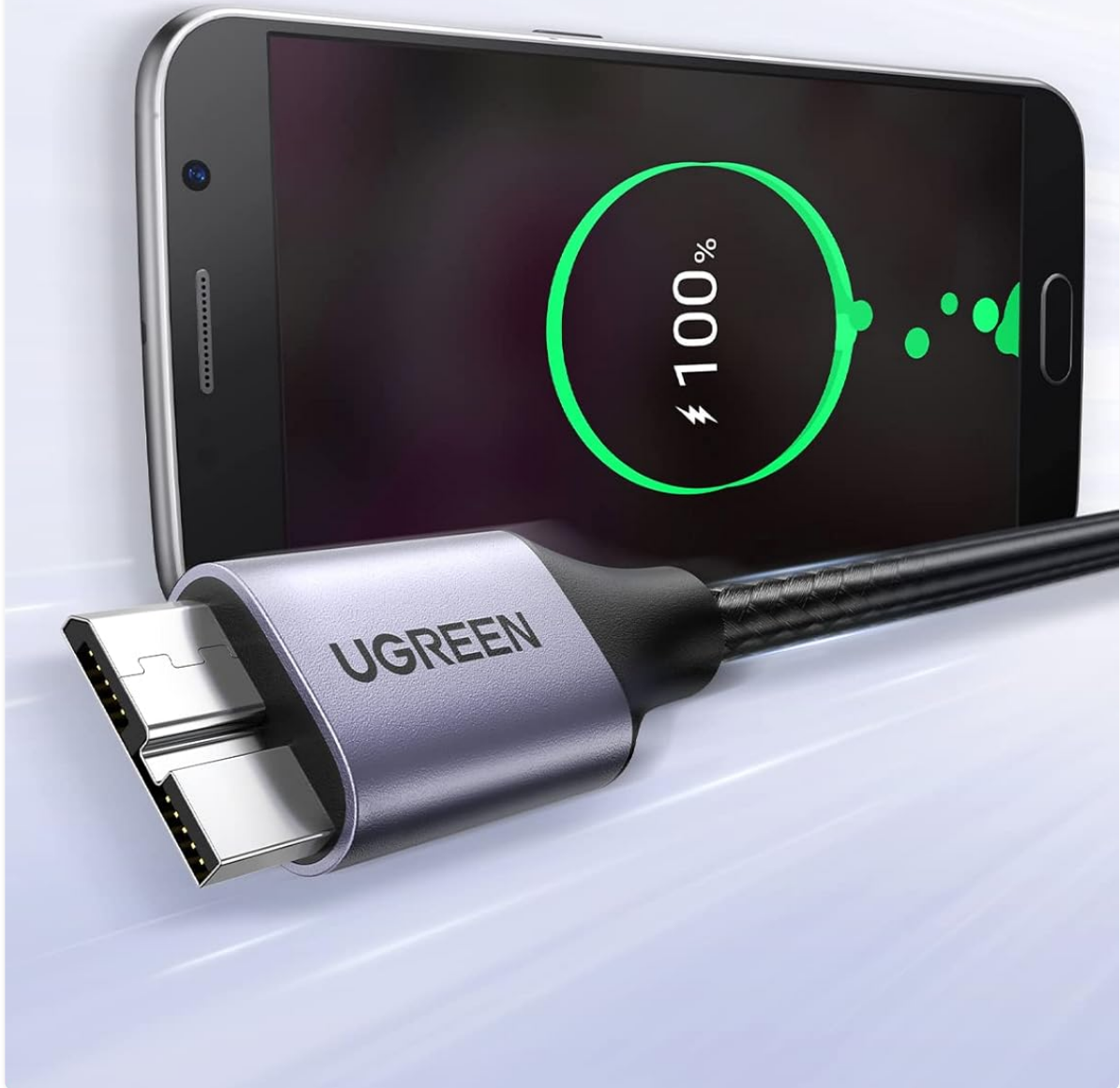
Image: A smartphone connected to the UGREEN cable, indicating fast charging capabilities.