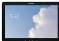
Samsung Galaxy Note Pro 12.2