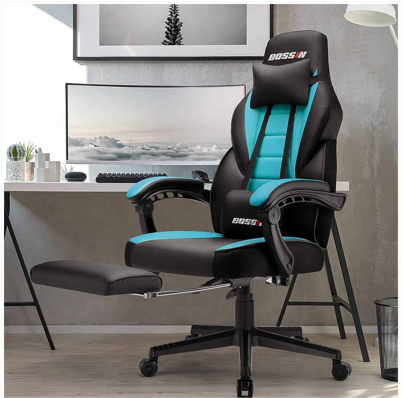
Figure 4: Chair with footrest extended for relaxation