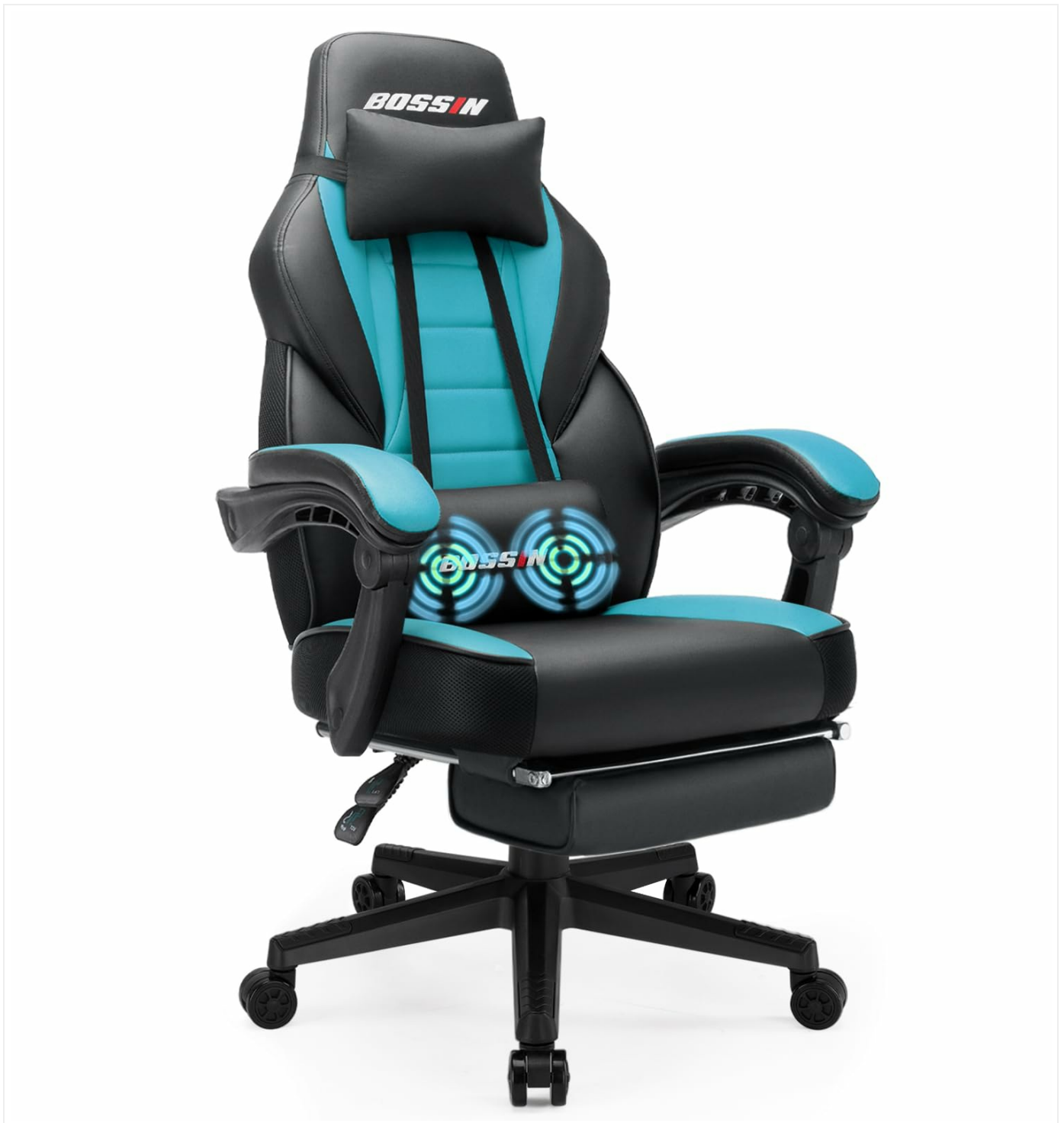
Figure 1: BOSSIN MSG-TP-NE-FT00 Gaming Chair (Tiffany Blue variant)