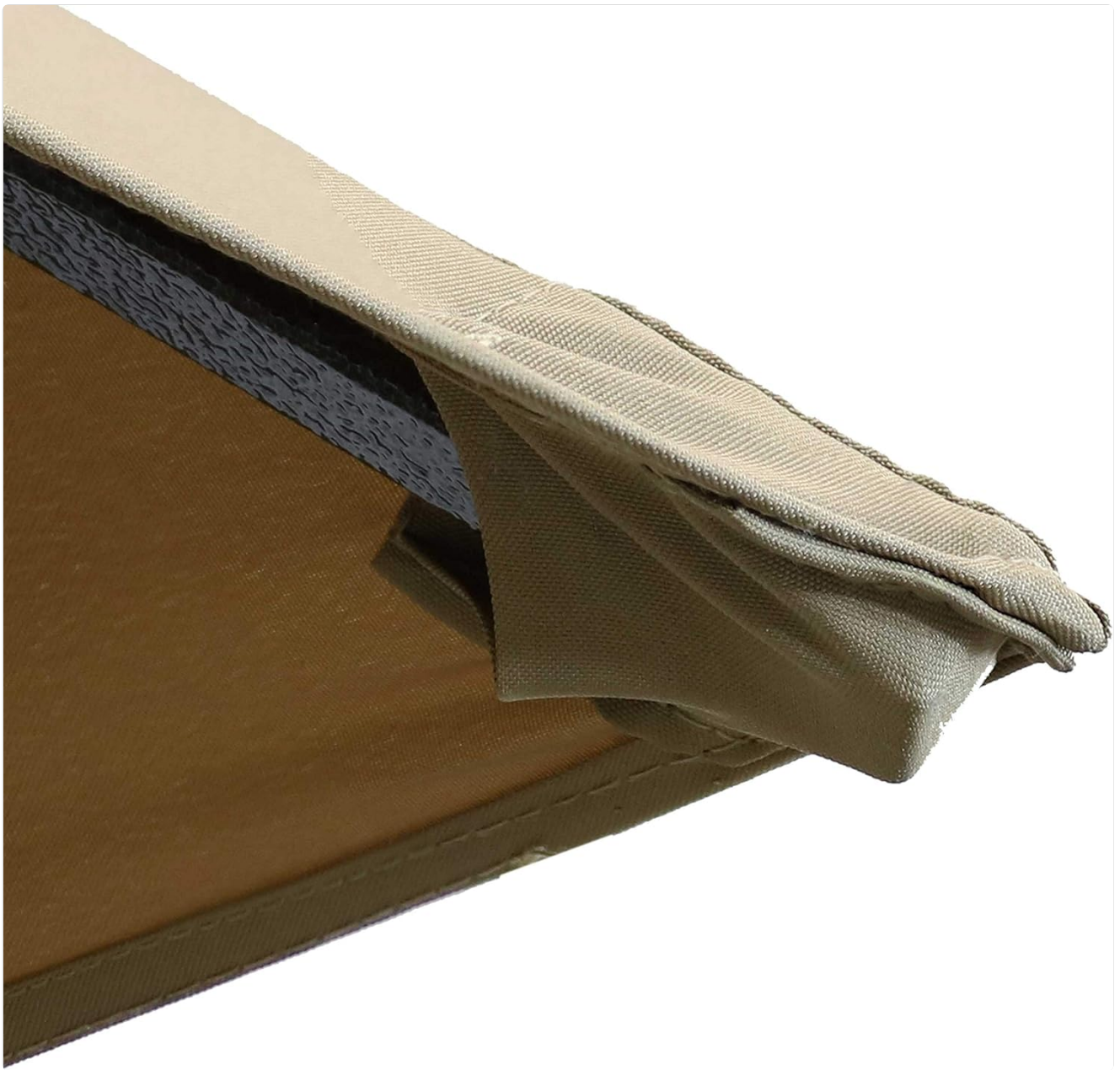
Image: Canopy fabric secured to the frame.