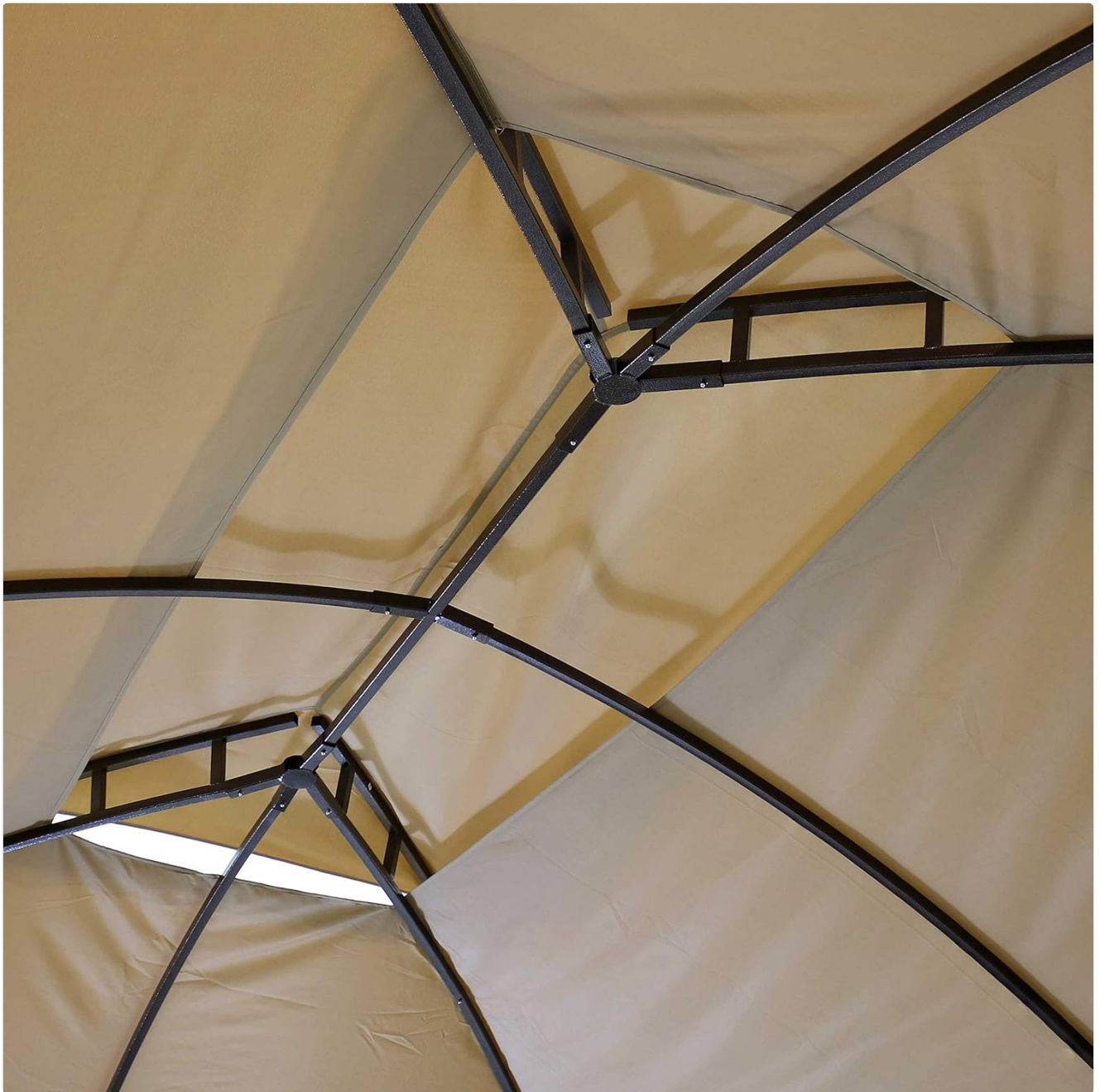
Image: Detailed view of the steel frame structure.