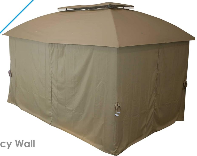
Image: Detail of privacy wall with fabric hook-and-loop fastener.