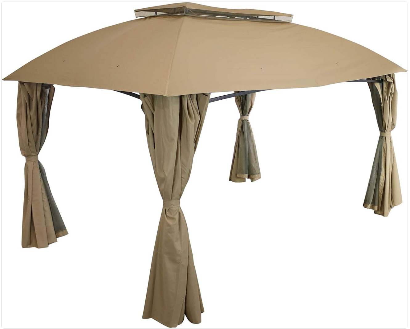
Image: Fully assembled Sunnydaze 10x13 Soft Top Patio Gazebo in tan.