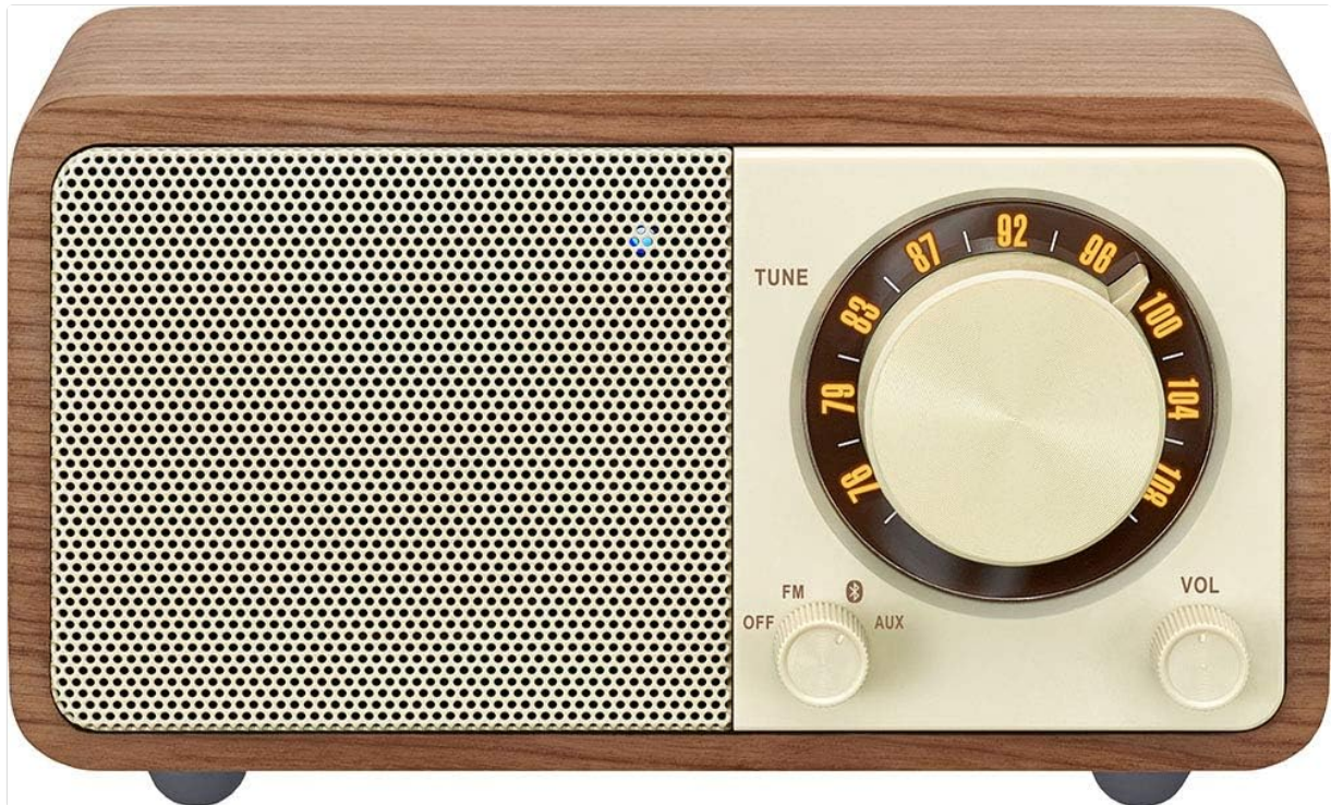
Image: Front view of the SANGEAN WR-301, showing the speaker grille, tuning dial, mode switch, and volume knob.