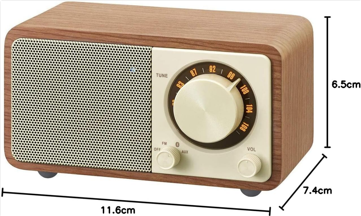
Image: Diagram showing the dimensions of the SANGEAN WR-301.