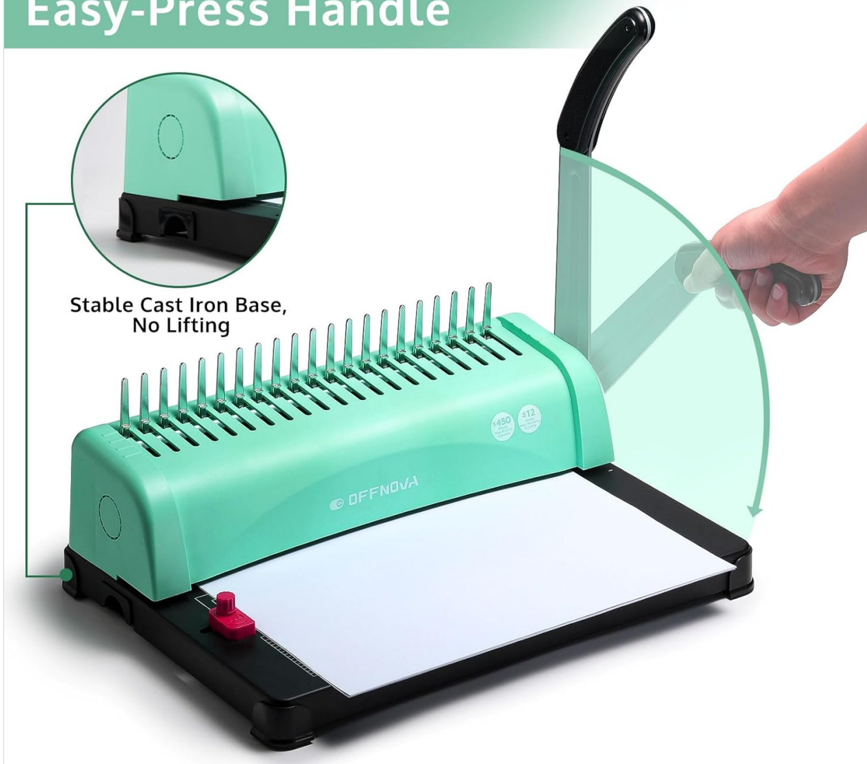
Image: Effortless punching with the easy-press handle, demonstrating the stable cast iron base.