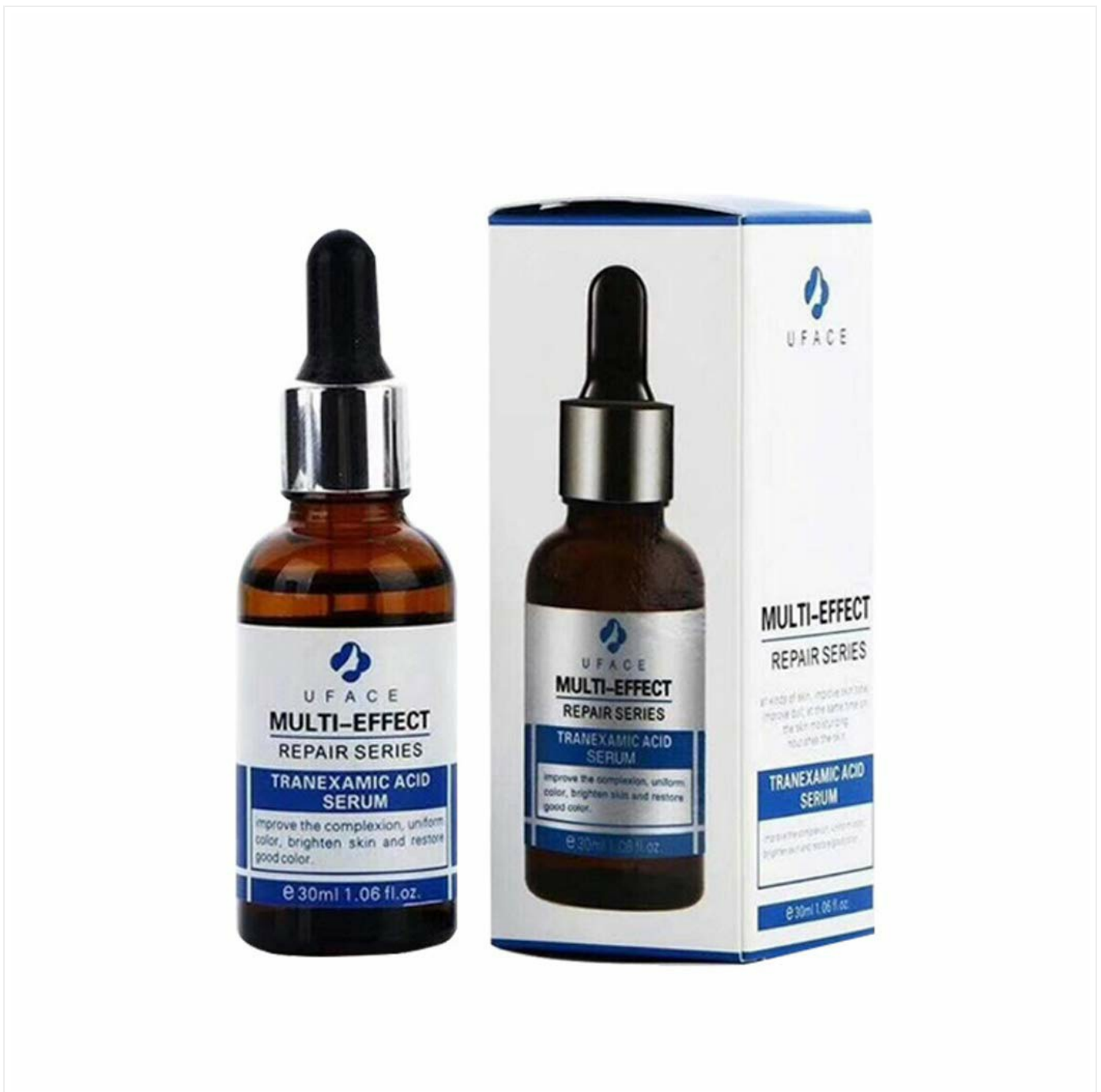
Image 1.1: The UFACE Tranexamic Acid Serum bottle alongside its retail packaging, showcasing the product's design and branding.