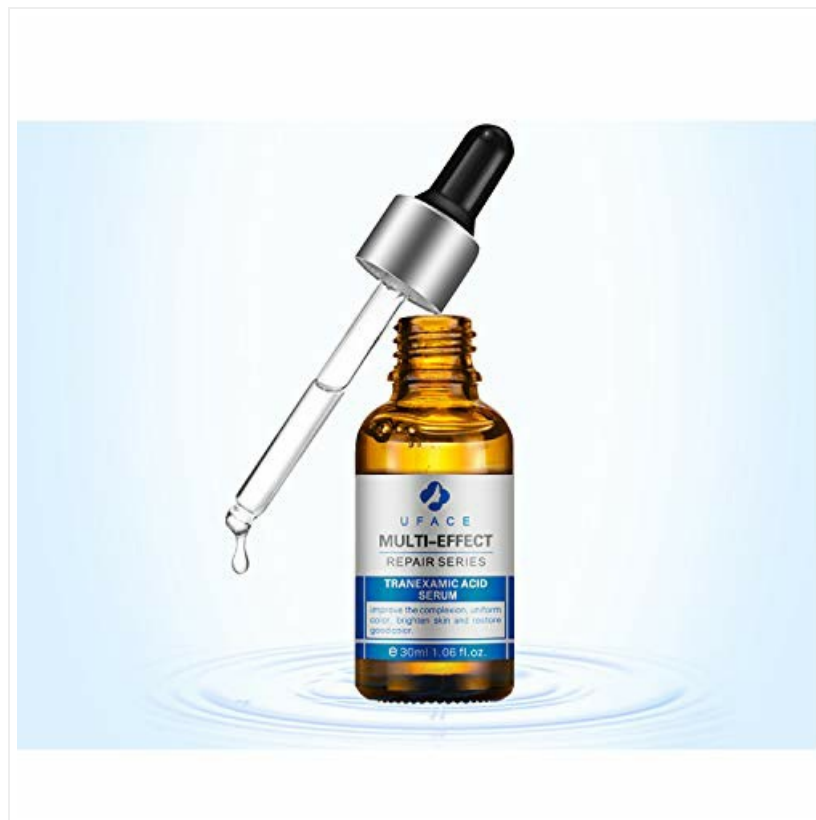
Image 4.1: The serum bottle with its dropper, illustrating how a single drop of the essence is dispensed, ready for application.

Upon first use, ensure the dropper is securely attached to the bottle. Remove the cap and gently squeeze the dropper bulb to draw the serum into the pipette. The product is ready for application.