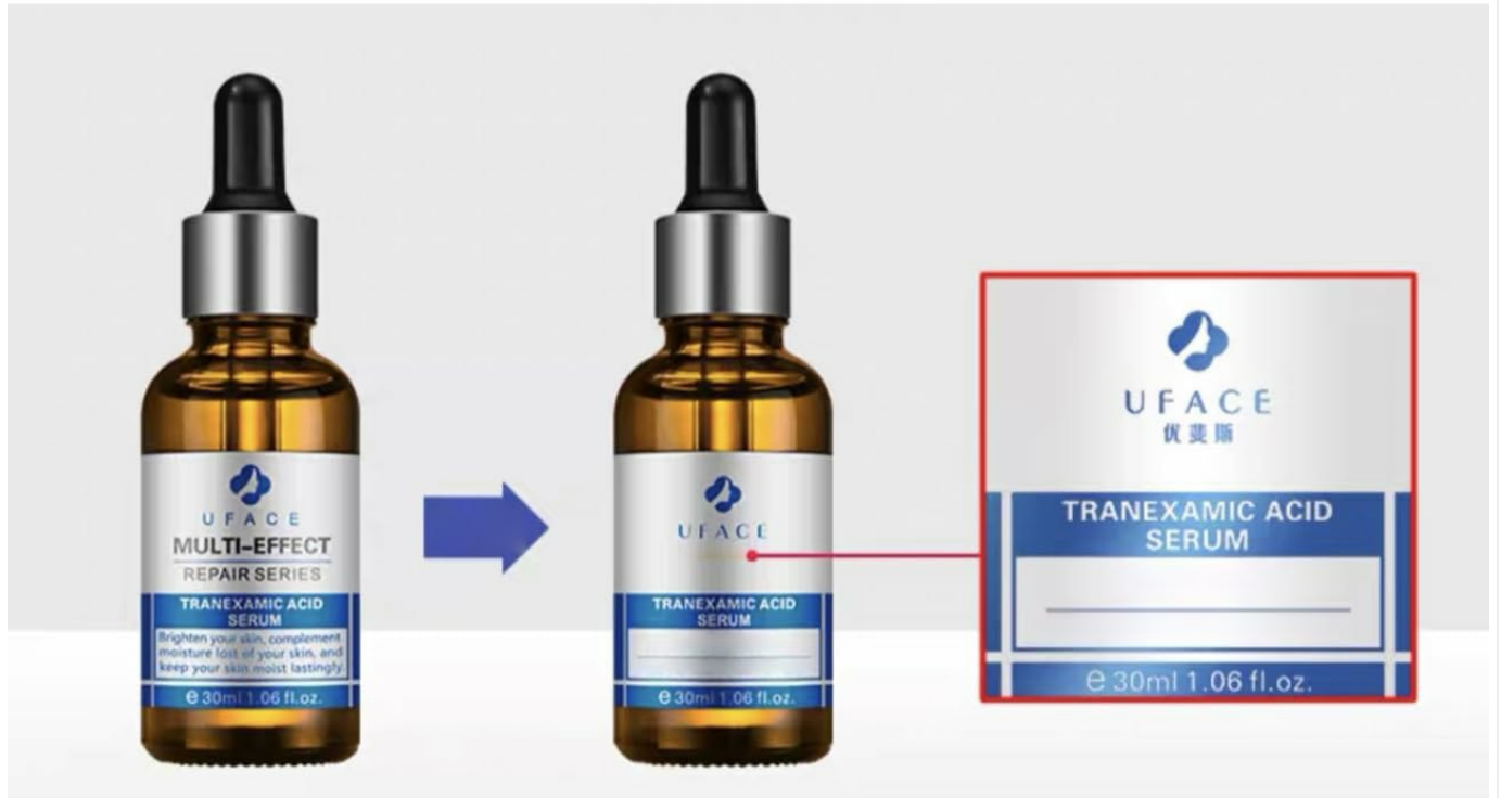
Image 1.2: Visual representation of the packaging update, showing the transition from the previous design to the new, simplified label.

New & Classic Version Will Be Shipped At Random