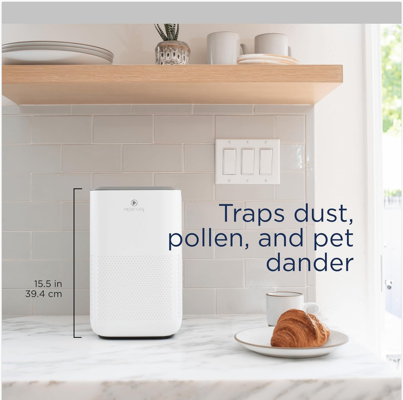
Image 2: The Medify MA-15 air purifier on a kitchen counter, illustrating its size and ability to trap dust, pollen, and pet dander. The unit measures 15.5 inches (39.4 cm) in height.

The compact design allows for versatile placement in various rooms.