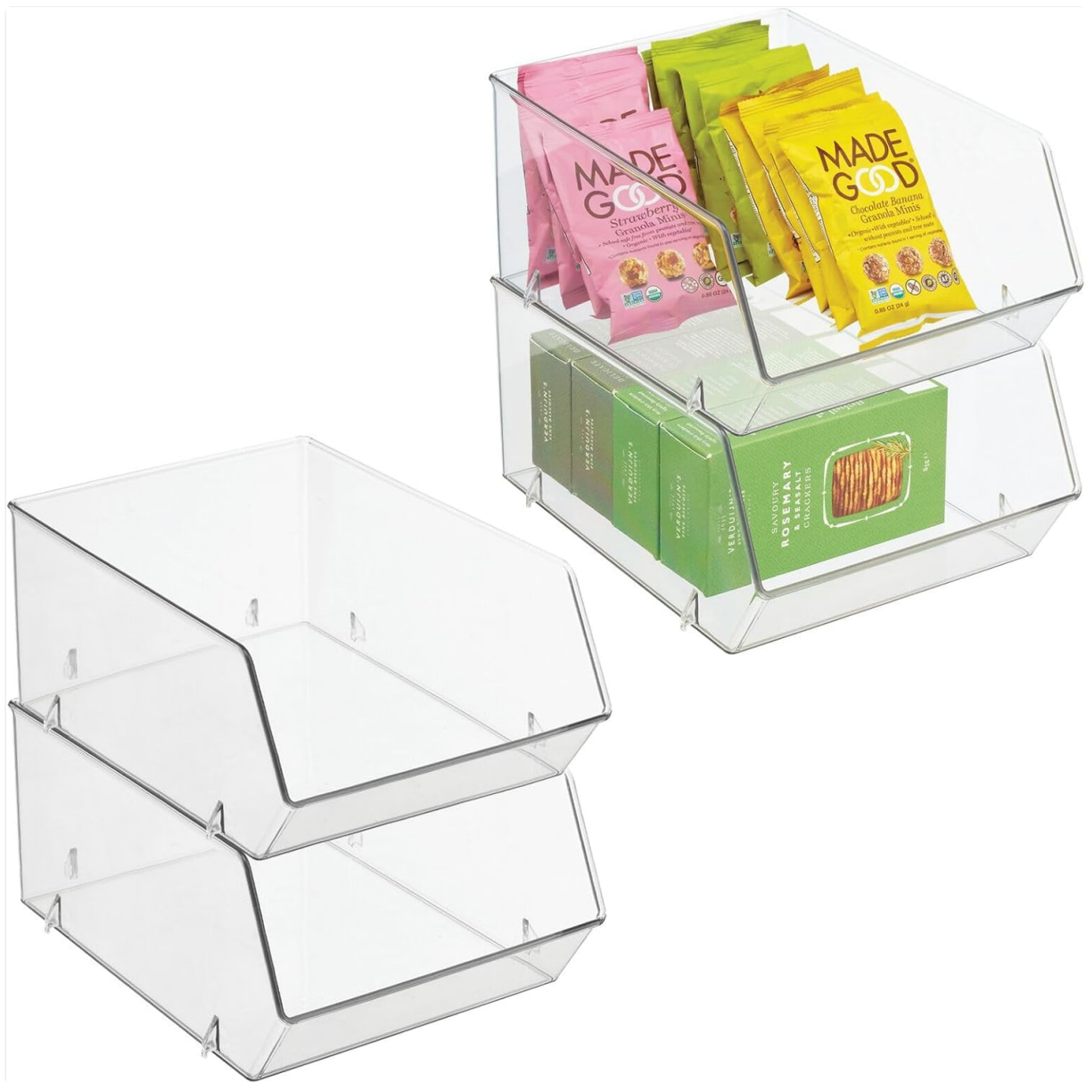
Image: Two mDesign clear plastic stacking bins, demonstrating their stackable nature. One bin is empty, and the other is filled with various snack bags, showcasing the open front for easy access.