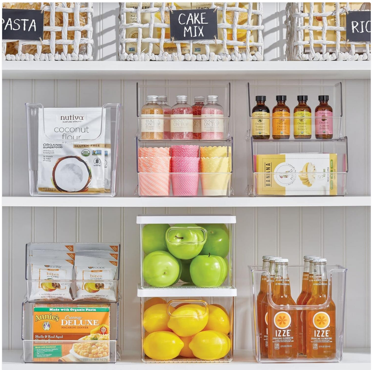
Image: A pantry shelf organized with multiple mDesign clear plastic bins, holding items like coconut flour, sprinkles, cupcake liners, snacks, and beverages.