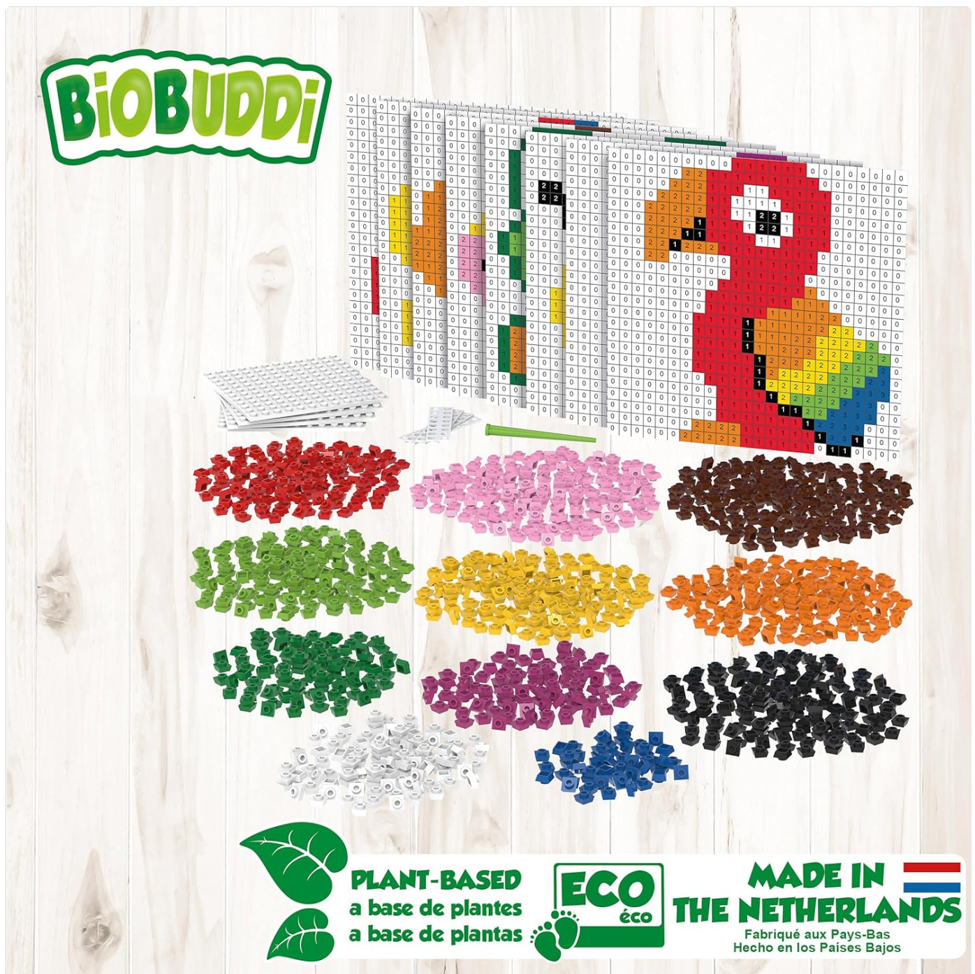
Figure 3: Pixel blocks and base plates ready for assembly.