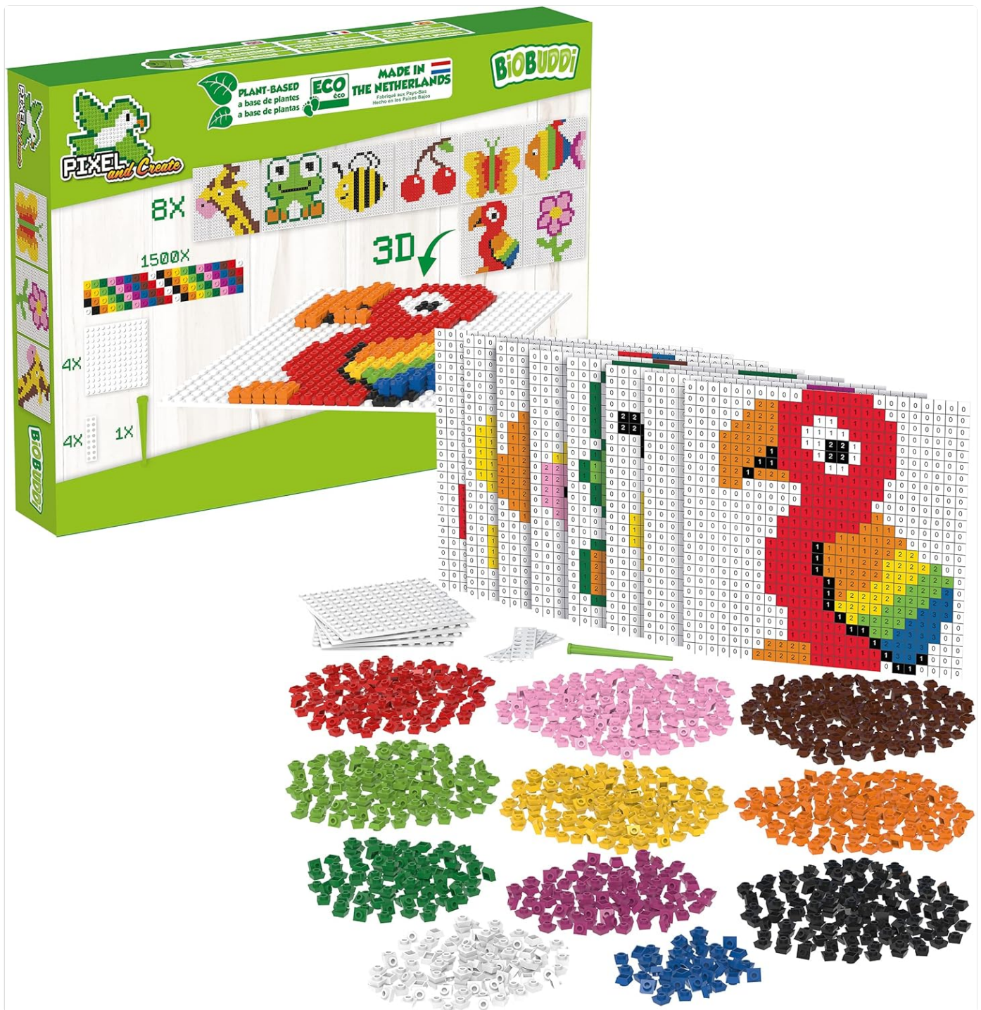
Figure 2: Contents of the Pixel & Create Starter Pack, as packaged.