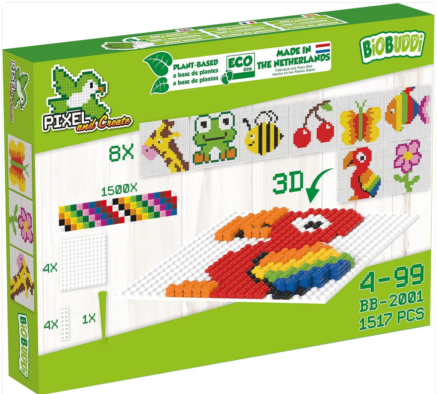
Figure 4: Examples of designs that can be created with the Pixel & Create Starter Pack.