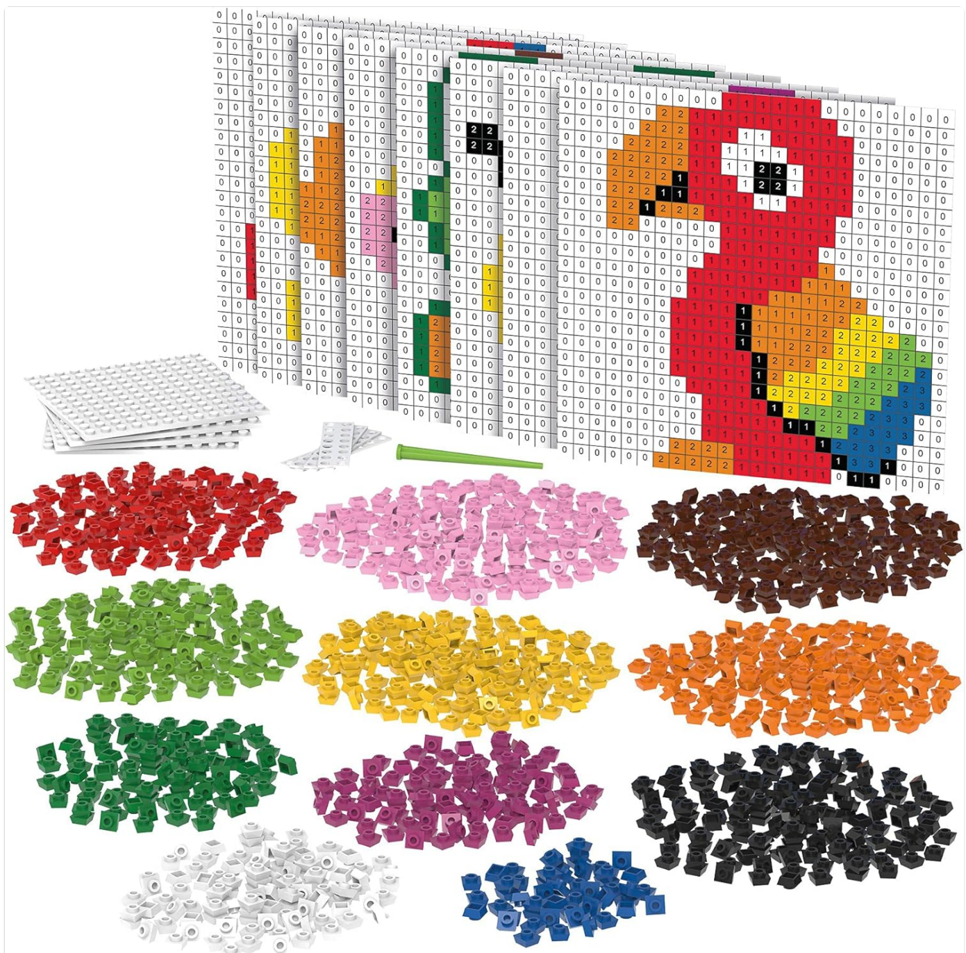
Figure 1: Overview of the Pixel & Create Starter Pack components and a completed design example.