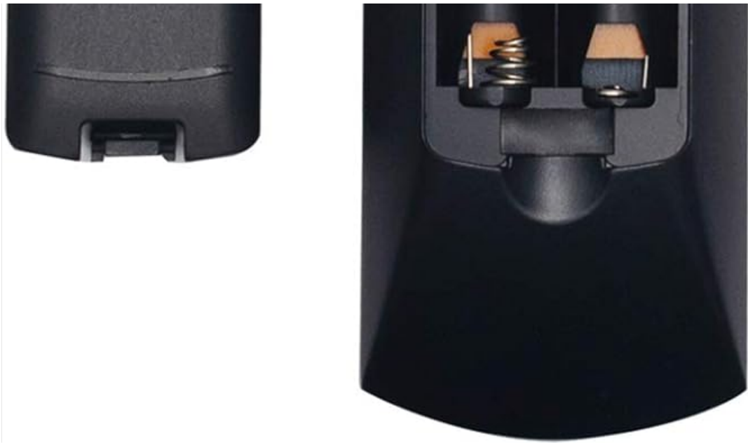
Figure 2: Battery Compartment with AAA Batteries.