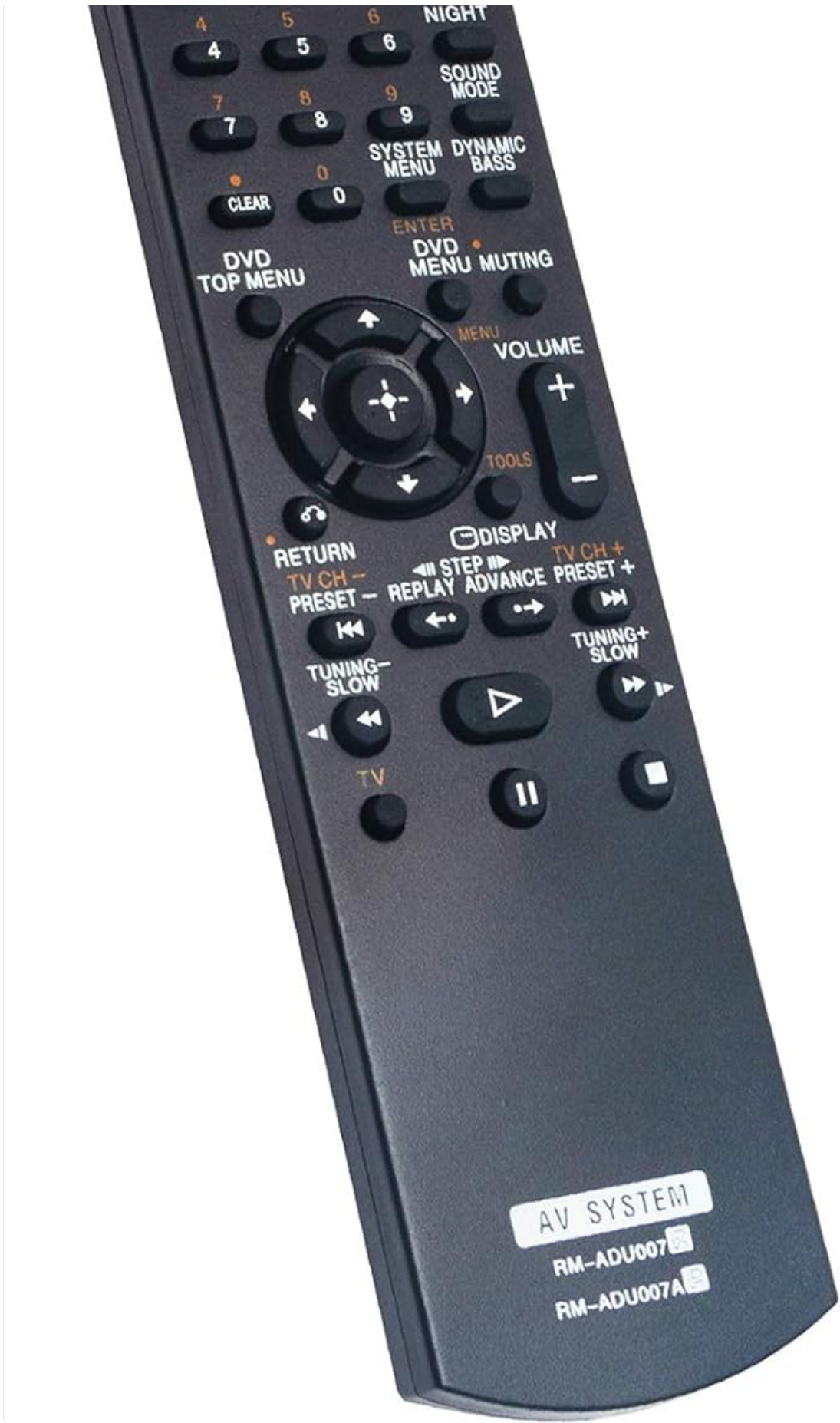
Figure 1: ALLIMITY RM-ADU007A Replacement Remote Control.