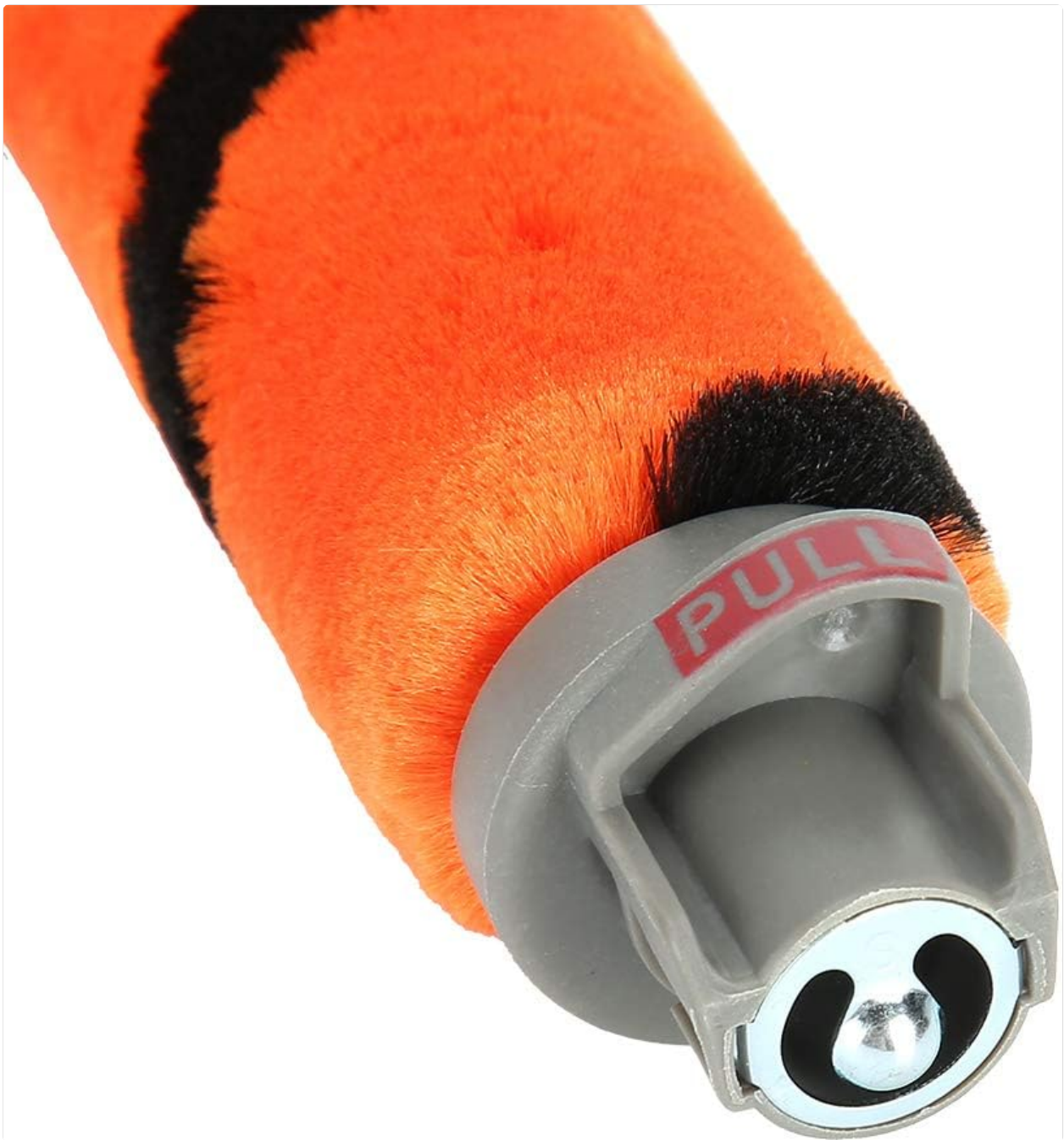
Image 3.1: Detail of the brush roll end, showing the 'PULL' mechanism for secure fitting.