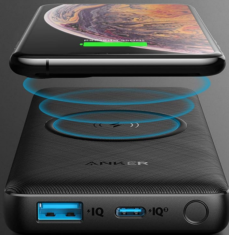
Figure 2: PowerCore III Ports (USB-A, USB-C, Power Button)