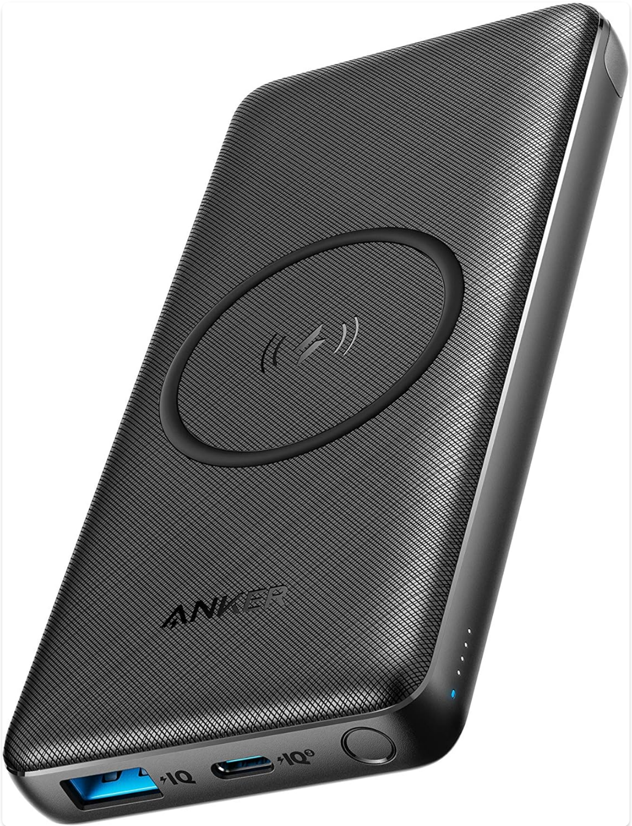
Figure 1: Anker PowerCore III 10,000 mAh Wireless Portable Charger