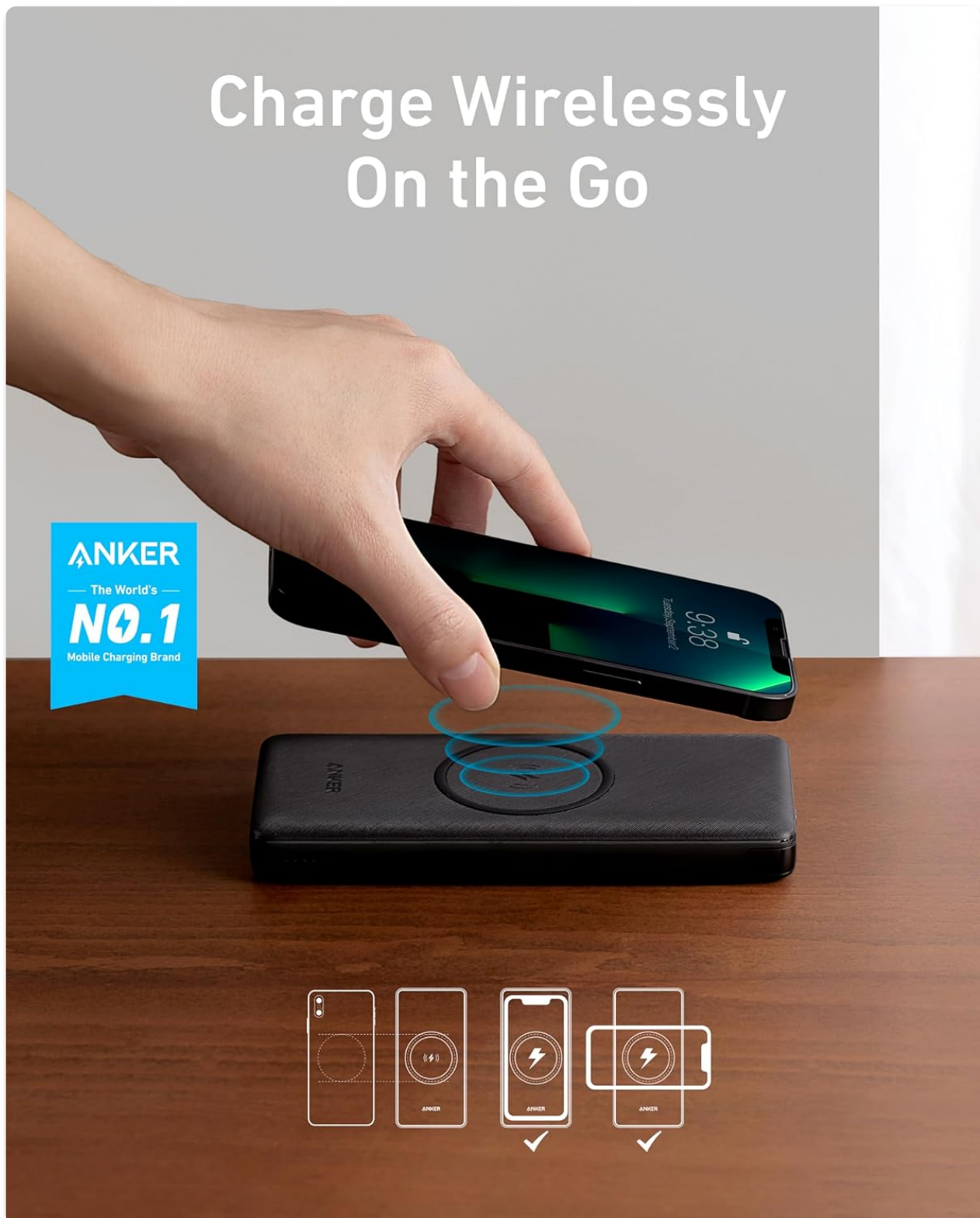
Figure 3: Charging a smartphone wirelessly on the PowerCore III.

To activate wireless charging, press the power button on the side of the PowerCore. The first blue LED indicator will light up to confirm wireless charging is active. Place your Qi-compatible device (e.g., smartphone, earbuds) on the center of the wireless charging pad. Ensure proper alignment for stable charging. The PowerCore provides up to 10W max wireless charging.