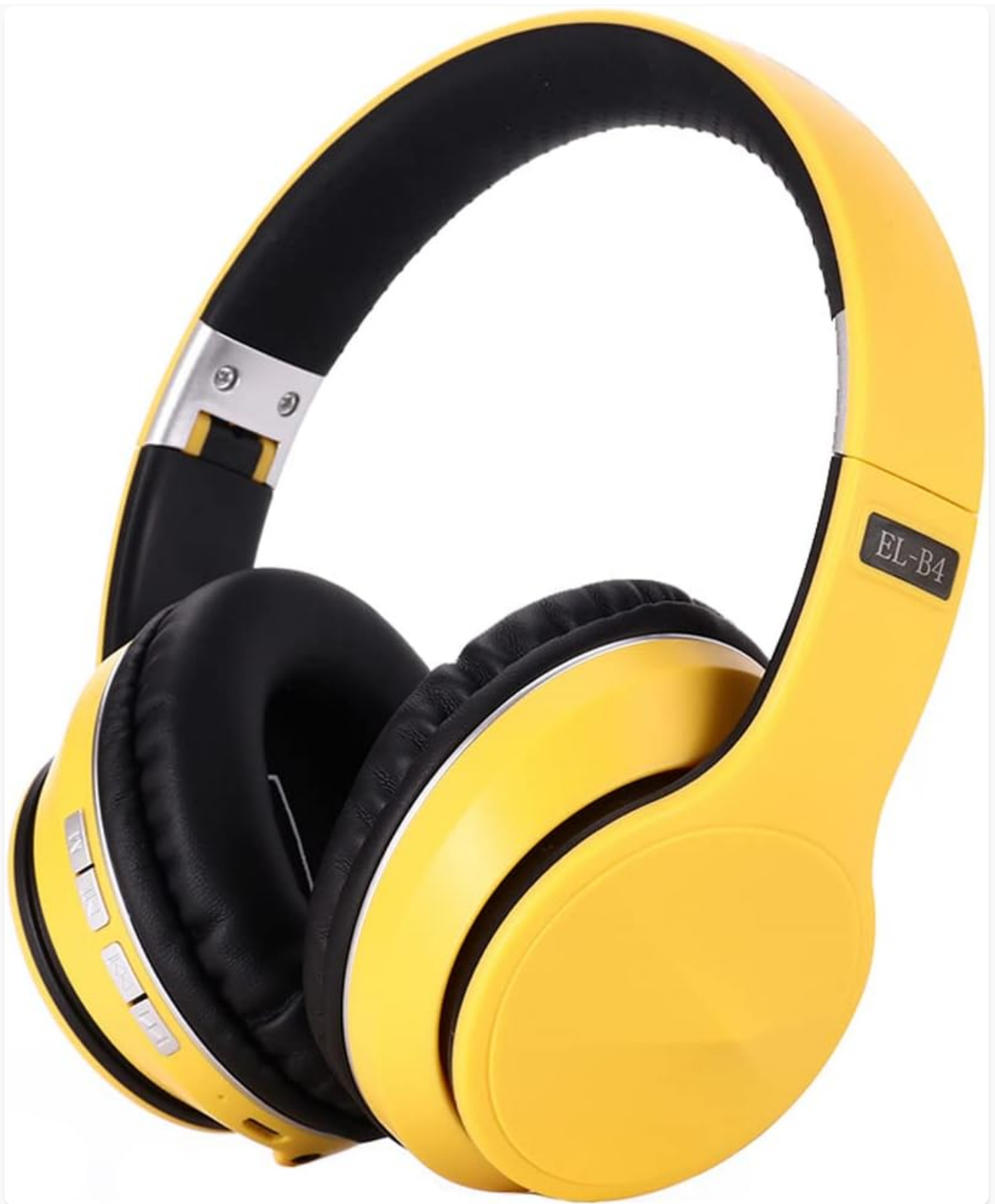
Figure 1: OYEALEX EL-B4 Over Ear Headphones (Yellow variant shown).