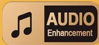
Figure 6: Experience immersive sound with 40mm drivers and Bass Boost Technology.

40mm Drivers HiFi stereo sound Bass Boost Technology