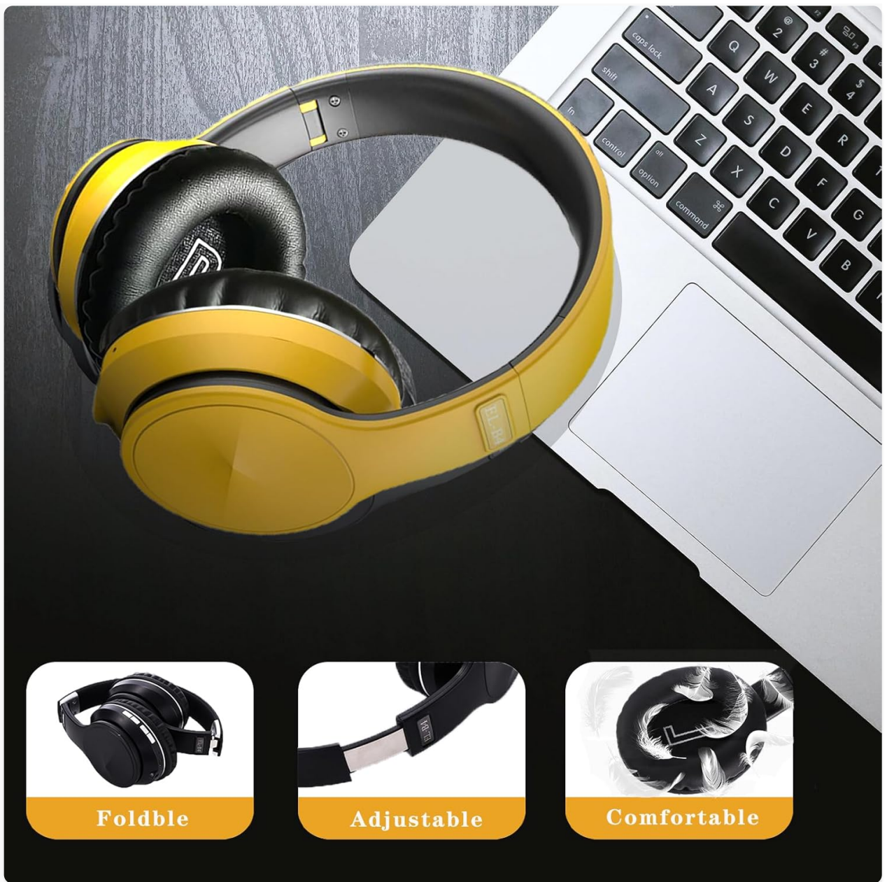
Figure 7: Foldable, adjustable, and comfortable design for extended wear and easy transport.