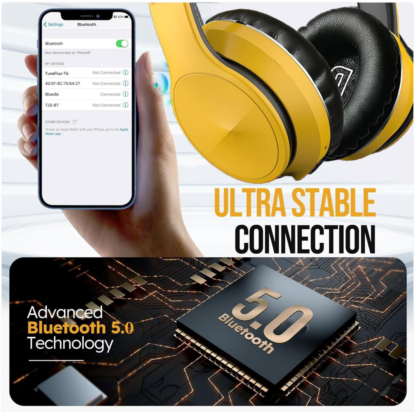
Figure 4: Bluetooth 5.0 technology ensures a stable connection with your devices.