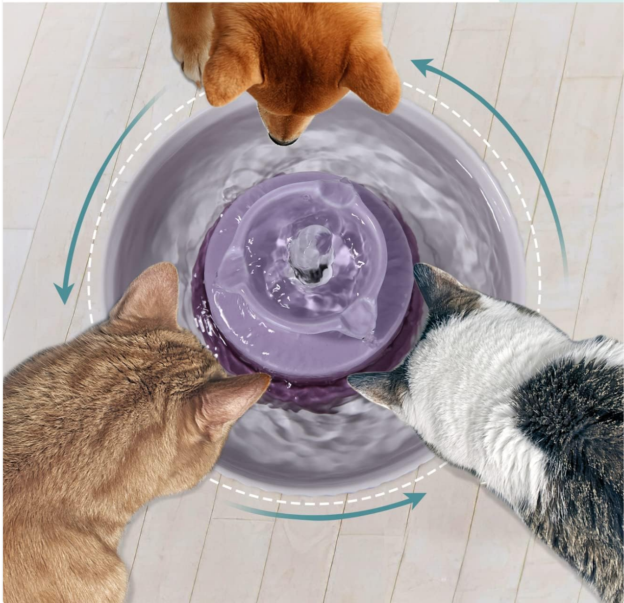
Image: An overhead view of the NautyPaws Ceramic Cat Water Fountain's 360-degree round design, demonstrating its accessibility for multiple pets to drink comfortably at the same time.