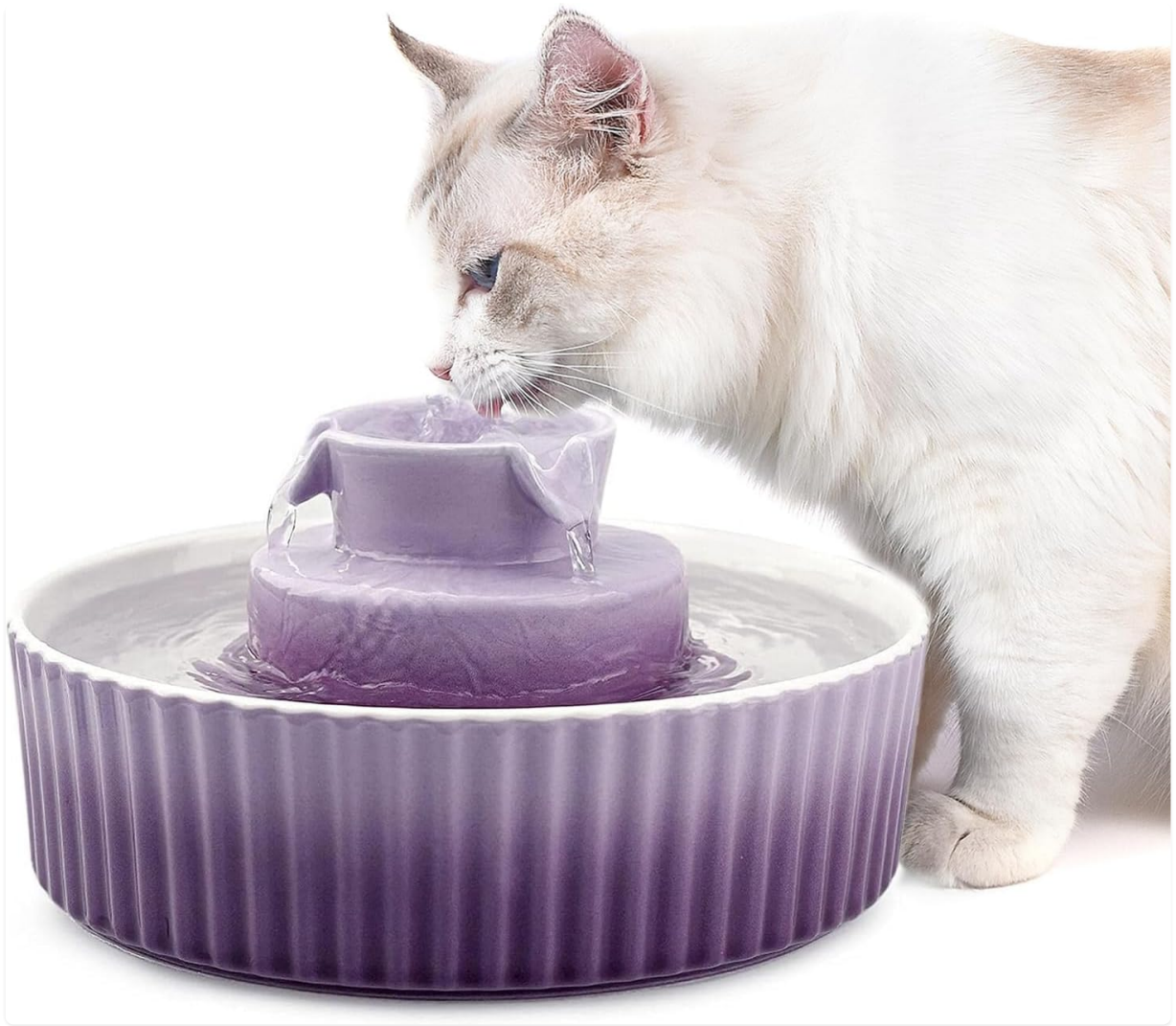
Image: A cat happily drinking from the NautyPaws Ceramic Cat Water Fountain, highlighting its appealing design and functionality for pets.