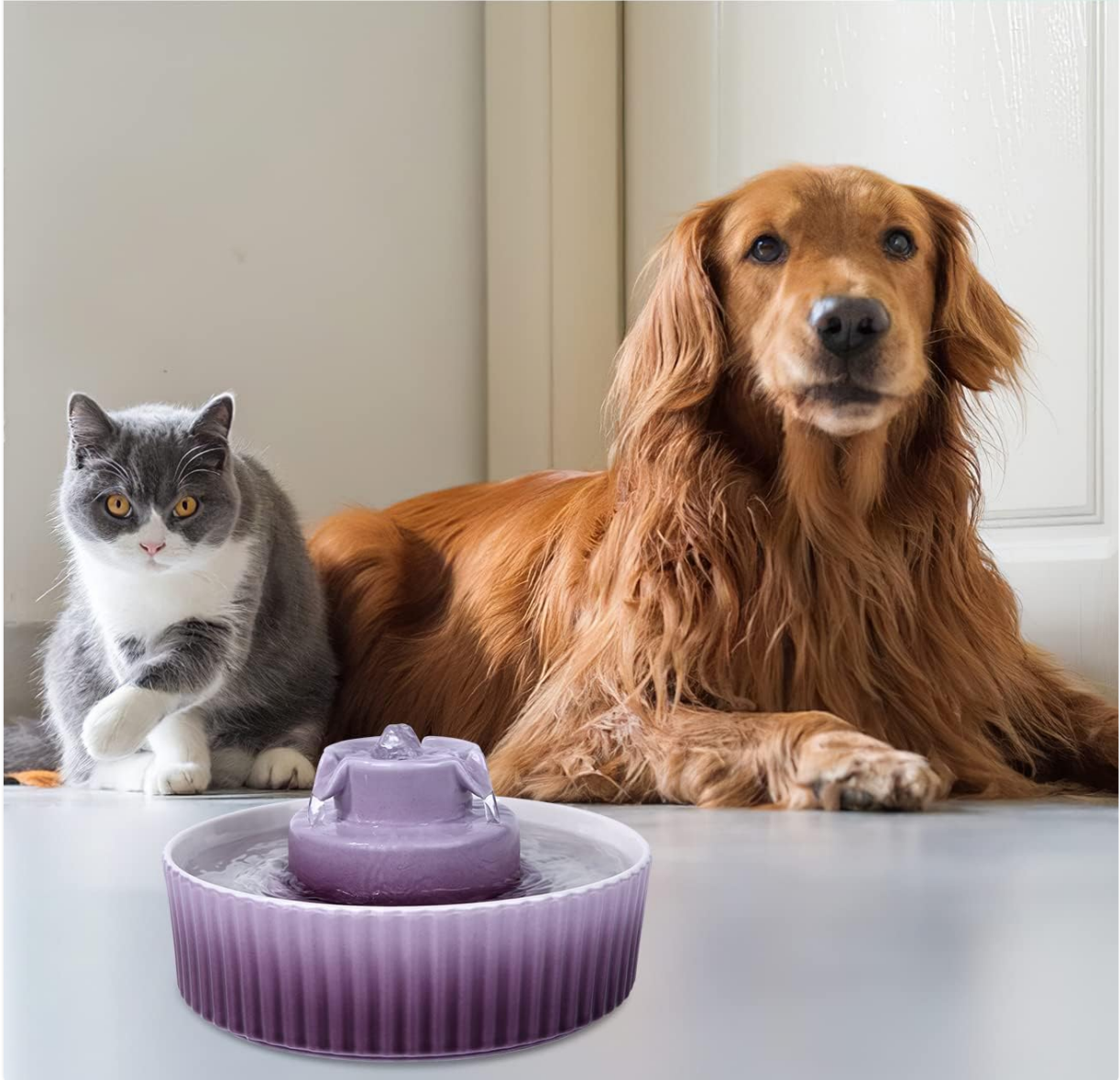
Image: This image features a cat and a dog relaxing near the NautyPaws Ceramic Cat Water Fountain, suggesting a harmonious environment where pets can enjoy drinking water together.