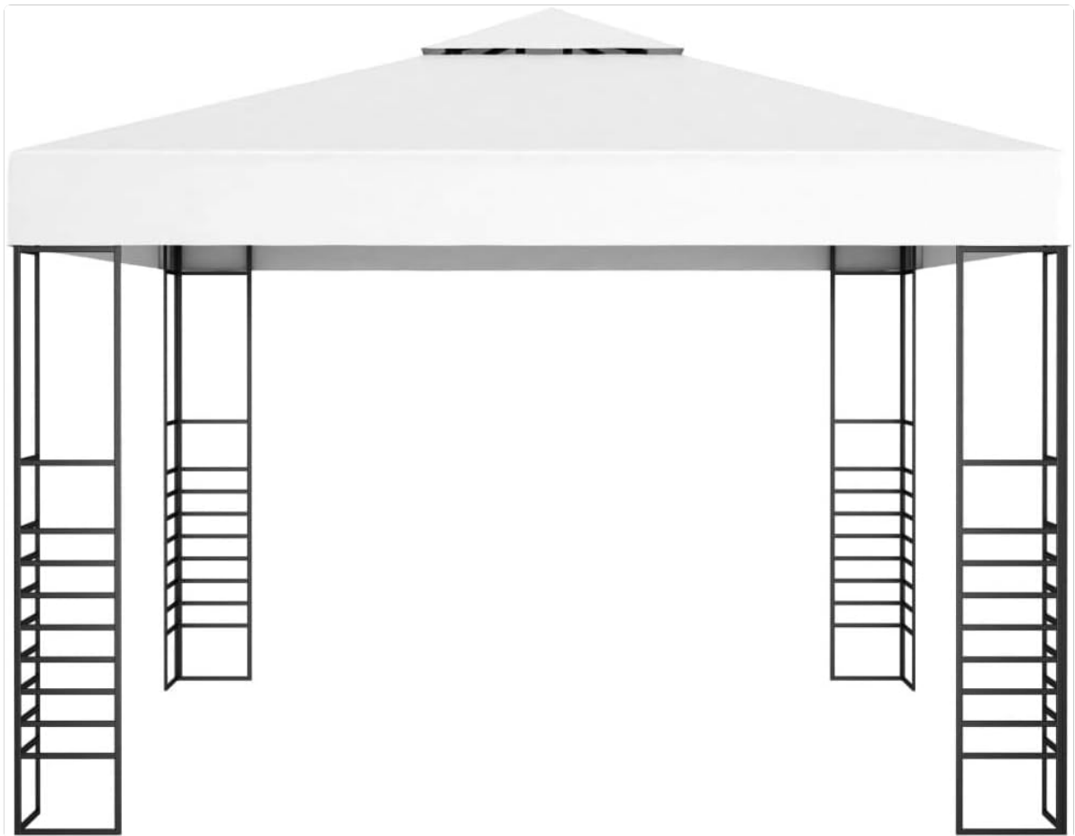
Image 4.1: Side view of the marquee frame. This image illustrates the structural design of the powder-coated steel frame, highlighting the connection points for the legs and roof support.