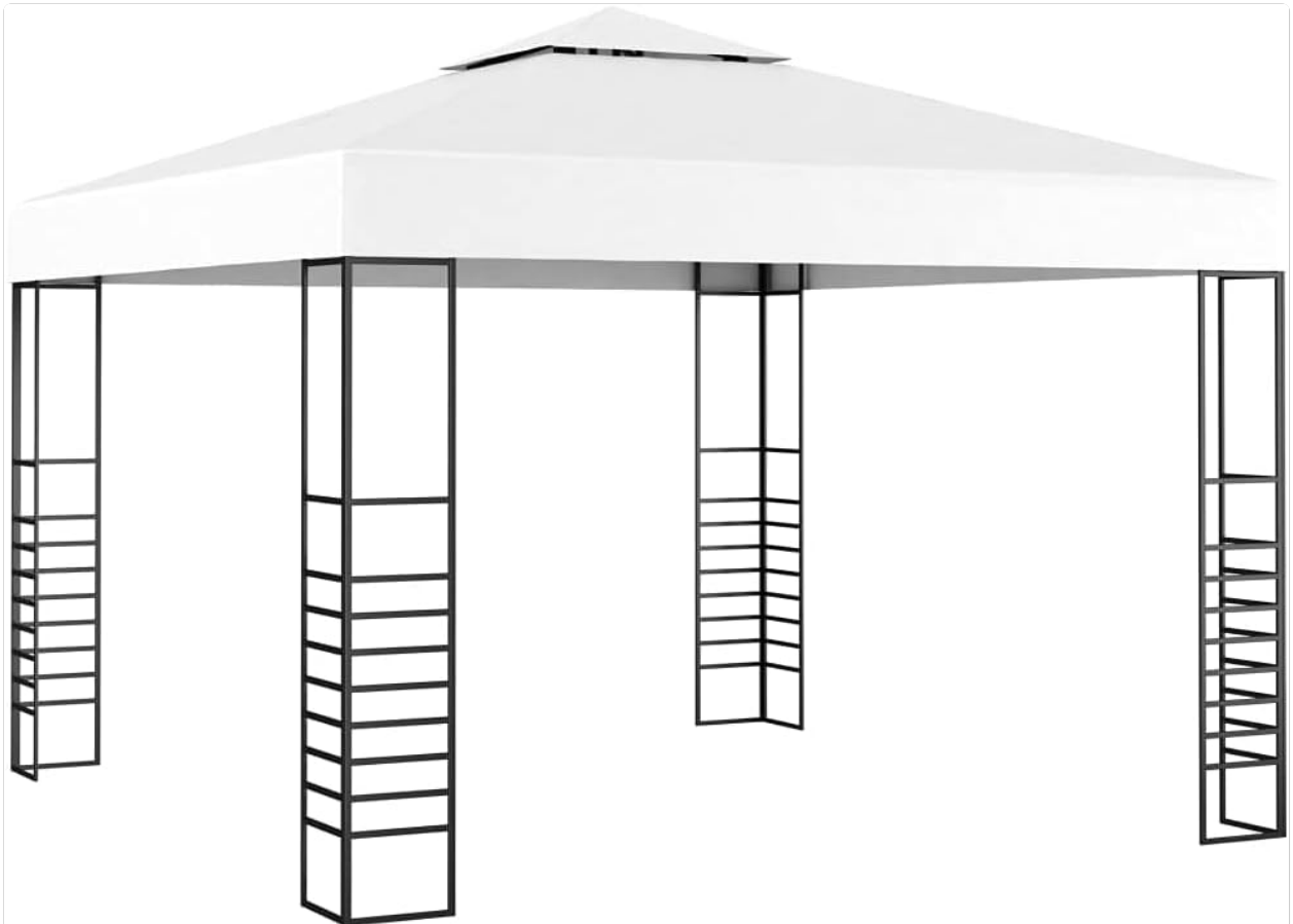
Image 1.1: Overview of the vidaXL Garden Marquee. This image displays the fully assembled white marquee with its black

This manual provides essential instructions for the safe assembly, operation, and maintenance of your vidaXL Garden Marquee, Model 48033. Please read all instructions carefully before beginning assembly and retain this manual for future reference.