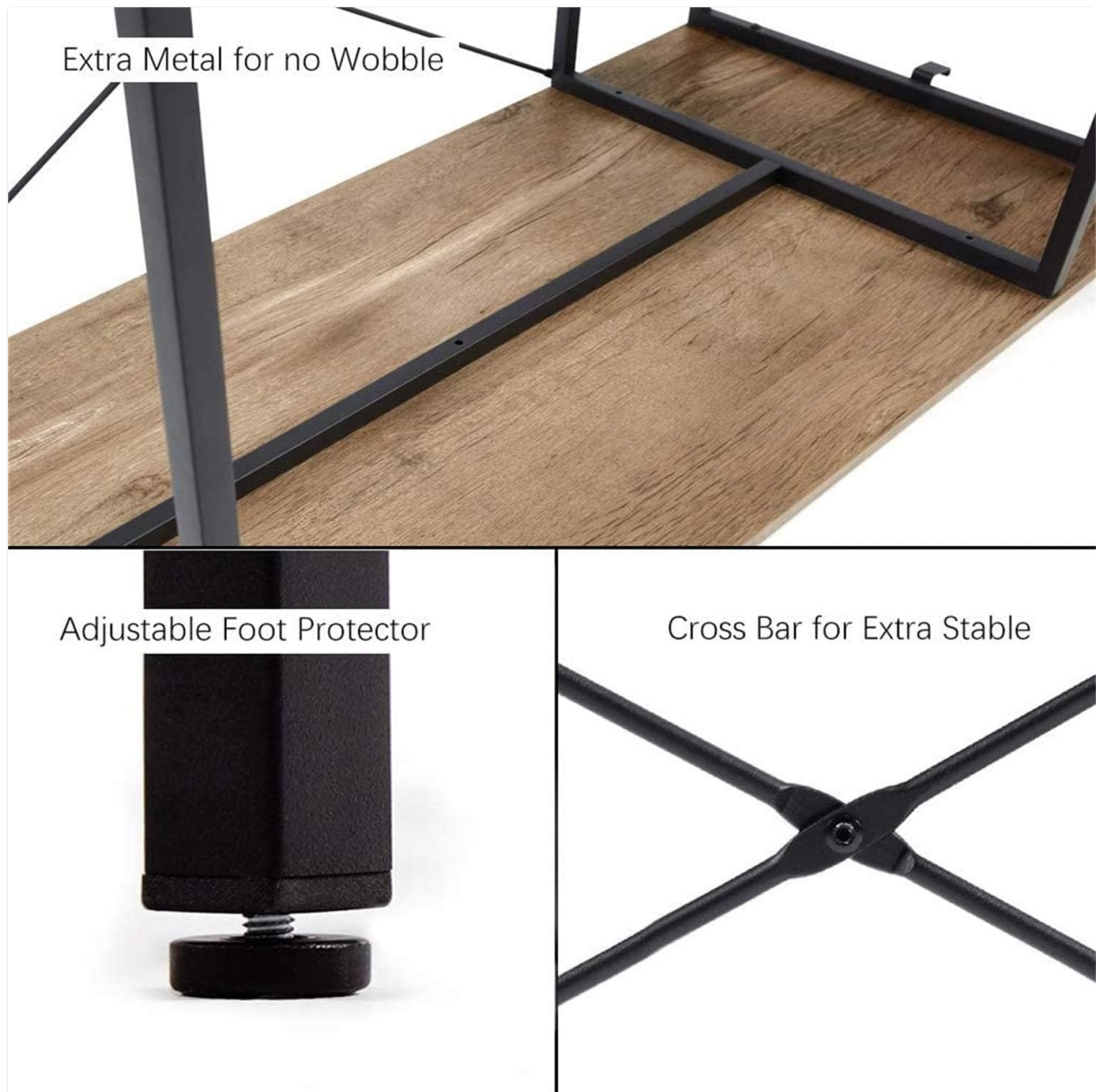
Figure 4: Stability features including adjustable feet and crossbar.