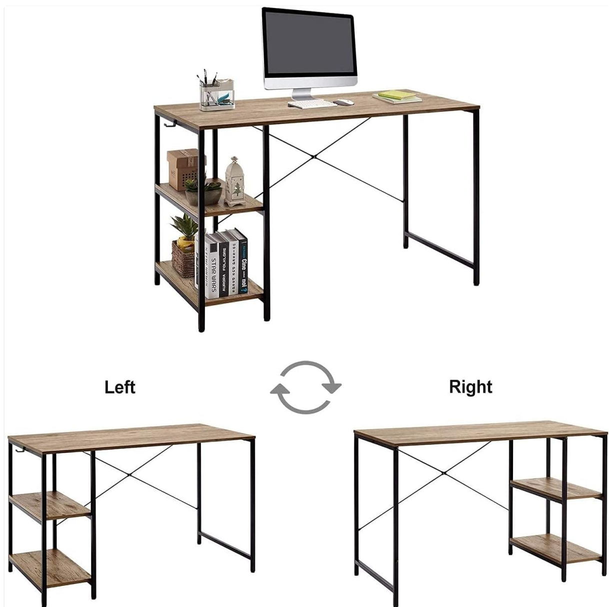
Figure 3: Reversible design for left or right shelf placement.