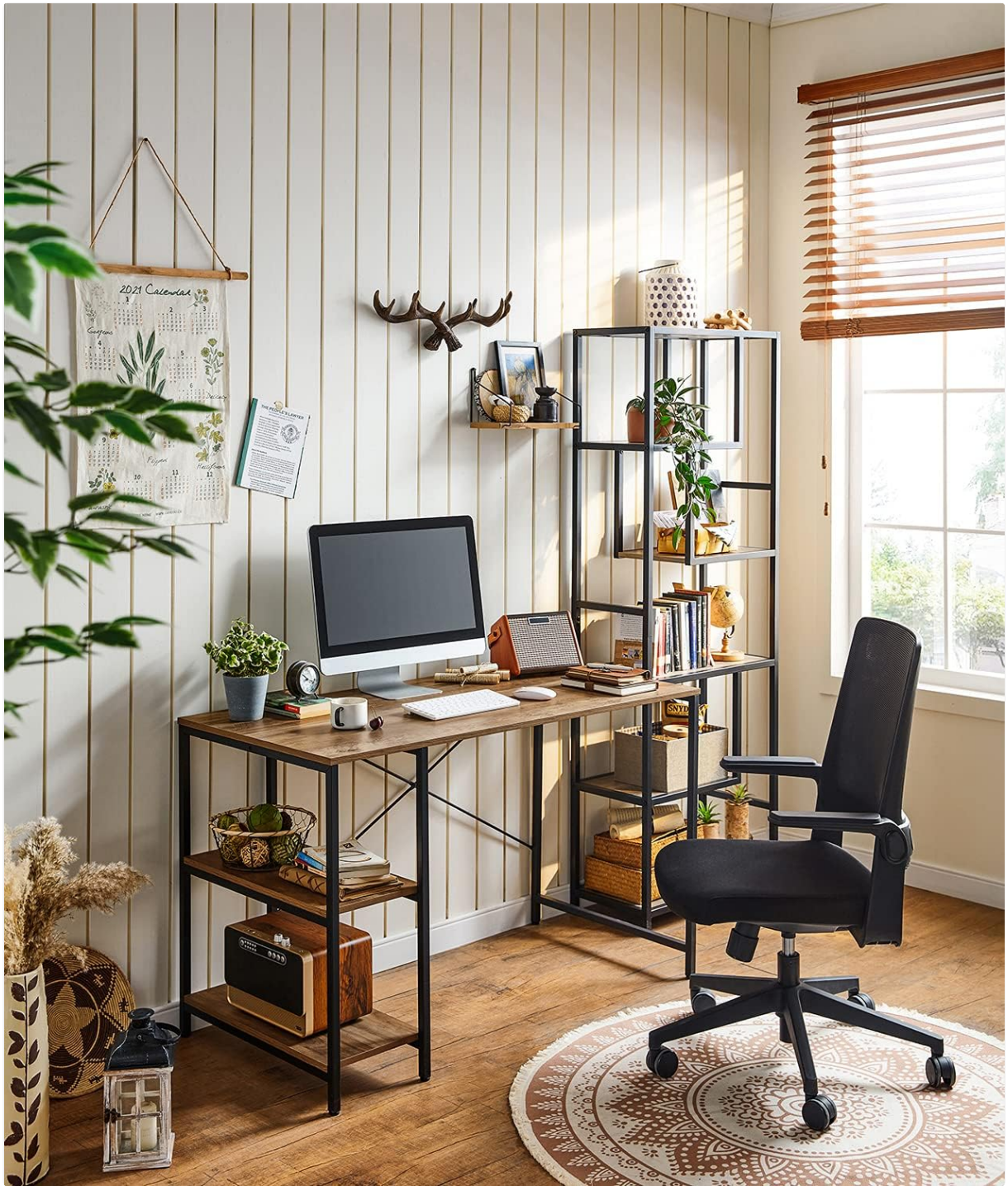
Figure 1: Overall view of the LINSY HOME 47-inch Computer Desk.