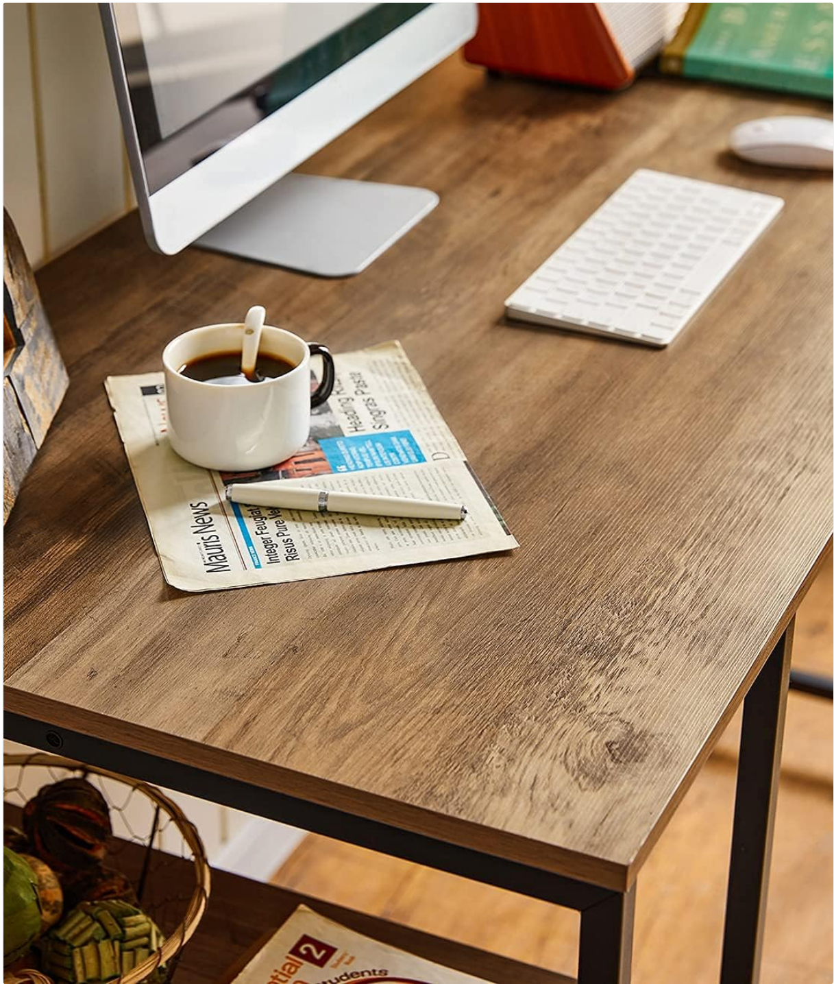
Figure 5: Close-up of the desk surface.