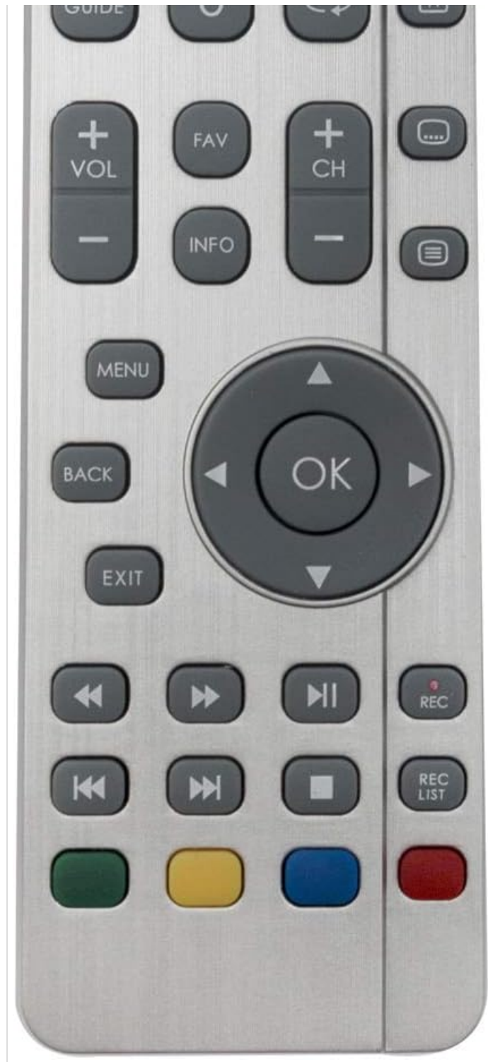
Image: Front view of the ALLIMITY DR0337 Remote Control, highlighting all buttons and their layout.