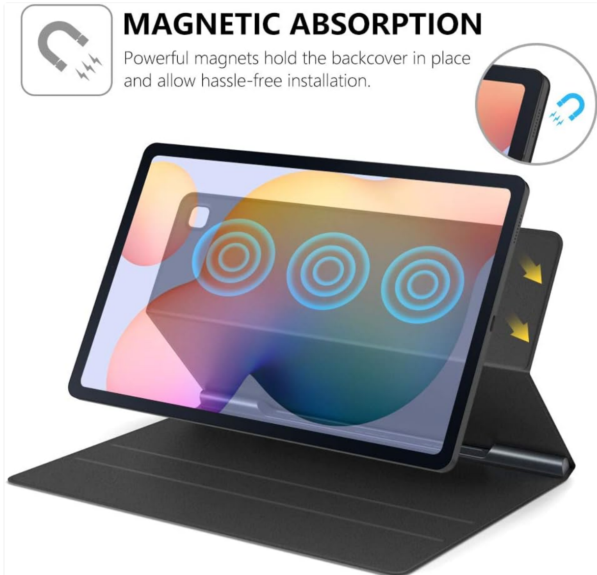
Image 2.1: This diagram illustrates the magnetic absorption mechanism, showing how the tablet is securely held in place by powerful magnets within the case.

The MoKo Magnetic Case utilizes strong magnets for secure attachment. Align your Samsung Galaxy Tab S6 Lite with the back panel of the case. The tablet will magnetically snap into place, ensuring a firm and precise fit without protruding edges.