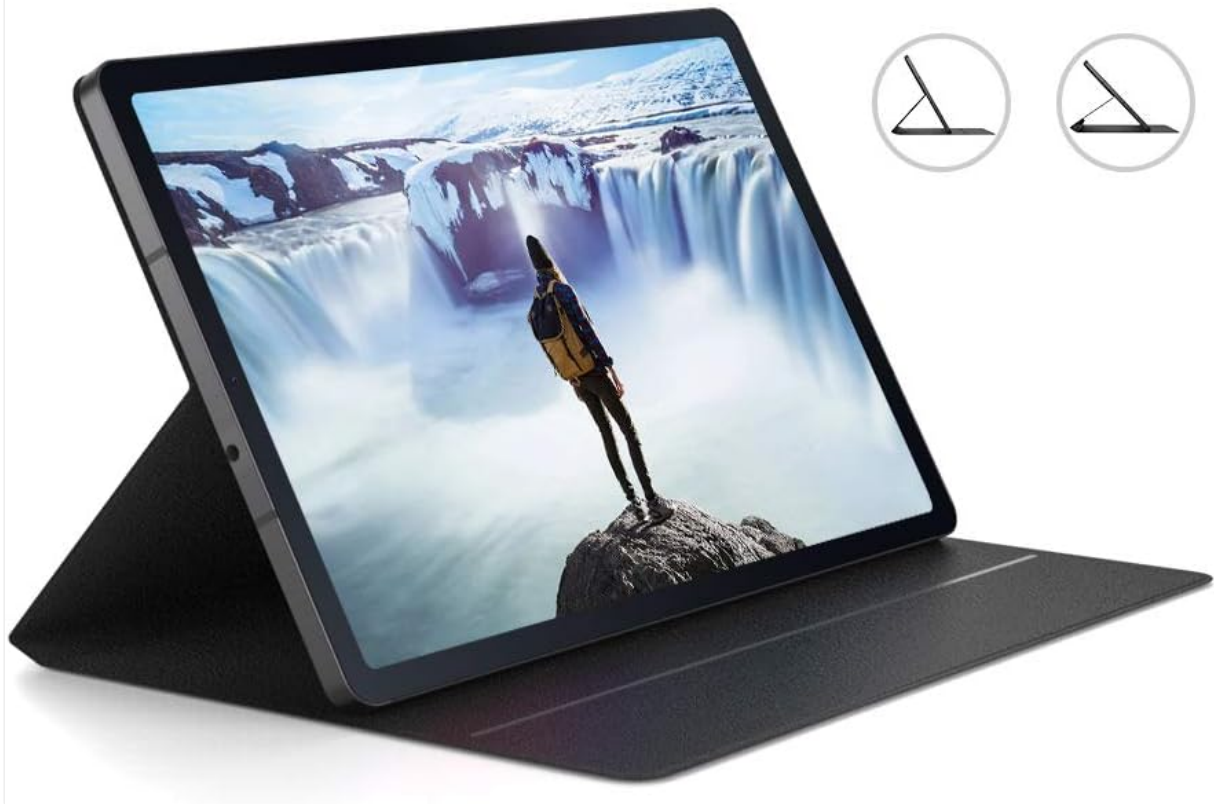
Image 3.2: This image shows the MoKo case configured as a trifold stand, supporting the tablet at an angle suitable for viewing or typing.

Multiple angles as desired anytime and anywhere.