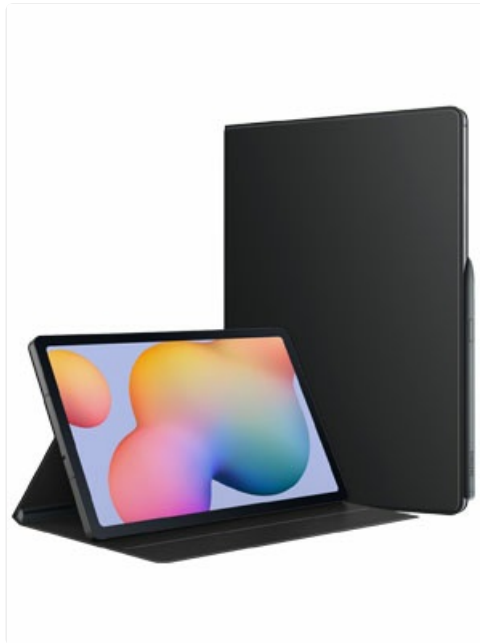
Image 2.2: This image shows the built-in S Pen slot, demonstrating how the S Pen is magnetically secured within the case's spine.