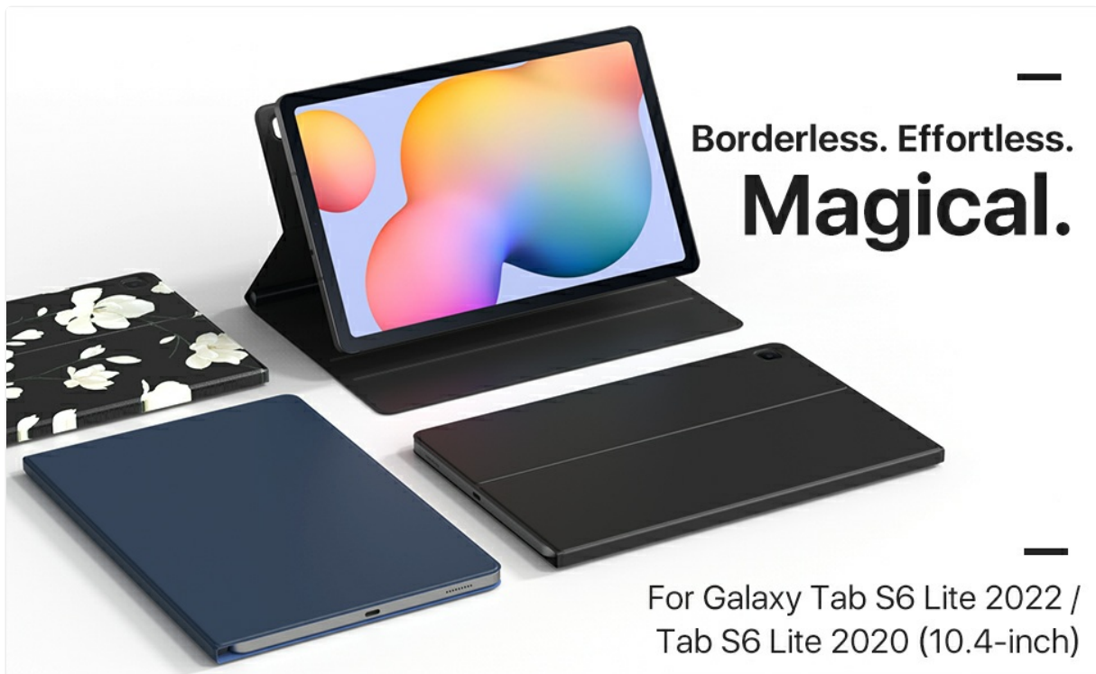
Image 1.1: This image illustrates the compatibility of the MoKo Magnetic Case, showing it is designed for Samsung Galaxy

This case is exclusively designed for the Samsung Galaxy Tab S6 Lite 10.4 Inch 2022/2020 models (SM-P613/P619/P610/P615). It is not compatible with Samsung Galaxy Tab S6 2019 or any other tablet models.