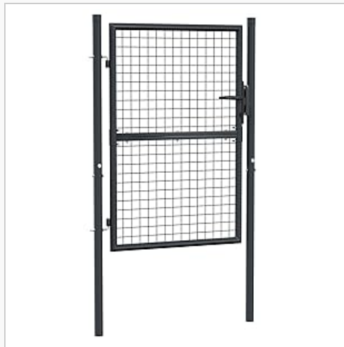
Image 3.1: Example of gate components. Actual components may vary slightly.