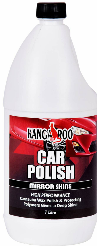
Figure 1: KANGAROO Car Wax Polish Mirror Shine 1 Litre bottle.