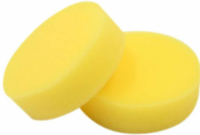
Figure 2: Included foam applicator for polish application.