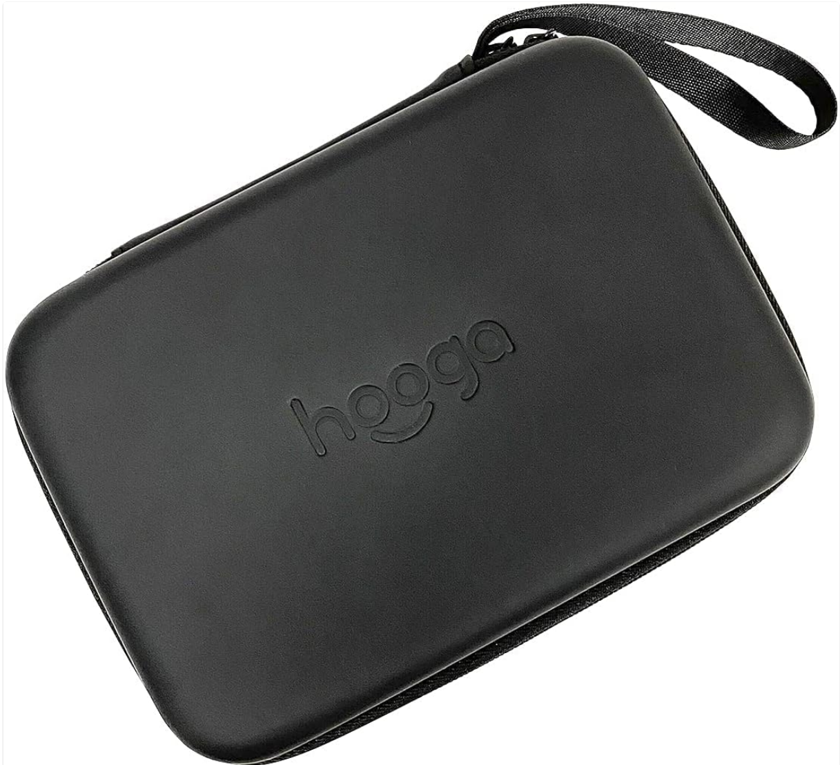
Image: The included sturdy, zippered carrying case for your Hooga Charge device and accessories.