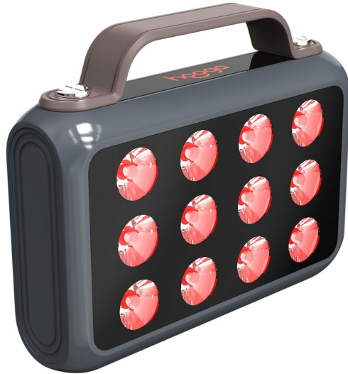
Image: The Hooga Charge device positioned on its stand for tabletop use.