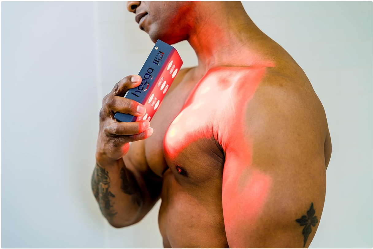
Image: Example of a user applying the Hooga Charge device to the shoulder area.