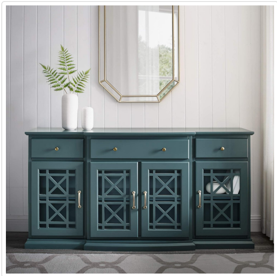
Angled front view of the Dark Teal Walker Edison Sideboard, showcasing its design and color.