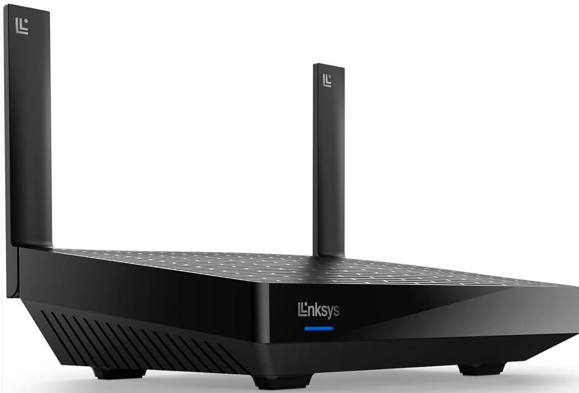
Figure 1: Linksys MR7350 Dual-Band Mesh WiFi 6 Router