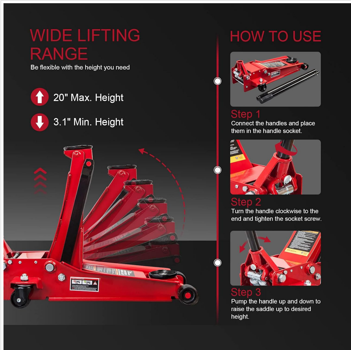
Figure 4.1: Visual guide for connecting the handle and preparing the jack for use.