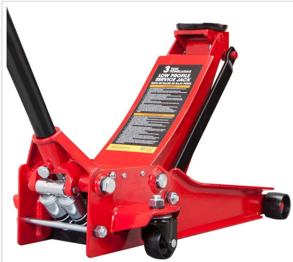
Figure 3.1: Overall view of the BIG RED ATZ830026XR Torin Hydraulic Ultra Low Profile 3 Ton Floor Jack.

Familiarize yourself with the main components of your BIG RED ATZ830026XR floor jack.