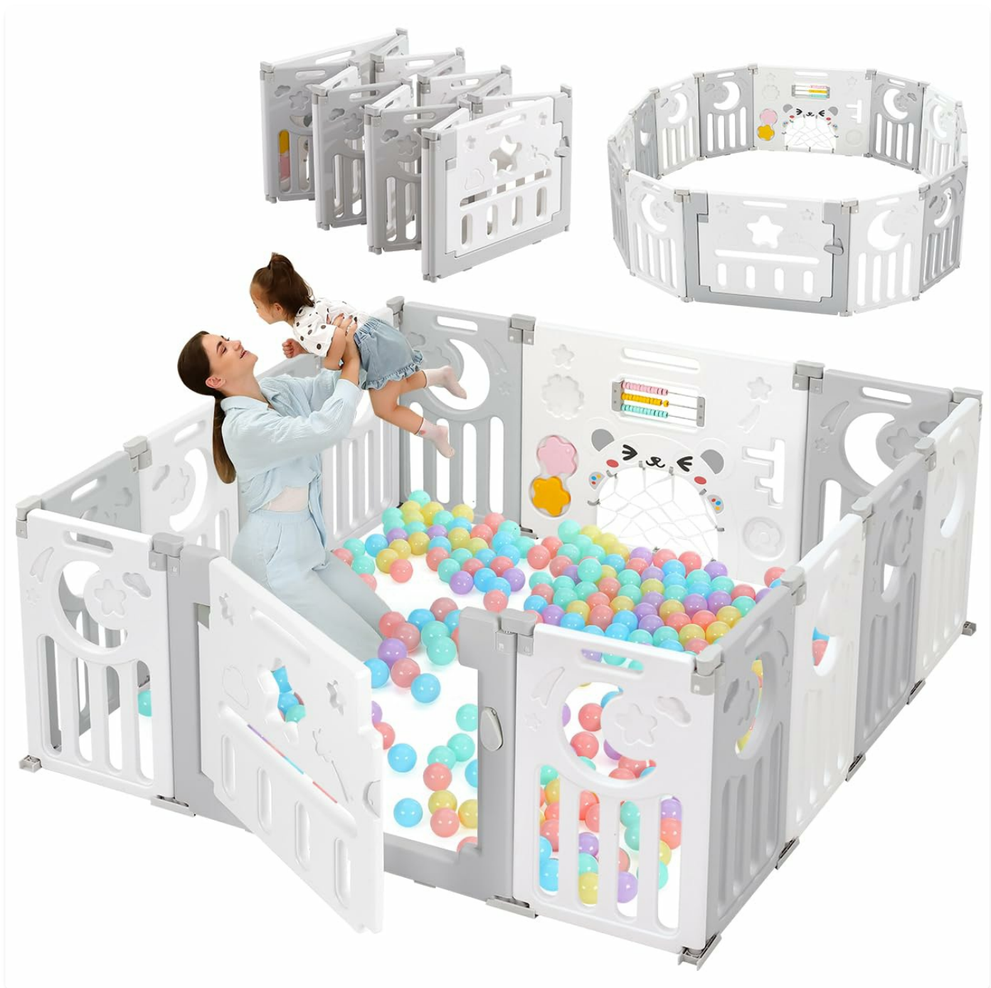
Image: The Dripex Foldable Baby Playpen in a large, rectangular configuration, showing a parent and child playing with colorful balls inside. The playpen features a gate and an activity panel.