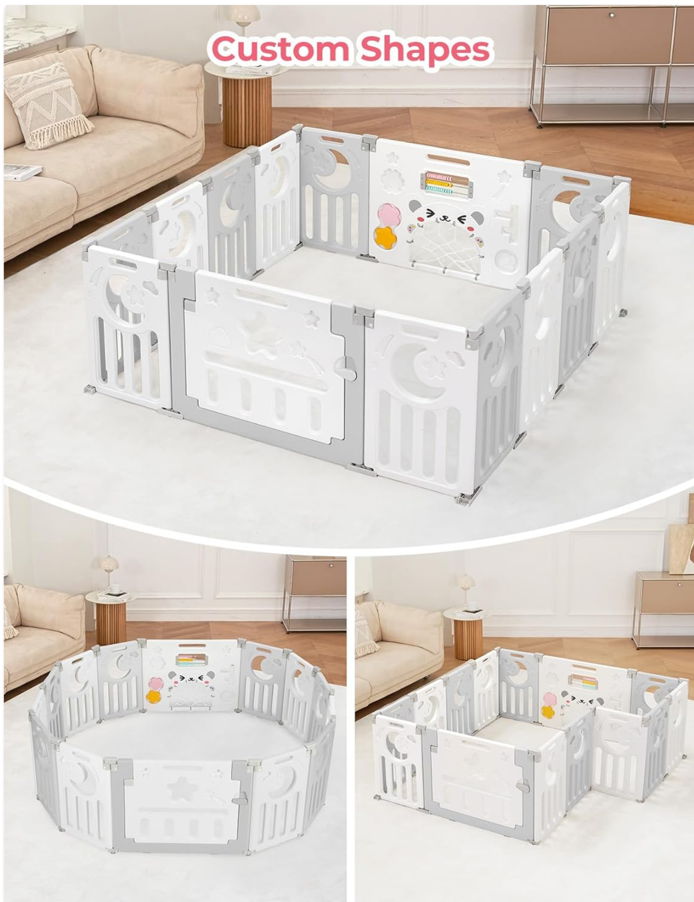
Image: Examples of custom shapes that can be created with the playpen panels, illustrating its flexibility in adapting to different spaces.