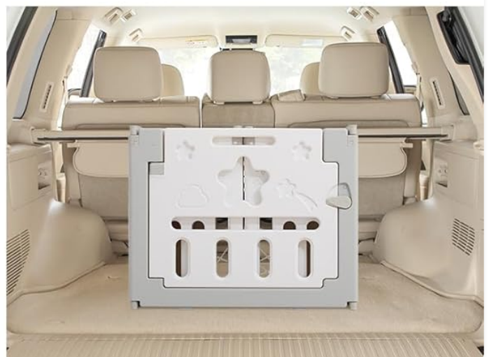
Image: Demonstration of the playpen's foldable design, showing how panels can be pulled up and removed for compact storage or transport in a car trunk.